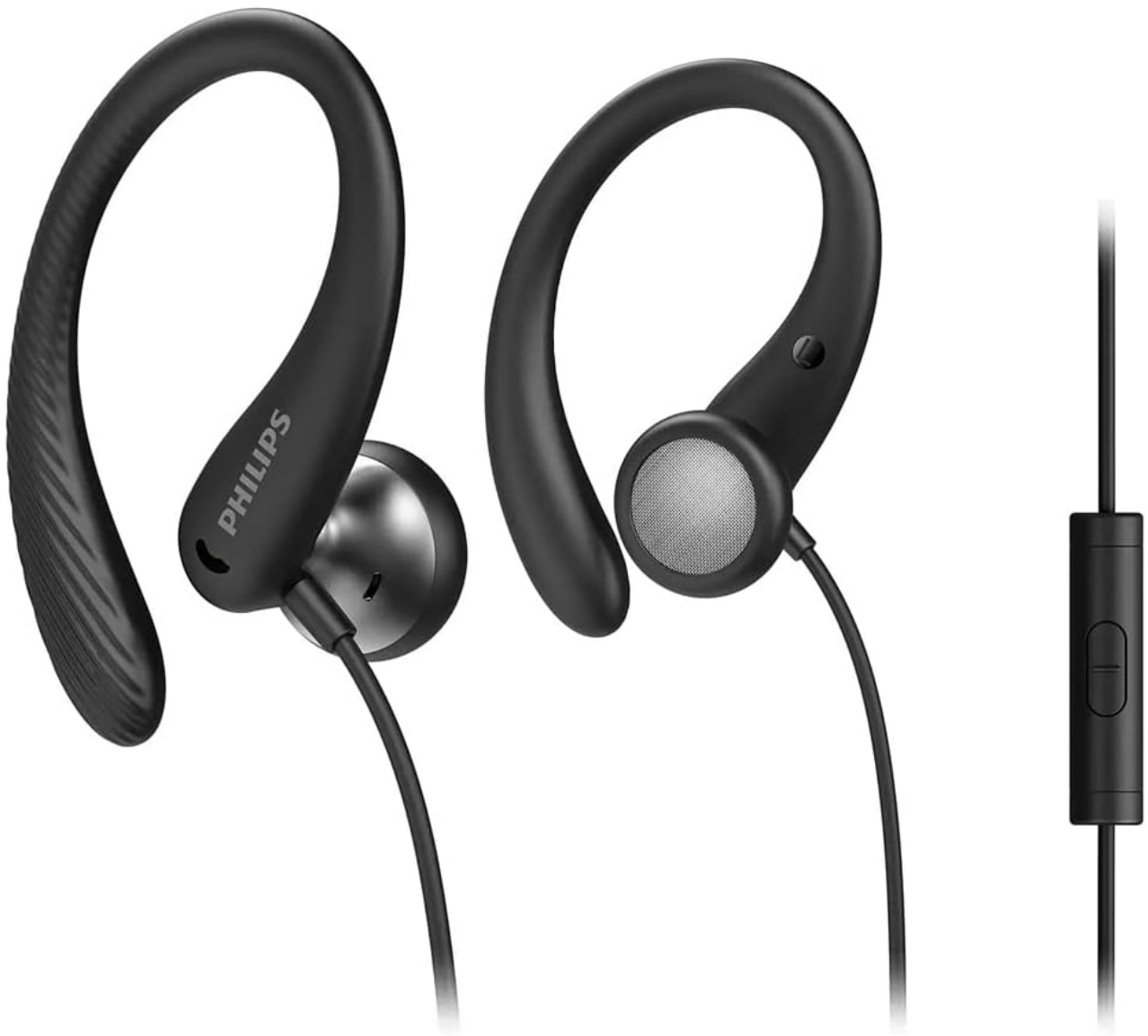
Figure 1: Philips TAA1105BK/00 Sports In-Ear Headphones.