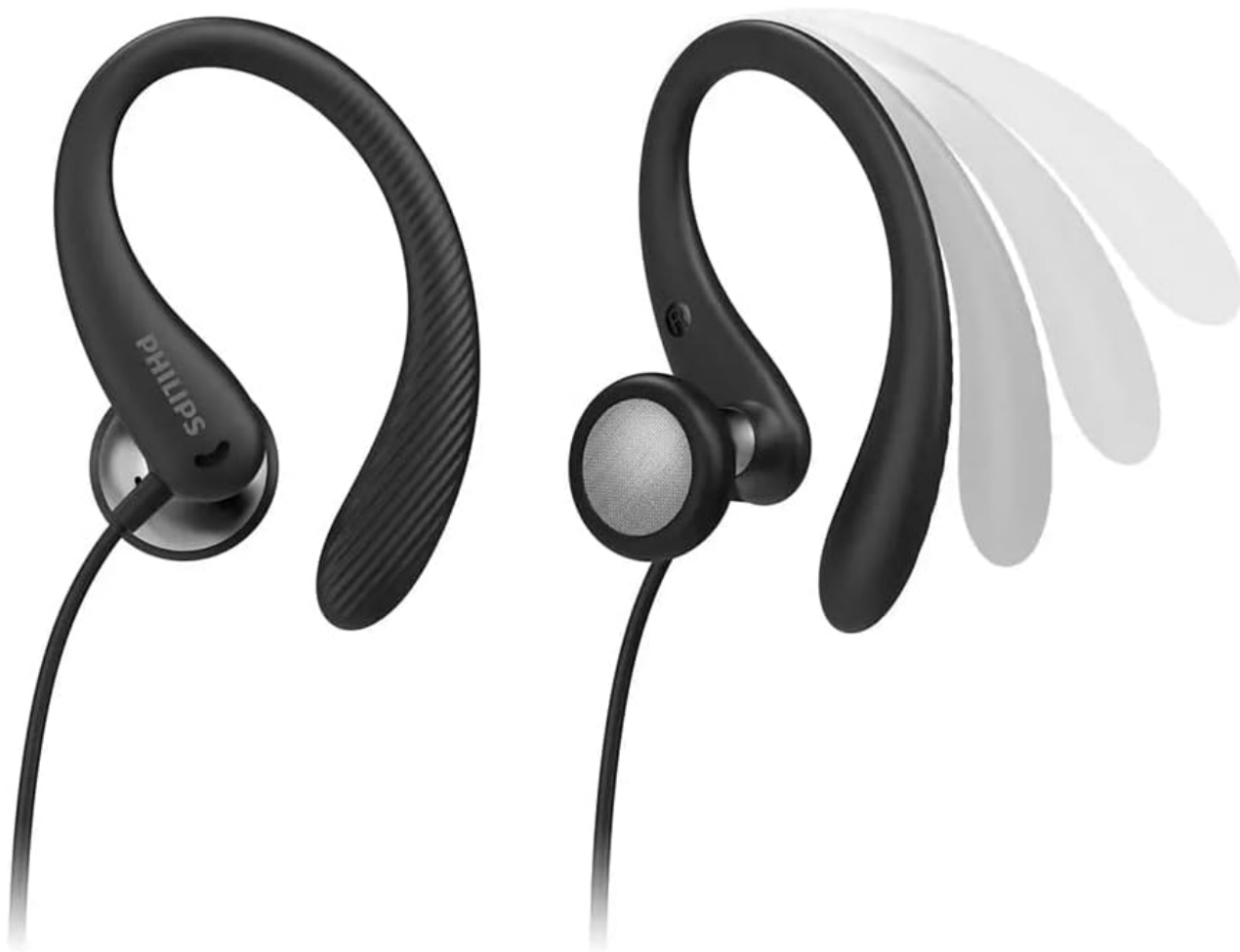
Figure 3: Flexible ear hooks for a secure fit.