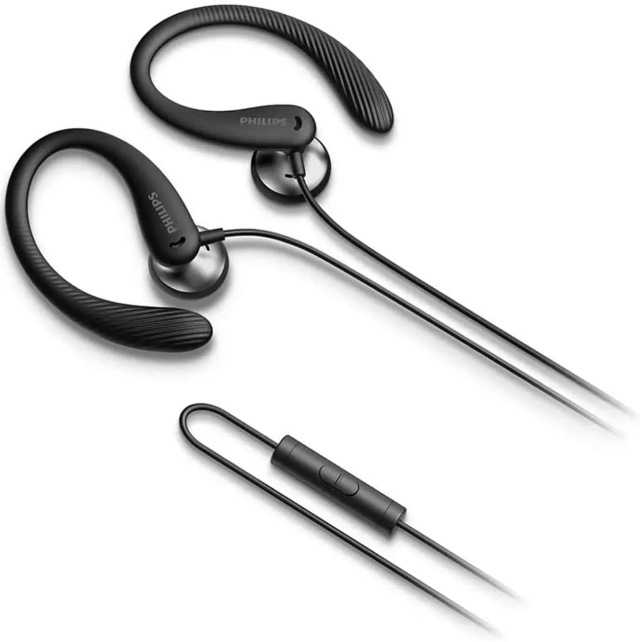
Figure 2: Headphones with in-line remote for control.