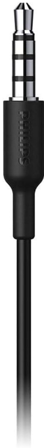
Figure 4: The 3.5 mm audio jack for device connection.