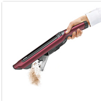
Image: A handheld vacuum unit being held over a trash can, with dust and debris being released from the dust cup by pressing a button.

The one-touch dust disposal system allows for hygienic emptying without touching the dirt.