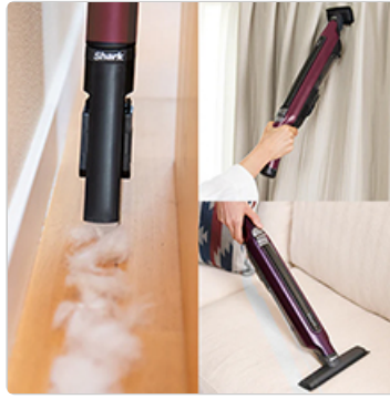
Image: A collage of three images demonstrating the handheld vacuum's versatility: cleaning a narrow crevice, dusting curtains, and vacuuming a sofa with different attachments.