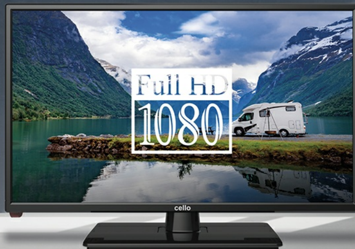
Image 1.2: Experience clear and detailed images with Full HD 1080p resolution.

La résolution Full HD à haute densité de pixels (1920 x 1080 pixels) vous permet d'obtenir des images plus nettes et plus détaillées.