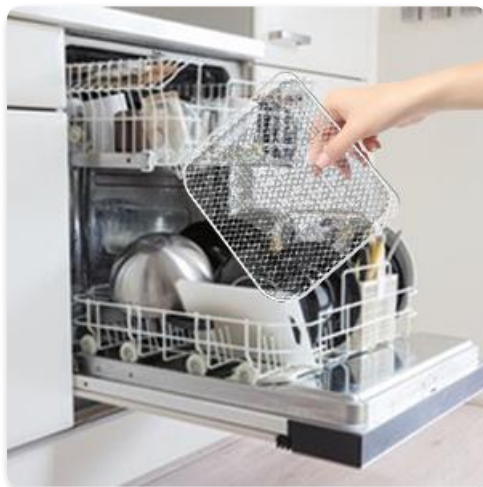
Figure 6.1: Dishwasher-safe accessories for convenient cleaning.