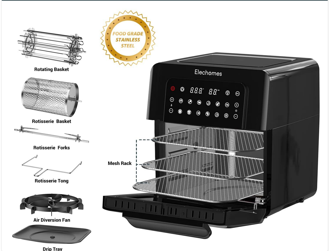
Figure 3.1: Included accessories for the Elechomes Air Fryer Oven.