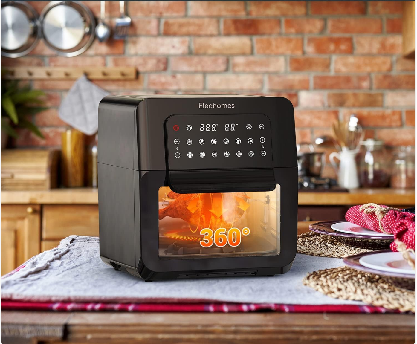
Figure 5.2: Fast Hot Air Circulation with 360-degree spin for even cooking.

With innovative double fan design and 360 degrees spin, the air fryer makes food more evenly heated in less time.