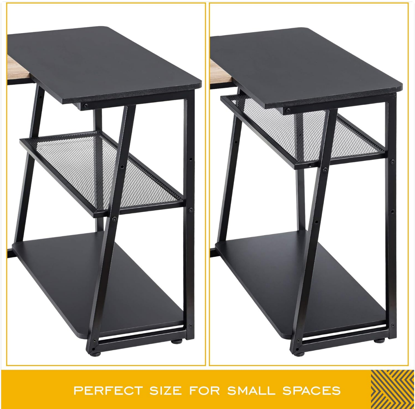
Image: Detailed view of the desk's features, including the adjustable leveling feet at the base of the metal frame, the waterproof desktop surface, and the sturdy mesh shelf.