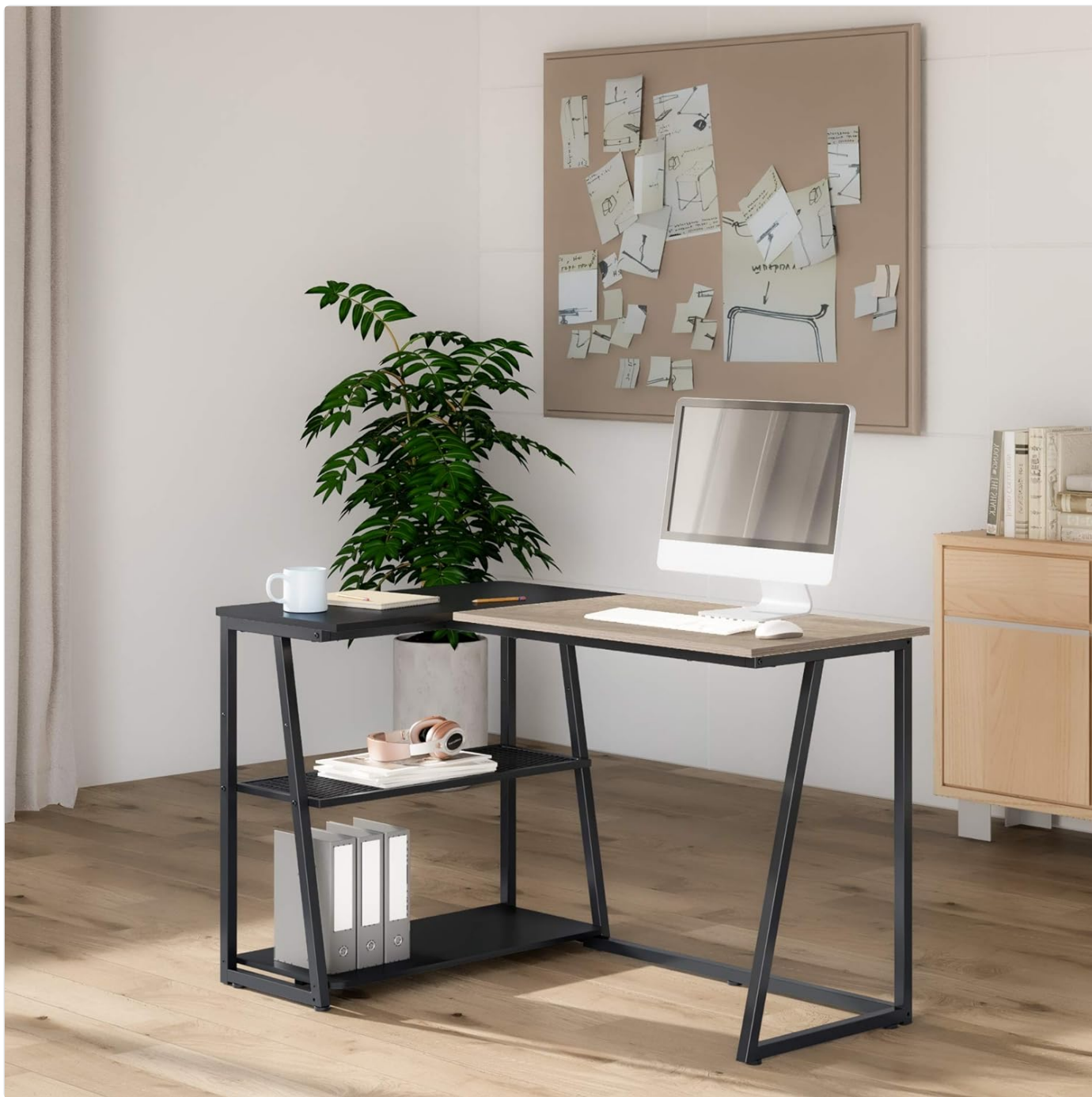
Image: The HOMOOO L-Shaped Computer Desk integrated into a modern office environment, demonstrating its functional design and aesthetic appeal with a computer setup and plant.