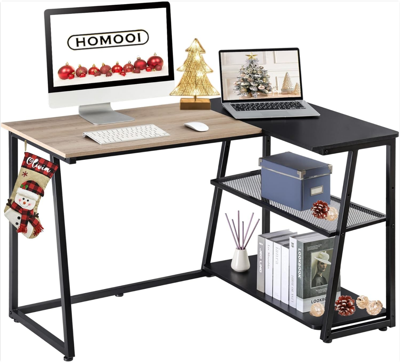
Image: The HOMOOI L-Shaped Computer Desk, showcasing its spacious design with a monitor, laptop, and decorative items. This desk is designed for efficient use of corner spaces in home offices or study areas.