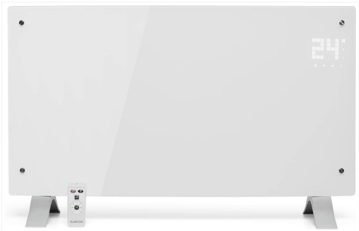
Image: The KLARSTEIN Bornholm heater with its remote control placed in front, illustrating the control options.