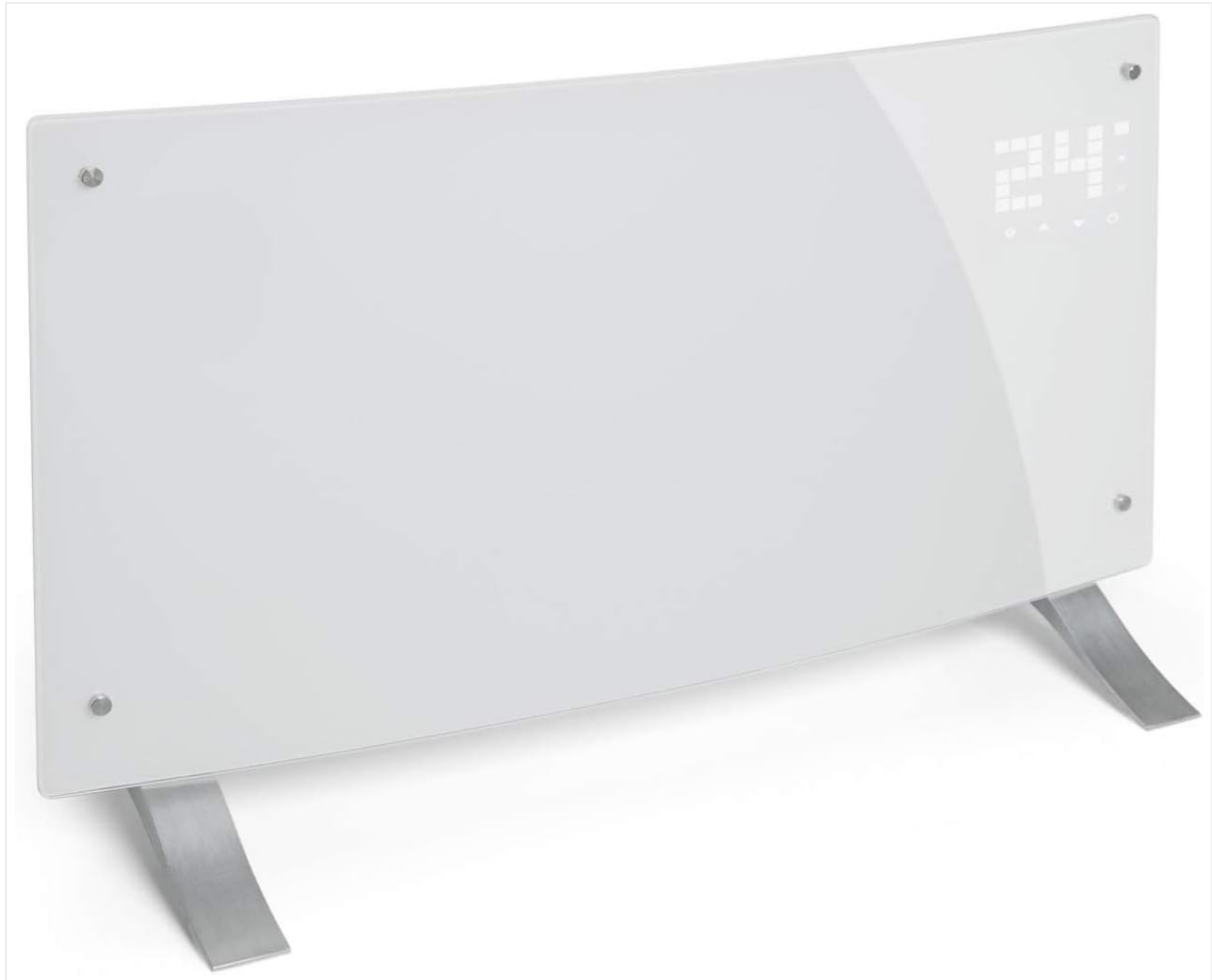
Image: Front view of the KLARSTEIN Bornholm heater with its feet attached, displaying a digital temperature.

The KLARSTEIN Bornholm 1500 Watt Convection Heater is a curved, wall-mountable or freestanding space heater designed for indoor use. It features an LED display, remote control, ECO mode, and a timer function for efficient and convenient heating.