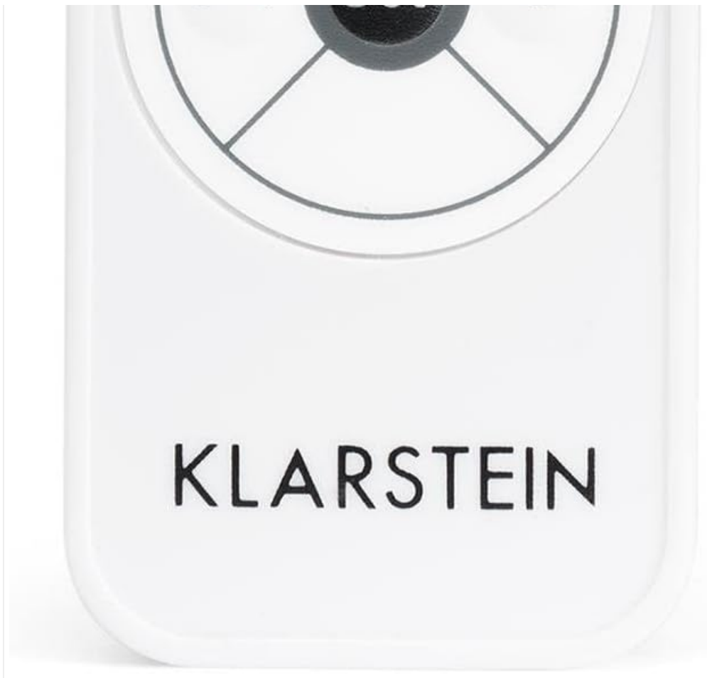
Image: Detailed view of the remote control for the heater, showing power, mode, ECO, set, and directional buttons.