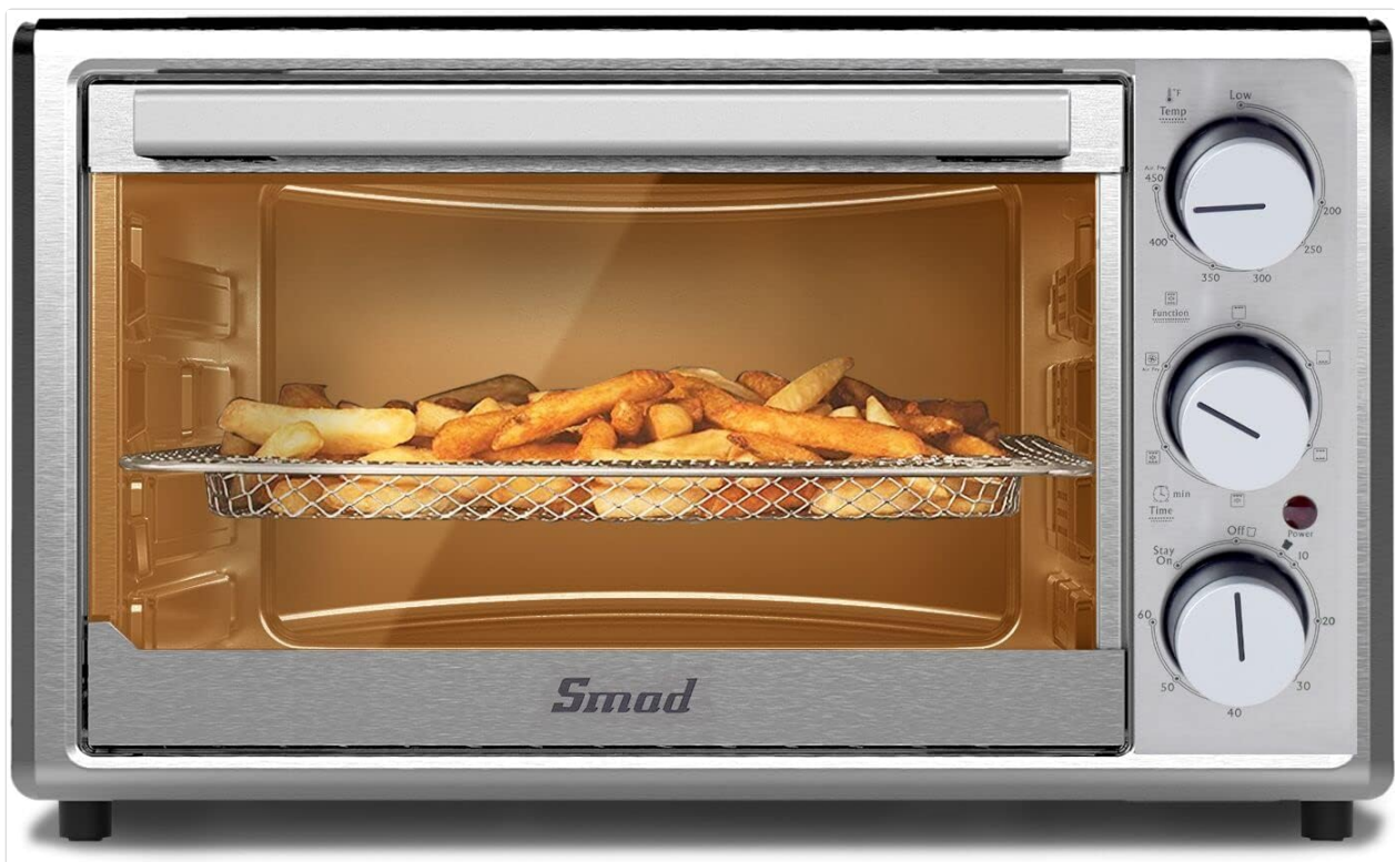
Image: Front view of the Smad Air Fryer Toaster Oven, showing the oven cavity with an air fry basket containing fries, and the control panel on the right.