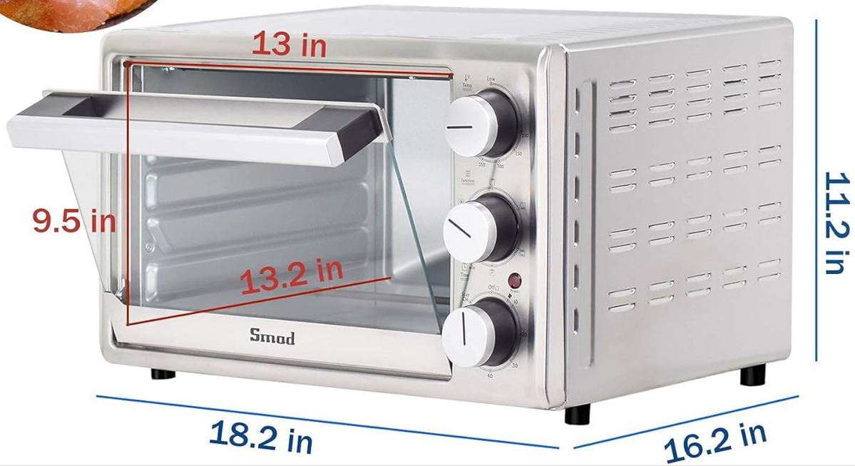
Image: The Smad Air Fryer Toaster Oven with its external dimensions (18.2 in width, 16.2 in depth, 11.2 in height) and internal cavity dimensions (13 in width, 13.2 in depth, 9.5 in height) clearly marked.