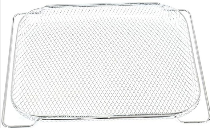
Air Fry Basket