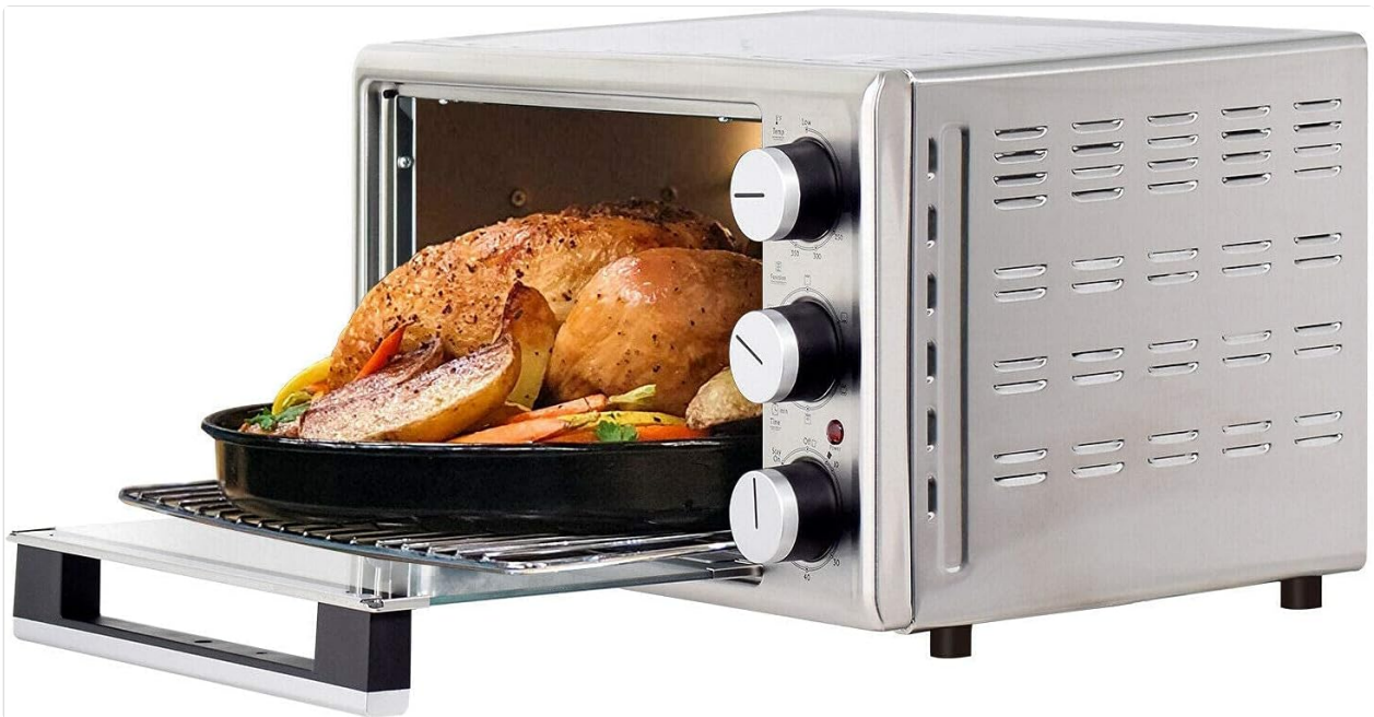
Image: The Smad Air Fryer Toaster Oven with its door open, revealing a roasted chicken and vegetables on a tray inside, demonstrating its capacity for larger items.