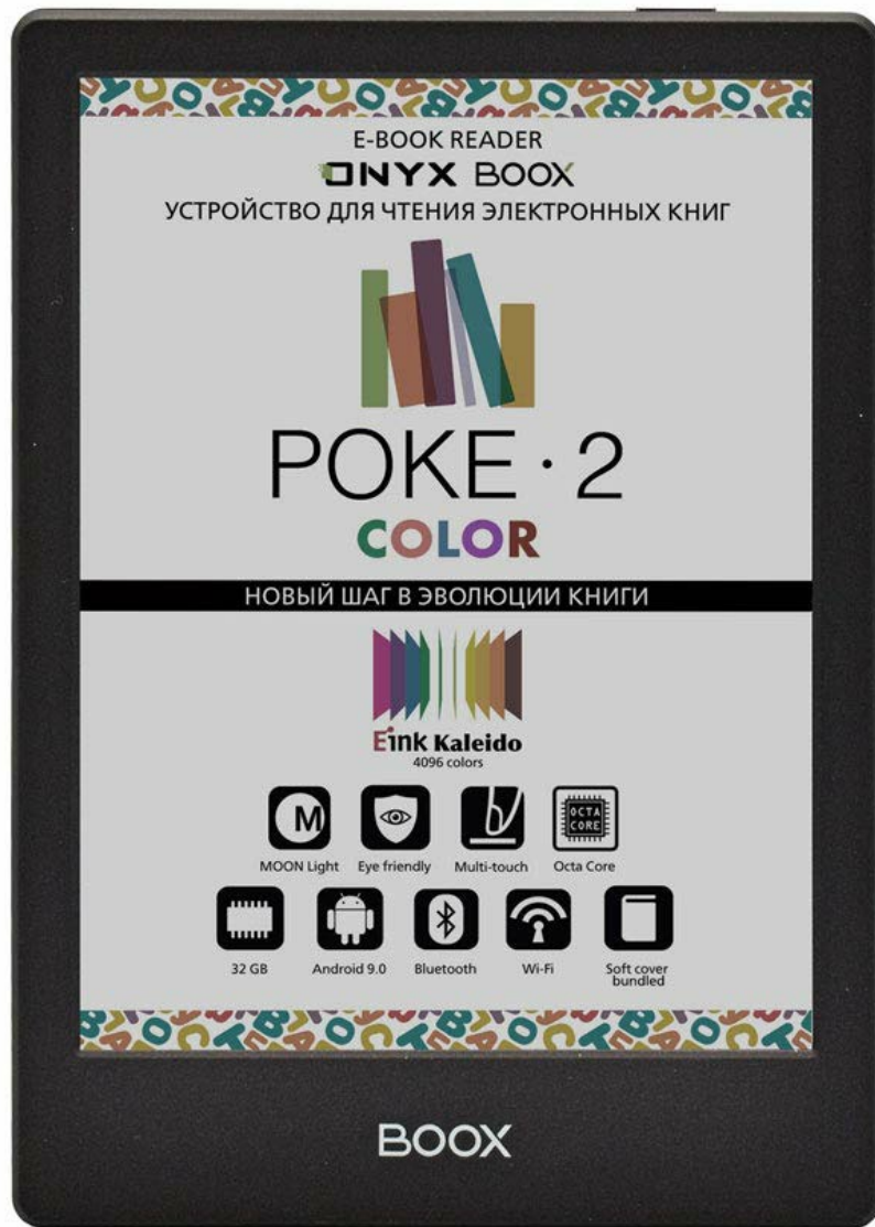
Image: Front view of the ONYX BOOX Poke 2 Color e-reader, displaying its screen.