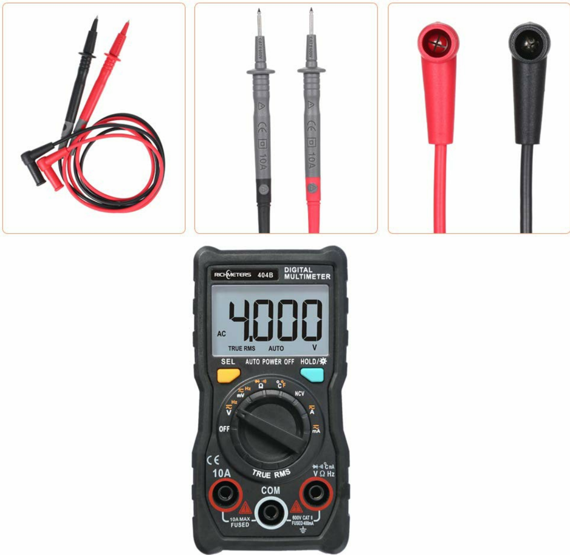
Image: The RICHMETERS RM404B Digital Multimeter shown with its included red and black test leads.