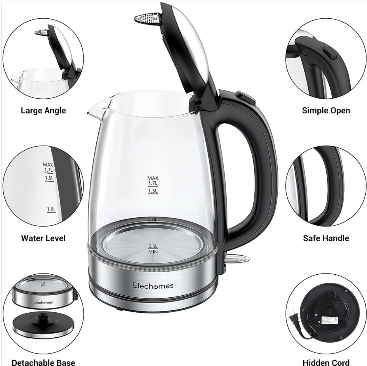
Image: Detailed view of the Elechomes Electric Kettle highlighting its key components such as the large angle lid opening, simple open button, safe handle, water level markings, detachable base, and hidden cord storage.

Familiarize yourself with the parts of your Elechomes Electric Glass Kettle: