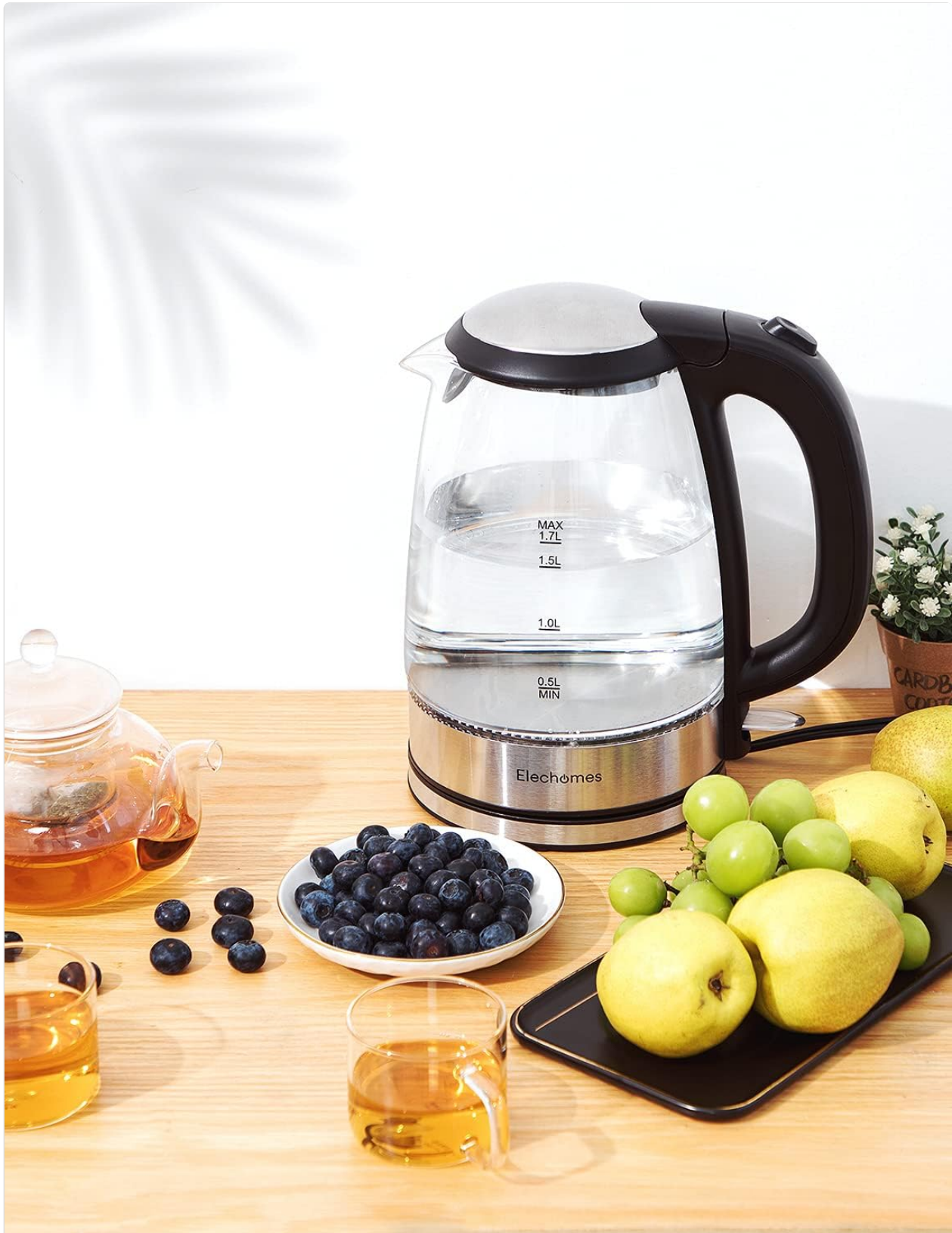
Image: The Elechomes Electric Kettle in operation, with water boiling and the blue LED light activated, indicating the heating process.