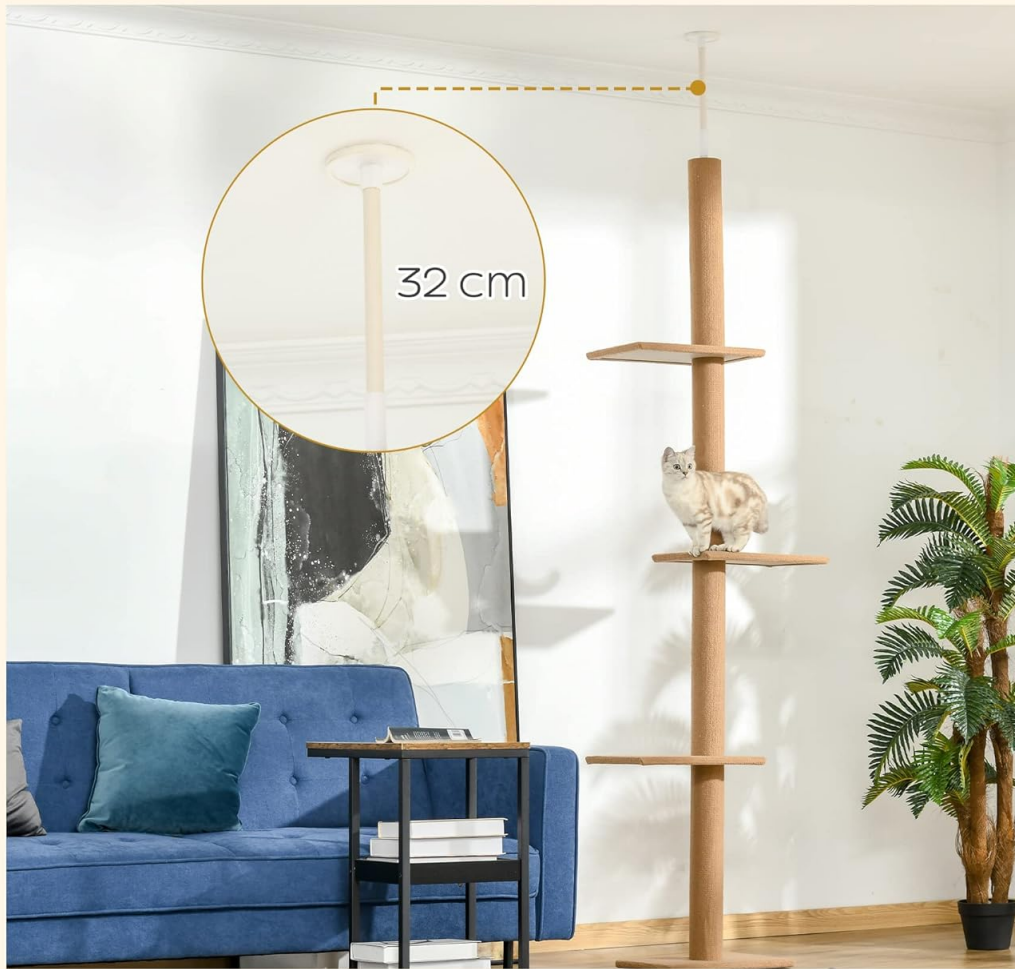
Figure 2: Detail of the adjustable top pipe, which uses a tension mechanism to secure the cat tree to the ceiling.