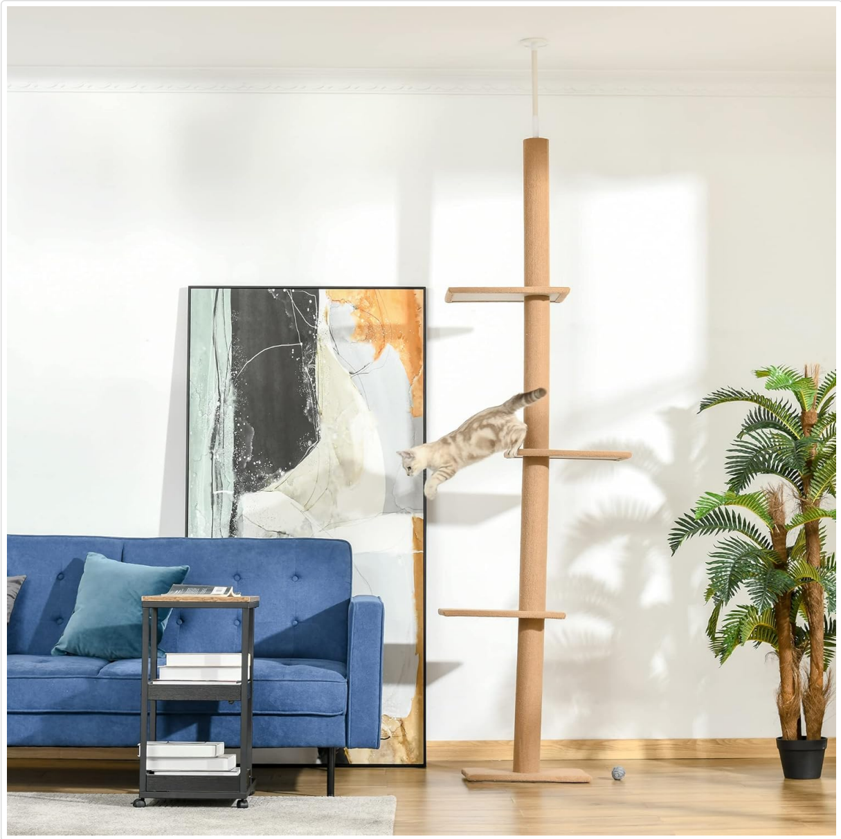
Figure 3: A cat utilizing the multi-level platforms for climbing and exploration.