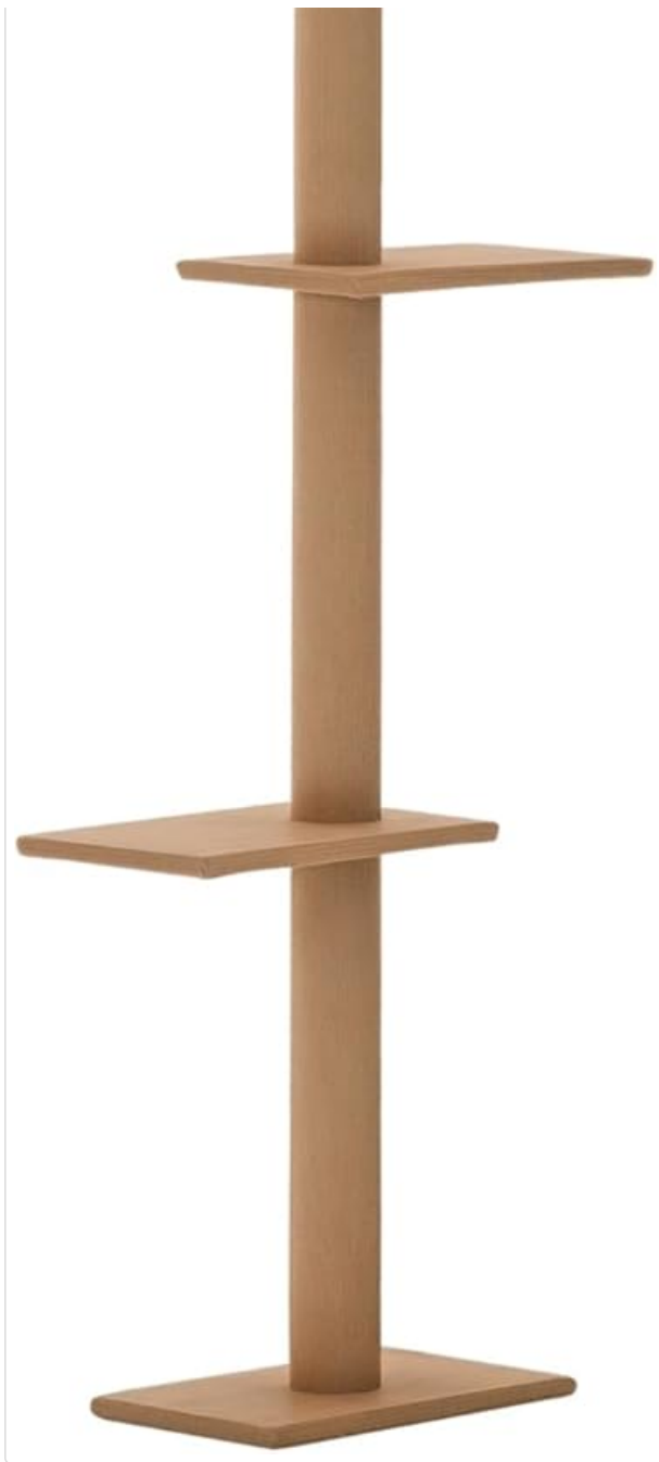
Figure 1: Fully assembled PawHut Floor-to-Ceiling Cat Tree.