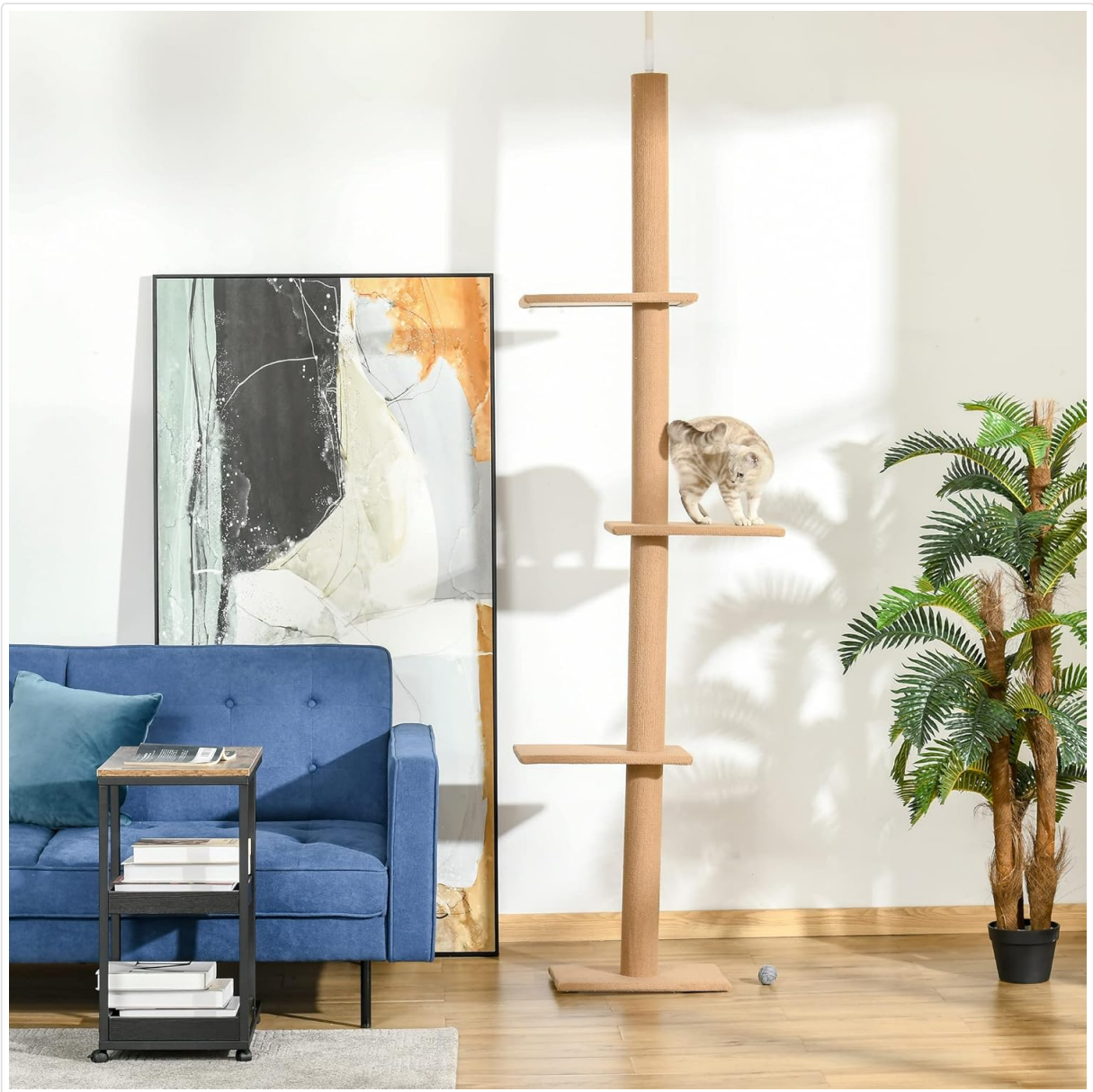
Figure 4: Detail of the sisal-wrapped post for scratching and the soft platform for resting.