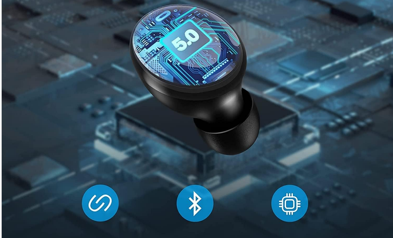
Figure 6: Bluetooth 5.0 Features. This image highlights the advanced Bluetooth 5.0 technology integrated into the earbuds, emphasizing benefits such as fast connection, stable transmission, low latency, and reduced power consumption.

Fast connection, Stable transmission Low latency and low power consumption