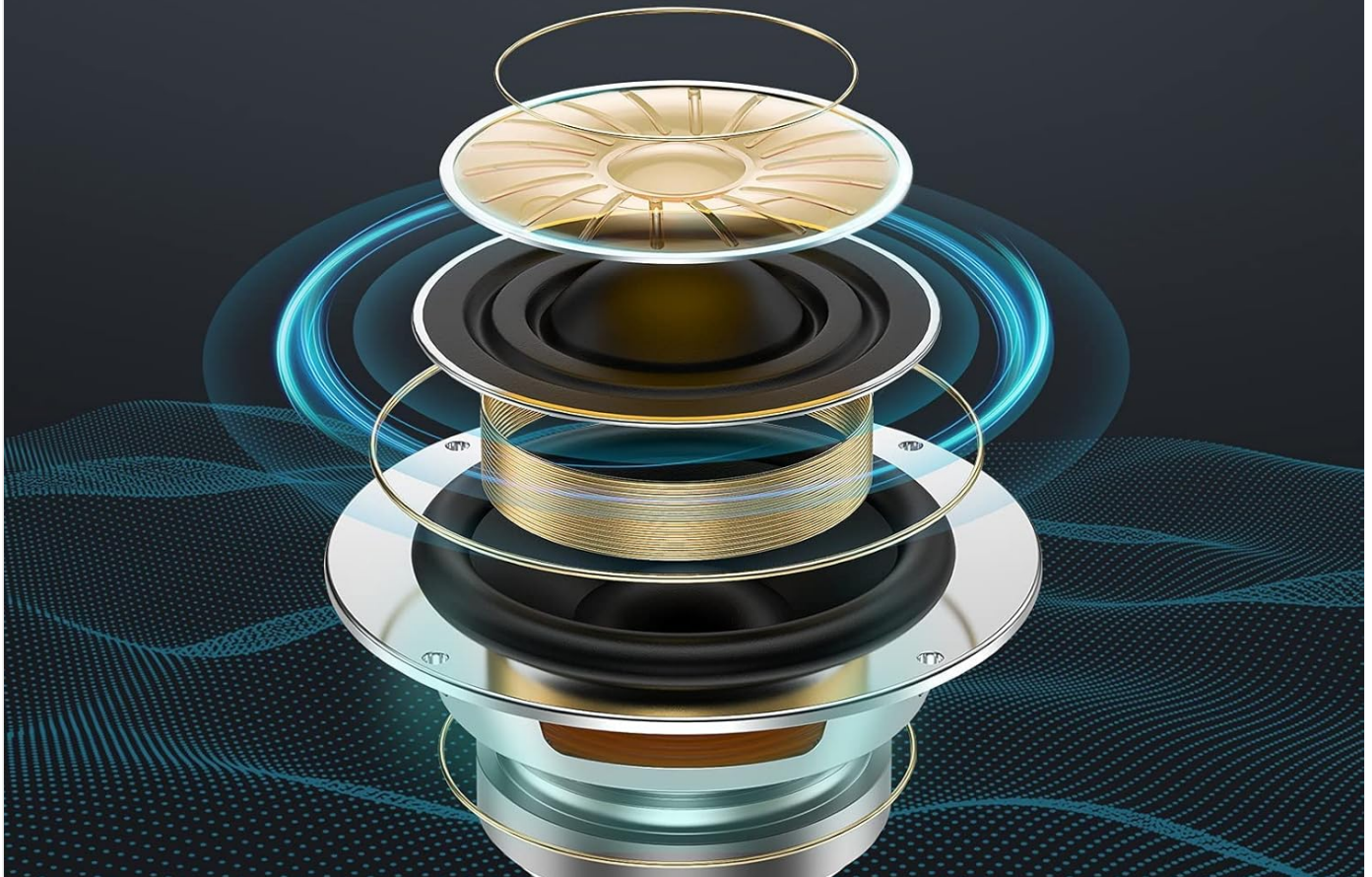
Figure 2: Internal Speaker Structure. This diagram shows the layered components of the earbud's speaker, emphasizing the dual 6mm drivers designed for enhanced bass and high-definition sound quality.