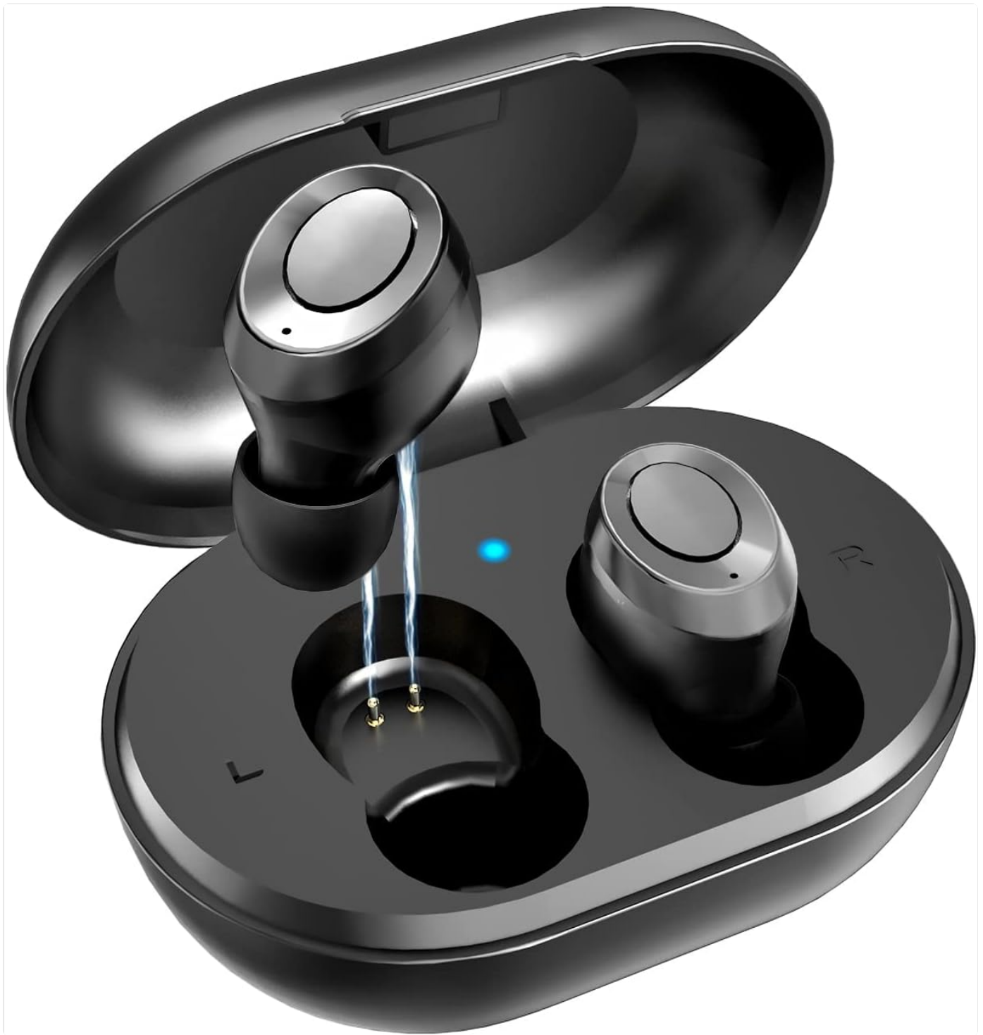
Figure 1: xixi Bluetooth Earbuds and Charging Case. The image displays the two earbuds resting in their open charging case, with a blue indicator light visible, suggesting charging or power status.