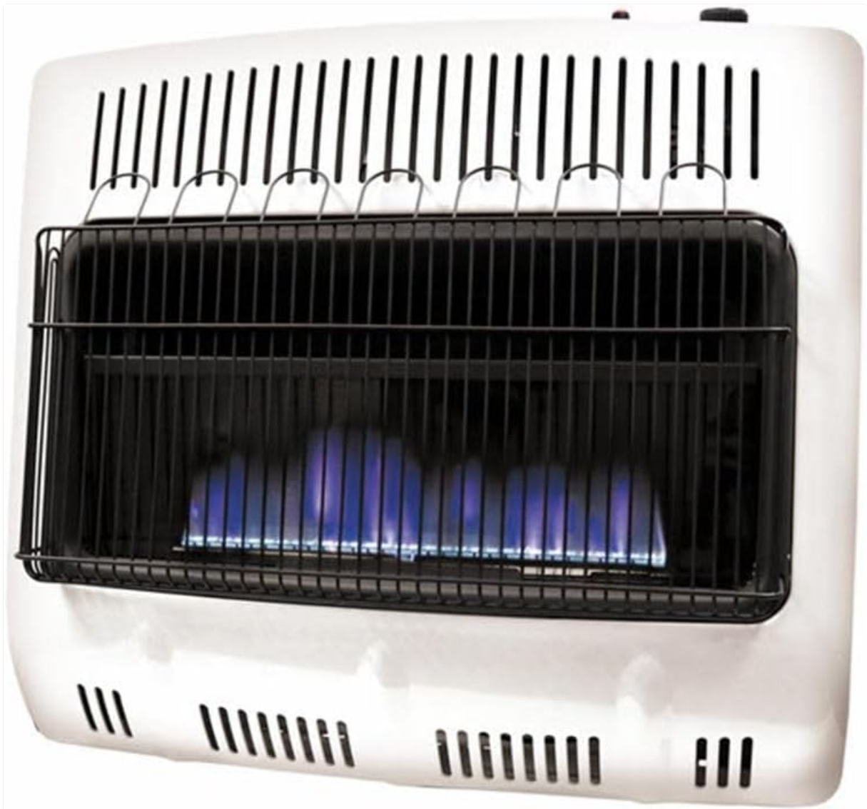
Image: Front view of the Mr. Heater 30,000 BTU Vent Free Blue Flame Dual Fuel Heater, showing the blue flame burner behind a protective grate.