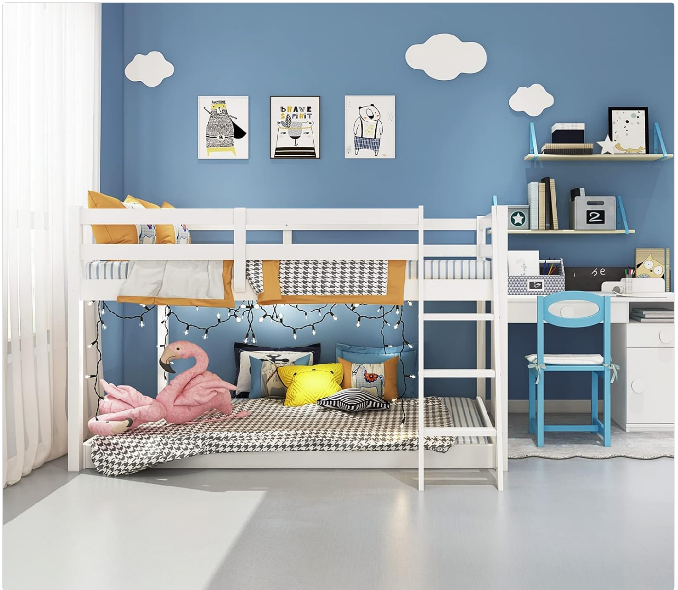
Image: The Bonnlo Low Loft Bed configured with a second bed placed underneath, showcasing its space-saving versatility.