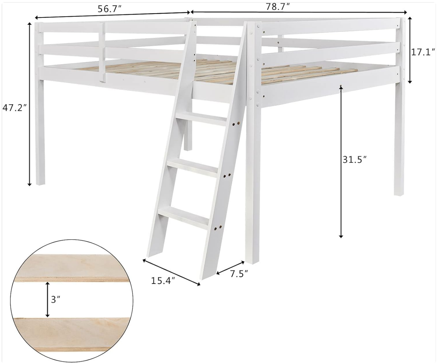
Image: Detailed dimensions of the Bonnlo Low Loft Bed, including length, width, height, and under-bed clearance.