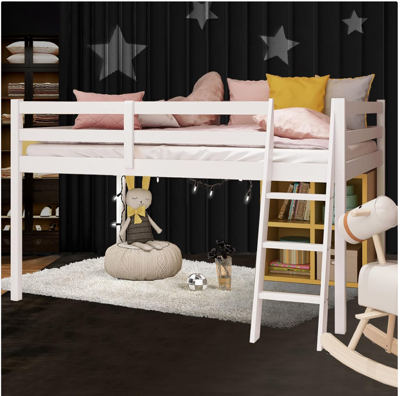
Image: The Bonnlo Low Loft Bed, fully assembled, featuring its low profile and inclined ladder, providing space underneath.