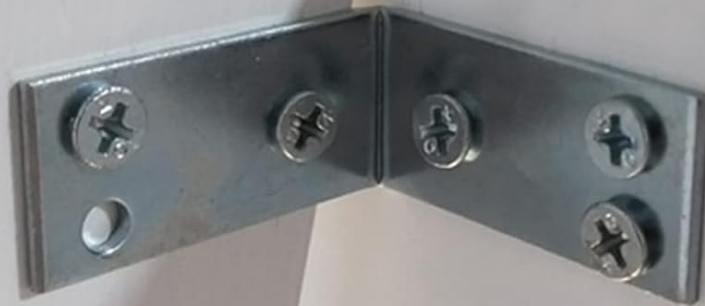
Image: Close-up view of the L-shaped metal plate, demonstrating how it reinforces the ladder for increased stability.