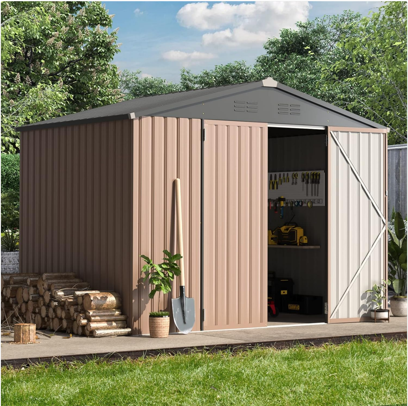
Image 1.1: U-MAX 8' x 6' Metal Outdoor Storage Shed. This image shows the assembled shed in a typical outdoor environment, highlighting its design and size.