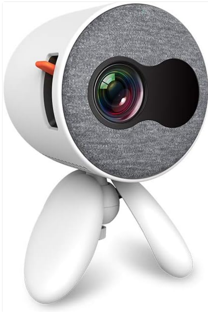
Image: Front view of the Bitmore FLIX Projector, highlighting the projection lens and integrated speaker area.