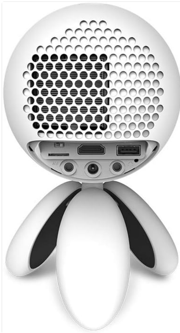
Image: Rear view of the projector, detailing the various input and output ports.