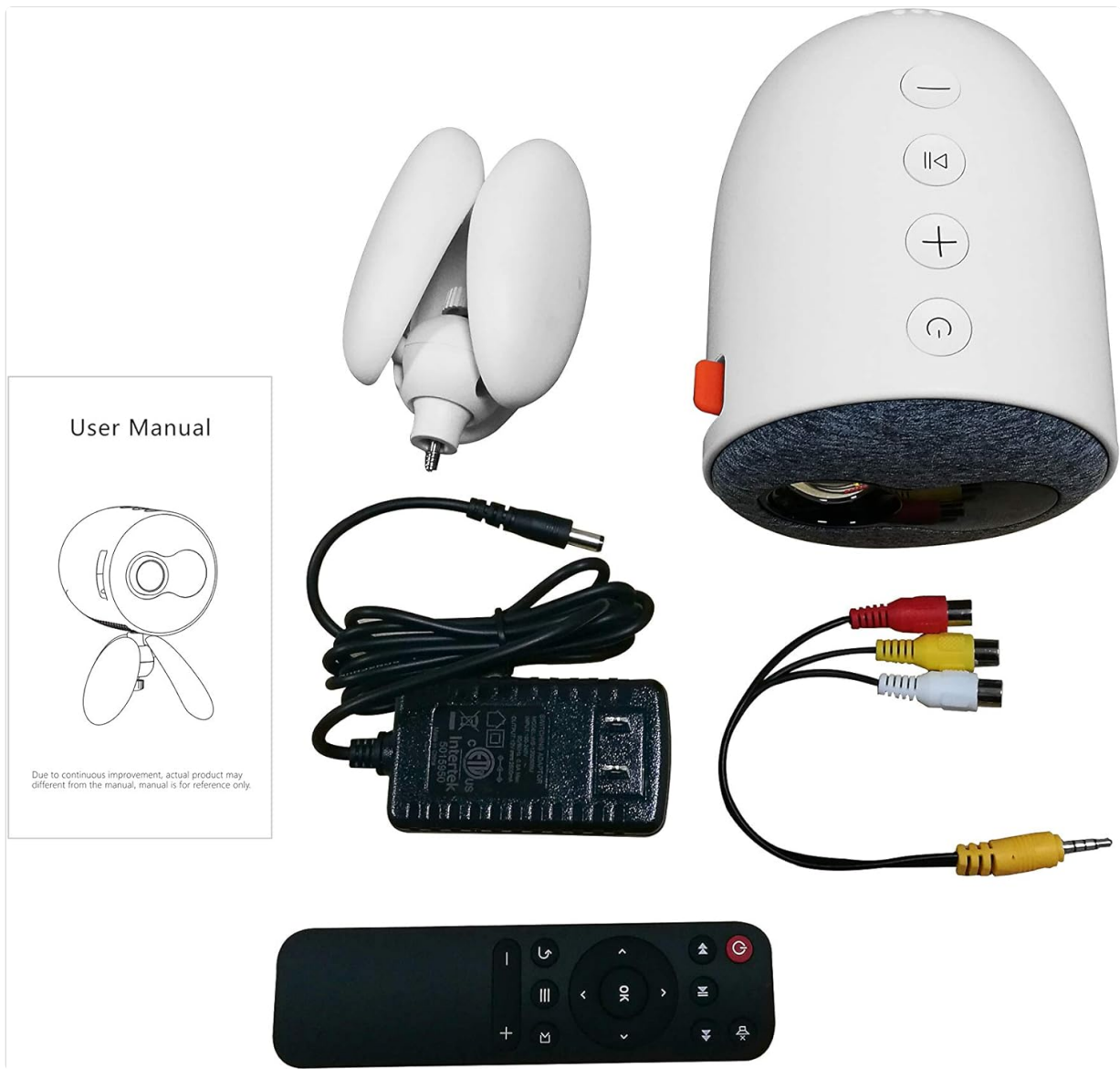
Image: All components included in the Bitmore FLIX Projector package.