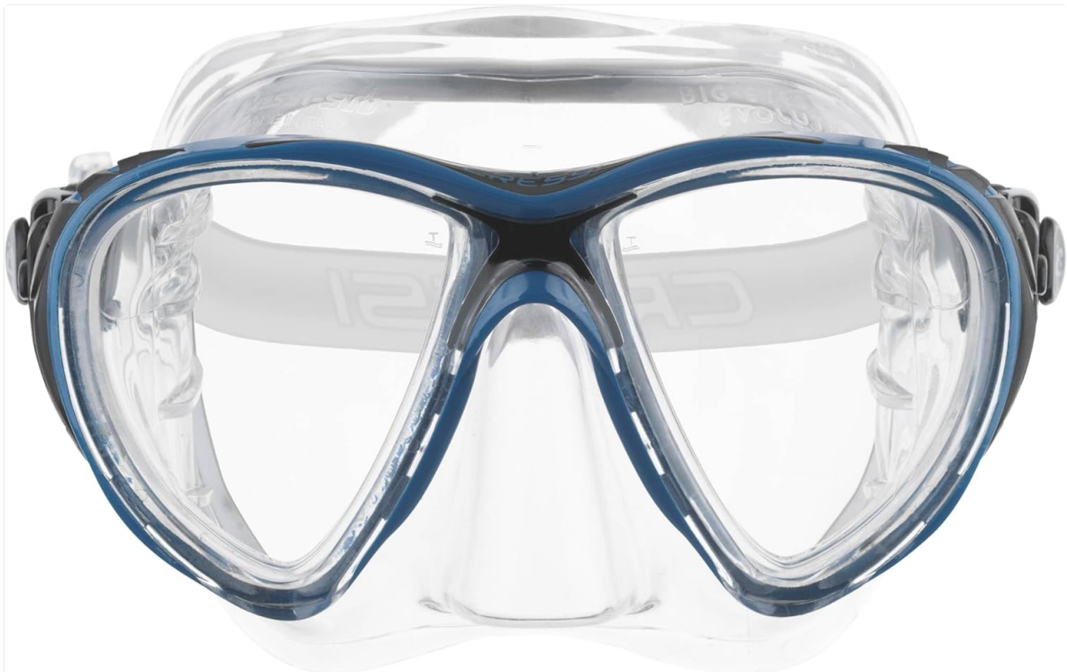
Figure 1: Front view of the Cressi Big Eyes Evolution Crystal Scuba Diving Mask. This image shows the clear silicone skirt and the dual lenses.

The Cressi Big Eyes Evolution Crystal mask is an advanced diving and snorkeling mask designed for enhanced vision and comfort. It features exclusive Crystal Silicone technology, which improves transparency and resists discoloration over time, ensuring a clear view for years. The mask's design, including tilted lenses, significantly widens the field of view, making it suitable for various underwater activities.