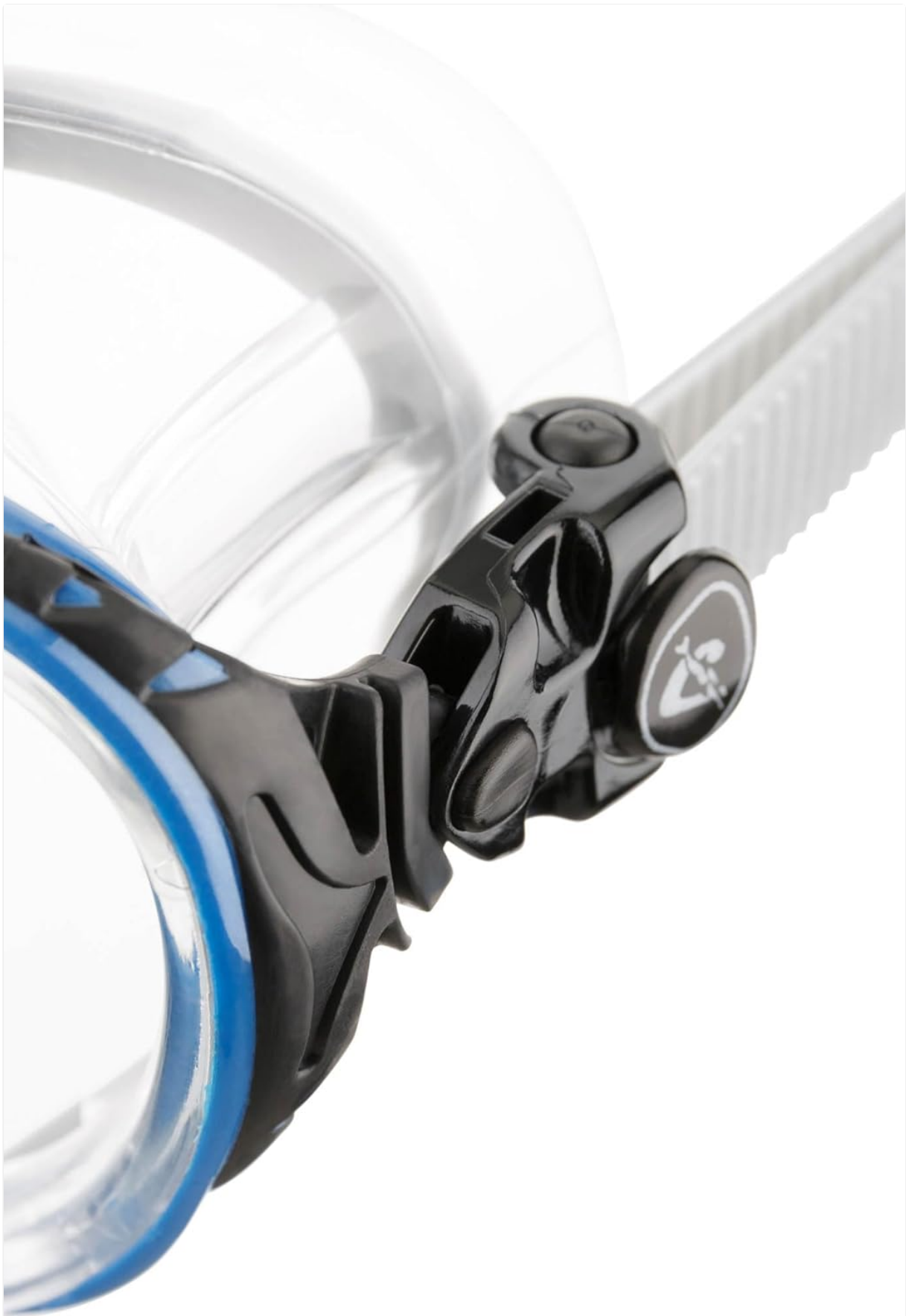
Figure 3: Detail of the integrated buckle system for strap adjustment. The flexible buckles allow for precise fitting.