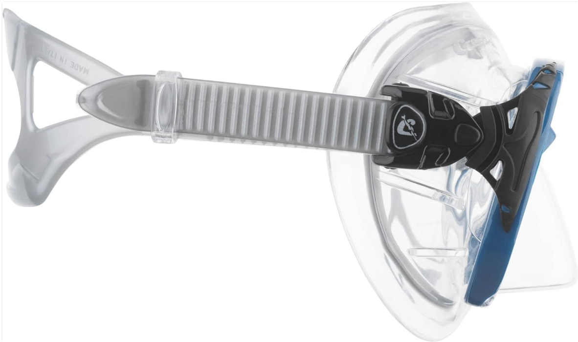
Figure 2: Side view of the Cressi Big Eyes Evolution Crystal Scuba Diving Mask, highlighting the strap and buckle attachment.