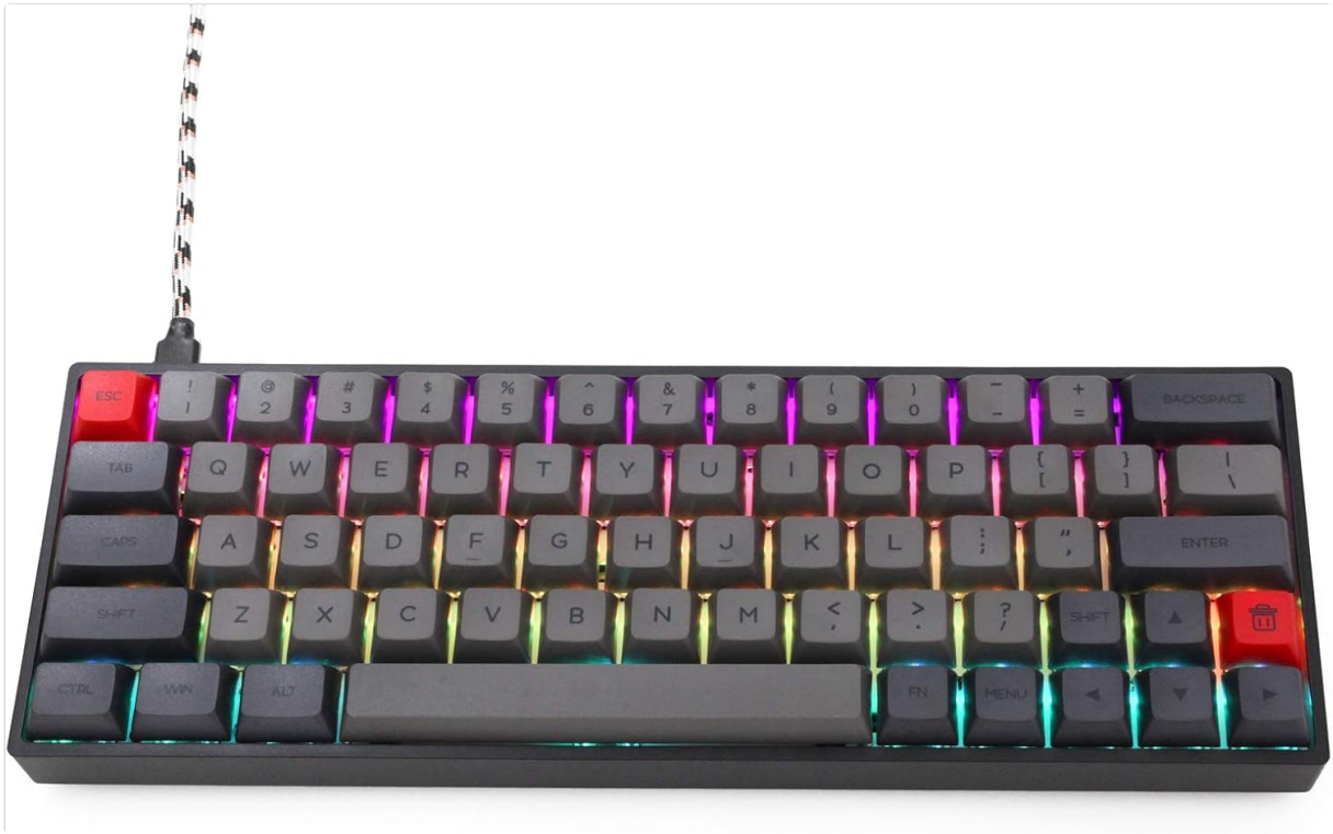
Image: The KPREPUBLIC SK64 keyboard with its USB-C cable connected, ready for use.