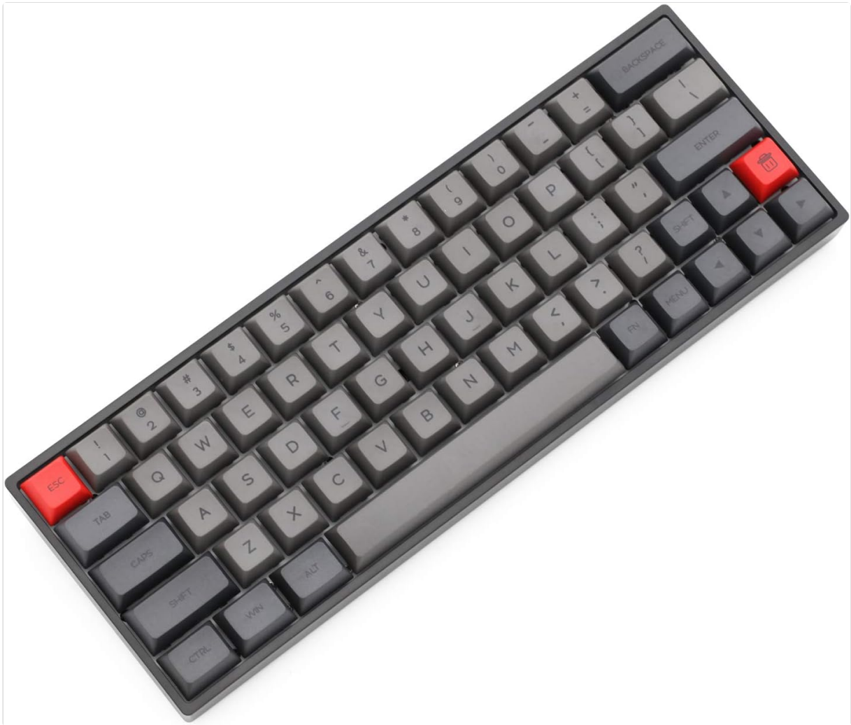
Image: Top view of the KPREPUBLIC SK64 keyboard, illustrating the compact 60% key layout.