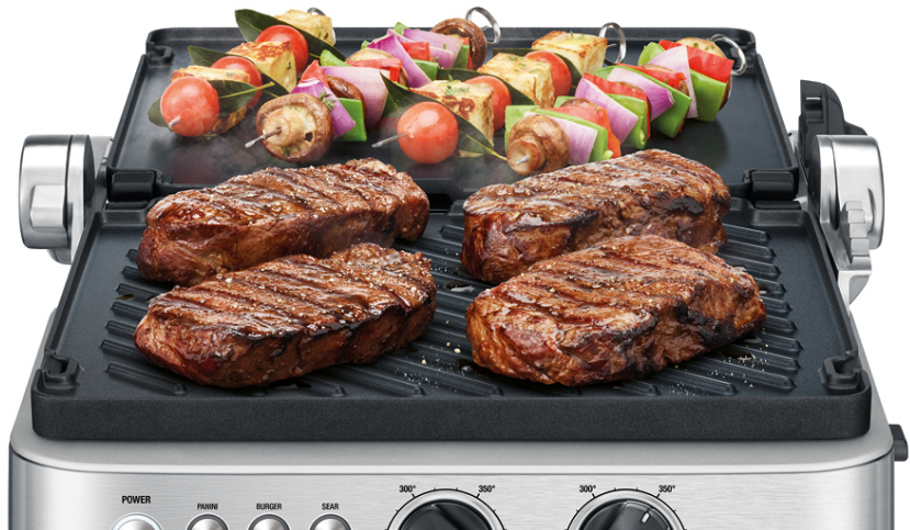
Image: A detailed view of the control panel, showing the power button, preset buttons for Panini, Burger, and Sear, and the independent temperature dials for the upper and lower plates.