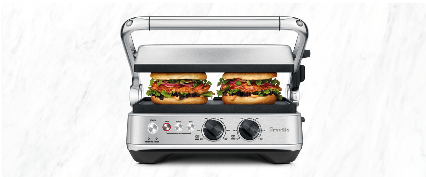
Image: The Breville Sear and Press Grill in action, preparing two panini sandwiches, showcasing its primary function.

The Breville BGR700BSS Sear and Press Grill is a versatile kitchen appliance designed for precise grilling of various foods. It features pre-programmed, one-touch presets for Panini, Burger, and Sear functions, offering convenient shortcuts for cooking. This electric grill can also open flat into a BBQ mode, providing a large grilling and griddle surface. Its independent plate temperature control allows for customized cooking environments, and the reversible ceramic grill and griddle plates are non-stick and PFOA/PTFE free for healthier cooking and easy cleanup. This manual provides essential information for setting up, operating, maintaining, and troubleshooting your appliance.