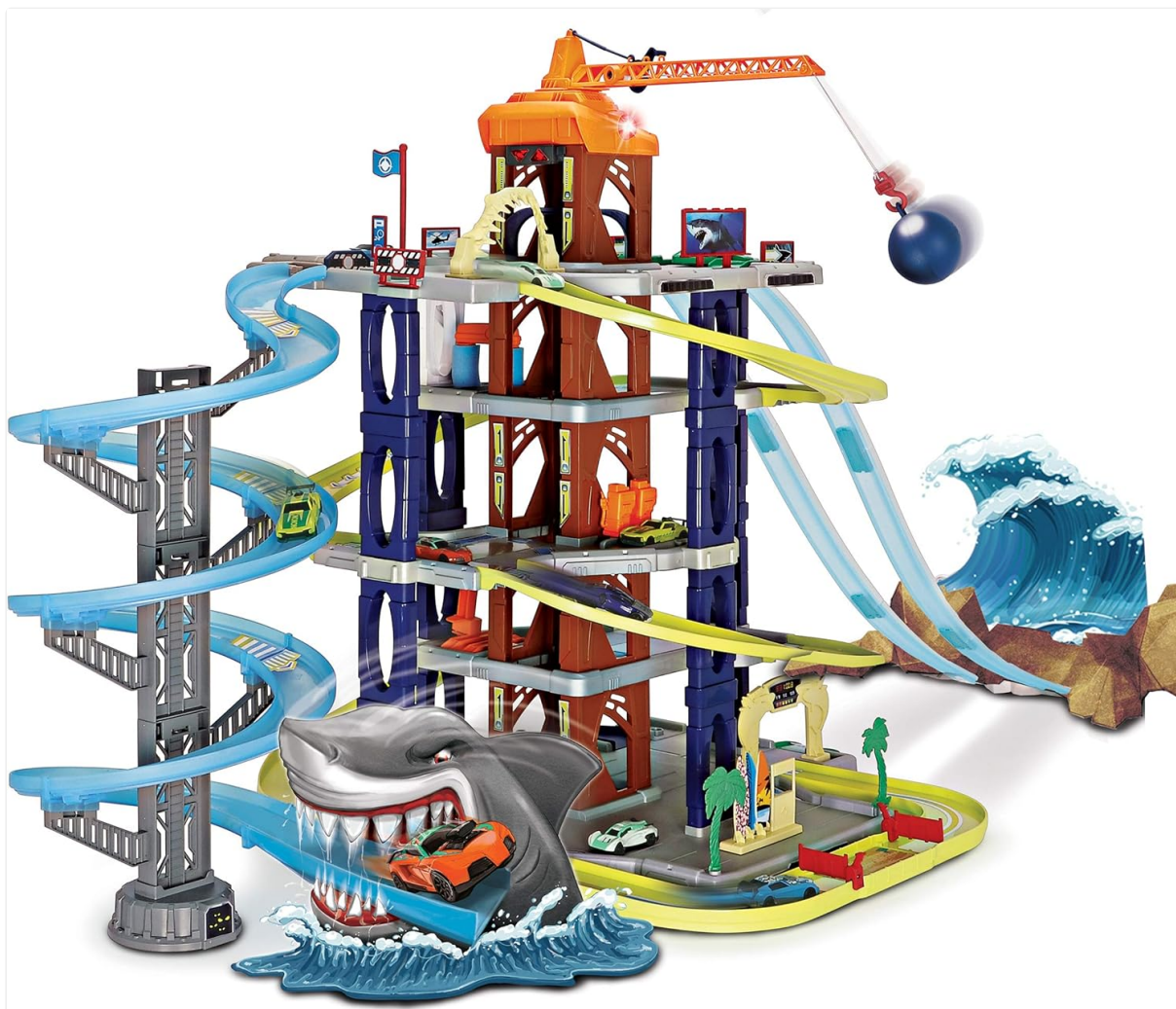
A complete view of the assembled Ultimate Shark Garage, showcasing its multi-level structure, spiral ramps, working crane, and the prominent shark feature at the base.

of the elevator shaft). Insert the required batteries (not included) according to the polarity indicators.