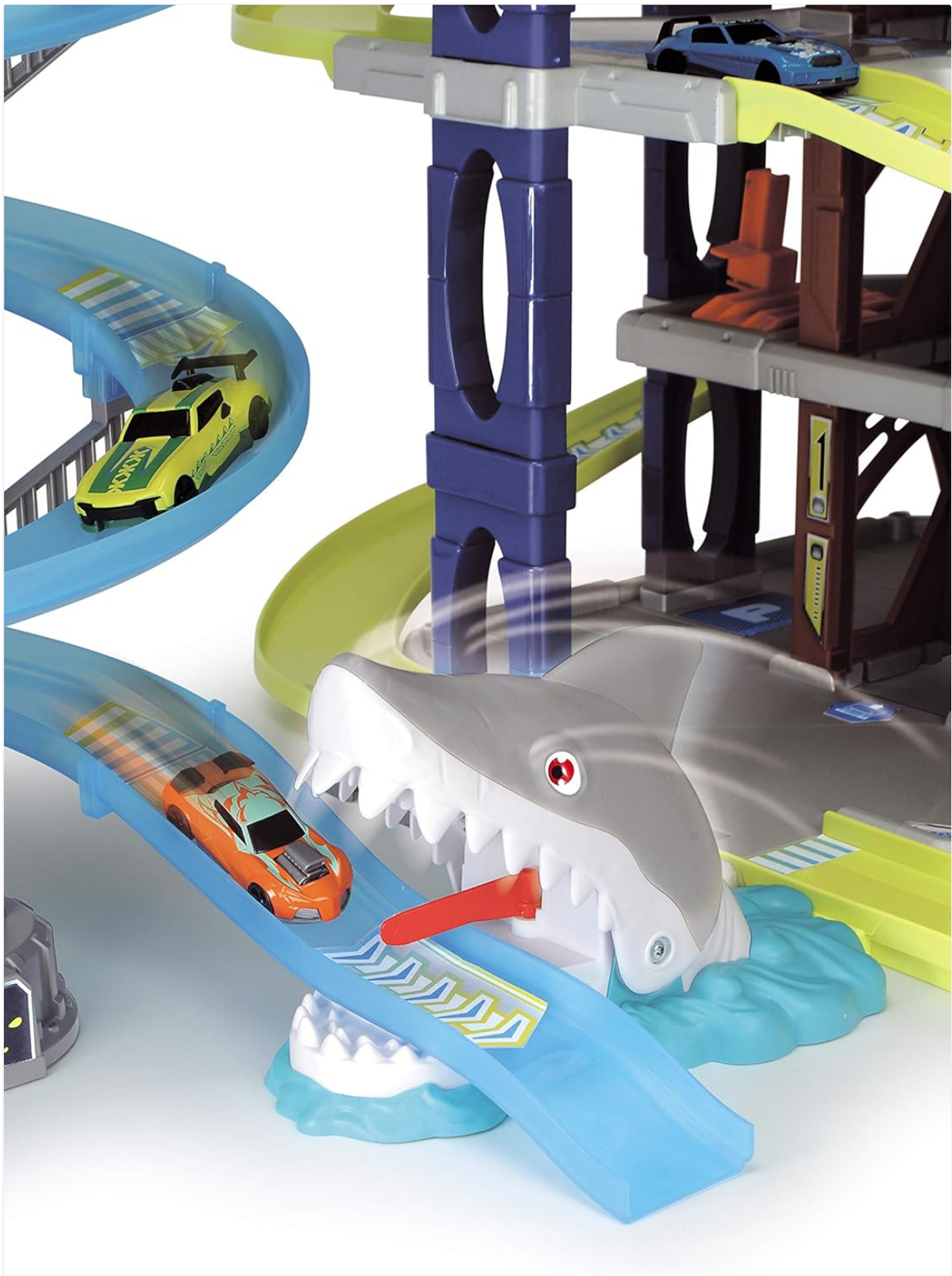
A detailed view of the interactive shark feature, showing a vehicle about to encounter the chomping shark as it navigates the track.