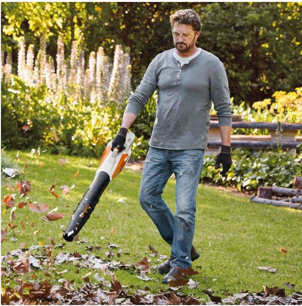
Figure 5.1: Operating the blower. A person is shown using the Stihl BGA 57 leaf blower to clear leaves from a grassy area, demonstrating proper handheld operation.