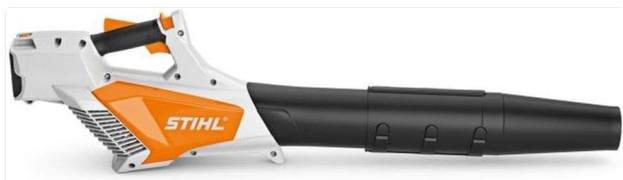
Figure 3.1: Stihl BGA 57 Leaf Blower. This image shows the main unit of the leaf blower, featuring its white and orange casing with the black blower tube attached.