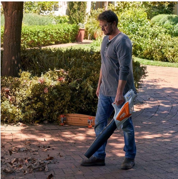
Figure 5.2: Clearing debris from a paved area. This image shows a person using the Stihl BGA 57 leaf blower to clear leaves from a paved driveway or patio.