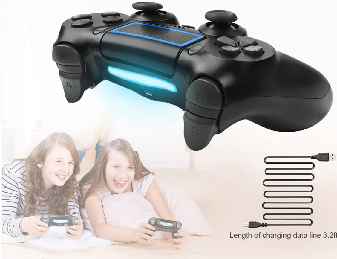
Image 5.1: Illustration depicting the controller being charged via a USB cable, alongside information on typical working time (13-15 hours) and charging time (2.5-3 hours).