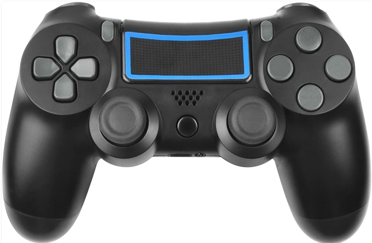
Image 1.1: Front view of the Bonadget PS4 Wireless Gamepad. This image displays the controller's layout, including the D-pad, action buttons, analog sticks, touch pad, and central PS button.

This manual provides detailed instructions for the setup, operation, maintenance, and troubleshooting of your Bonadget PS4 Wireless Gamepad. Please read this manual thoroughly before using the product to ensure proper function and longevity.