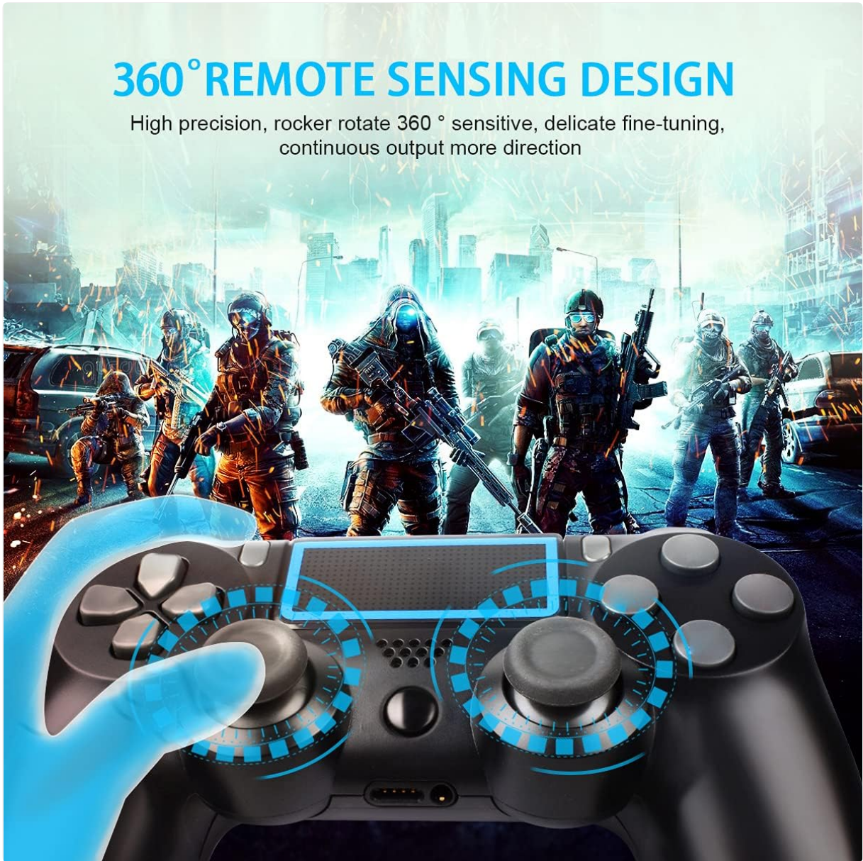
Image 2.2: Illustration demonstrating the 360-degree remote sensing design of the analog sticks. This feature ensures high precision and sensitive control for accurate in-game movements.

High precision, rocker rotate 360 ° sensitive, delicate fine-tuning, continuous output more direction