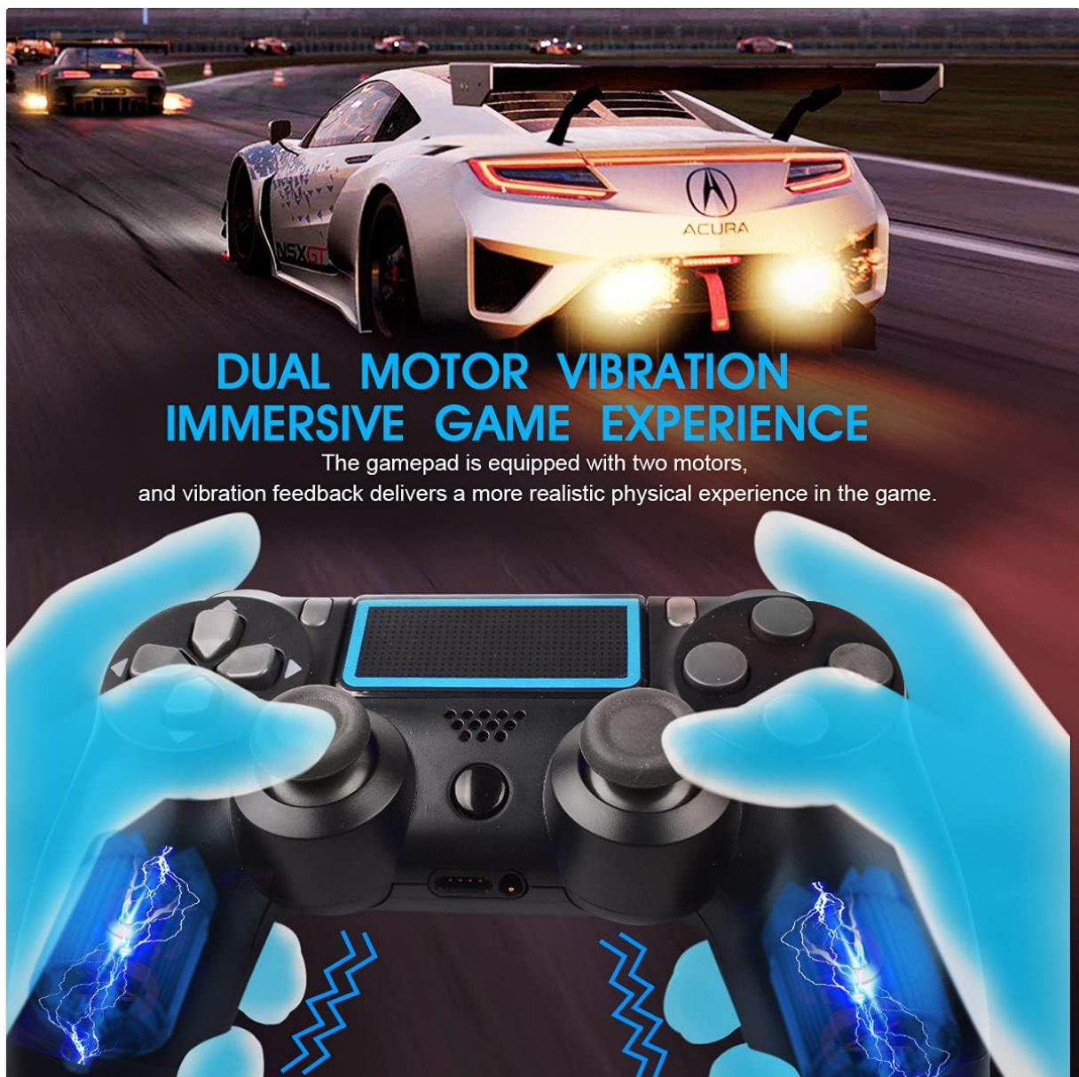
Image 2.1: Illustration highlighting the dual motor vibration feature of the gamepad. This image visually represents the haptic feedback system that provides immersive game experiences.