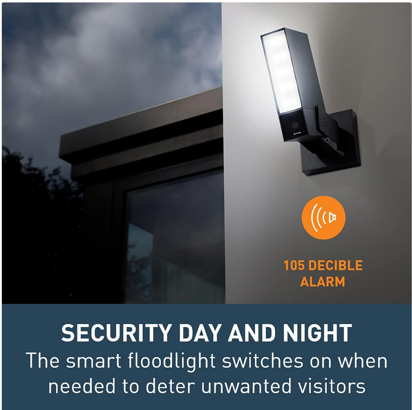
Image: A split image showing the Netatmo Smart Outdoor Camera during the day and at night. The night view shows the integrated floodlight illuminated, emphasizing its role in providing security day and night and deterring unwanted visitors.