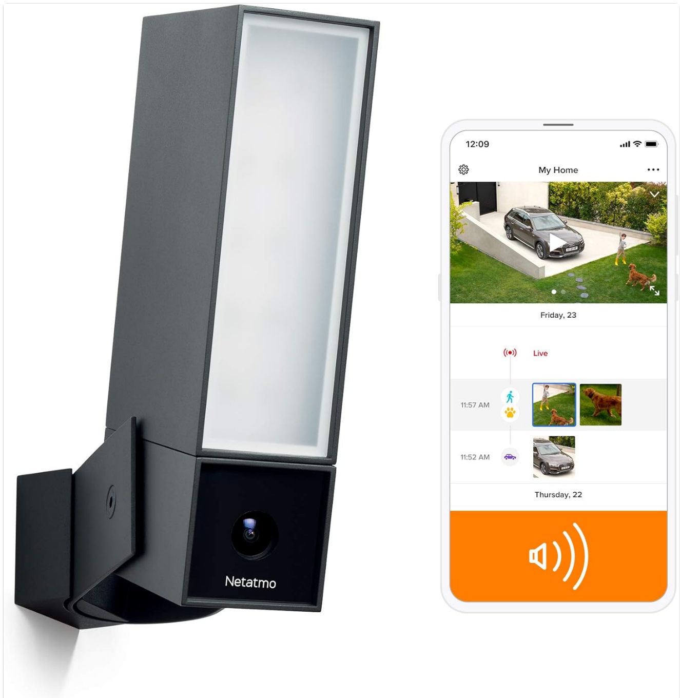
Image: The Netatmo Smart Outdoor Camera positioned next to a smartphone showing the Netatmo app interface. The app displays a live view of a driveway with a car and dogs, along with a timeline of detected events.