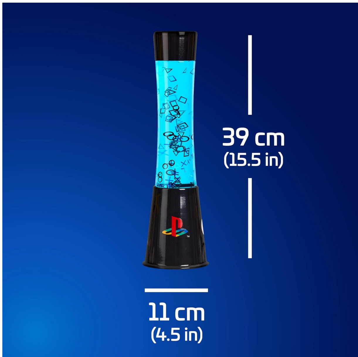
Image: Dimensions of the Paladone PlayStation Lava Lamp.