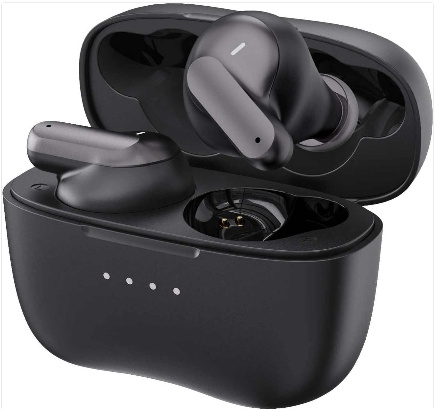
Image: The Otium M01 earbuds resting in their charging case, displaying four illuminated LED battery indicators on the front.