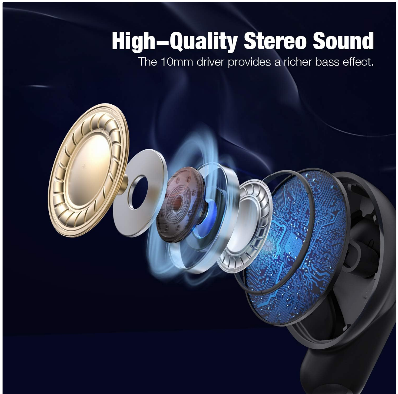
Image: A cutaway diagram illustrating the internal components of the Otium M01 earbud, highlighting the 10mm driver responsible for high-quality stereo sound and deep bass.

deep bass. This design ensures a rich and immersive audio experience across various music genres and media content.