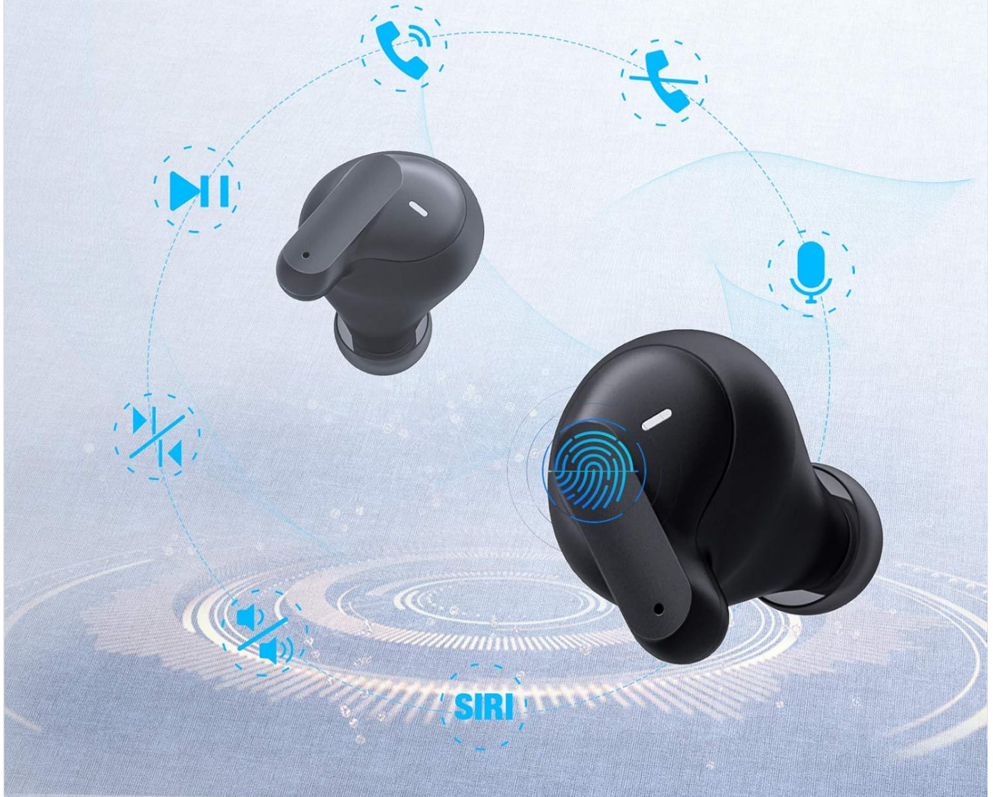
Image: An illustration detailing the various touch control functions of the Otium M01 earbuds, including call management, music playback, and voice assistant activation.

Simplifies all operations into elegant and efficient touch control