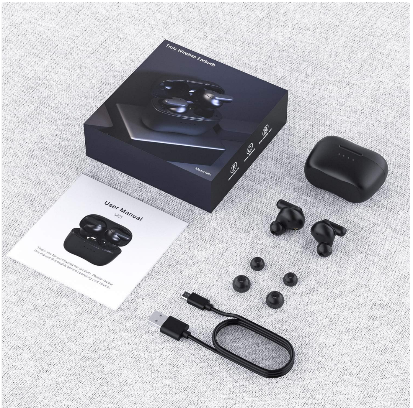
Image: The package contents of the Infun Otium M01 Wireless Earbuds, including the earbuds, charging case, USB-C cable, extra ear tips, and user manual.