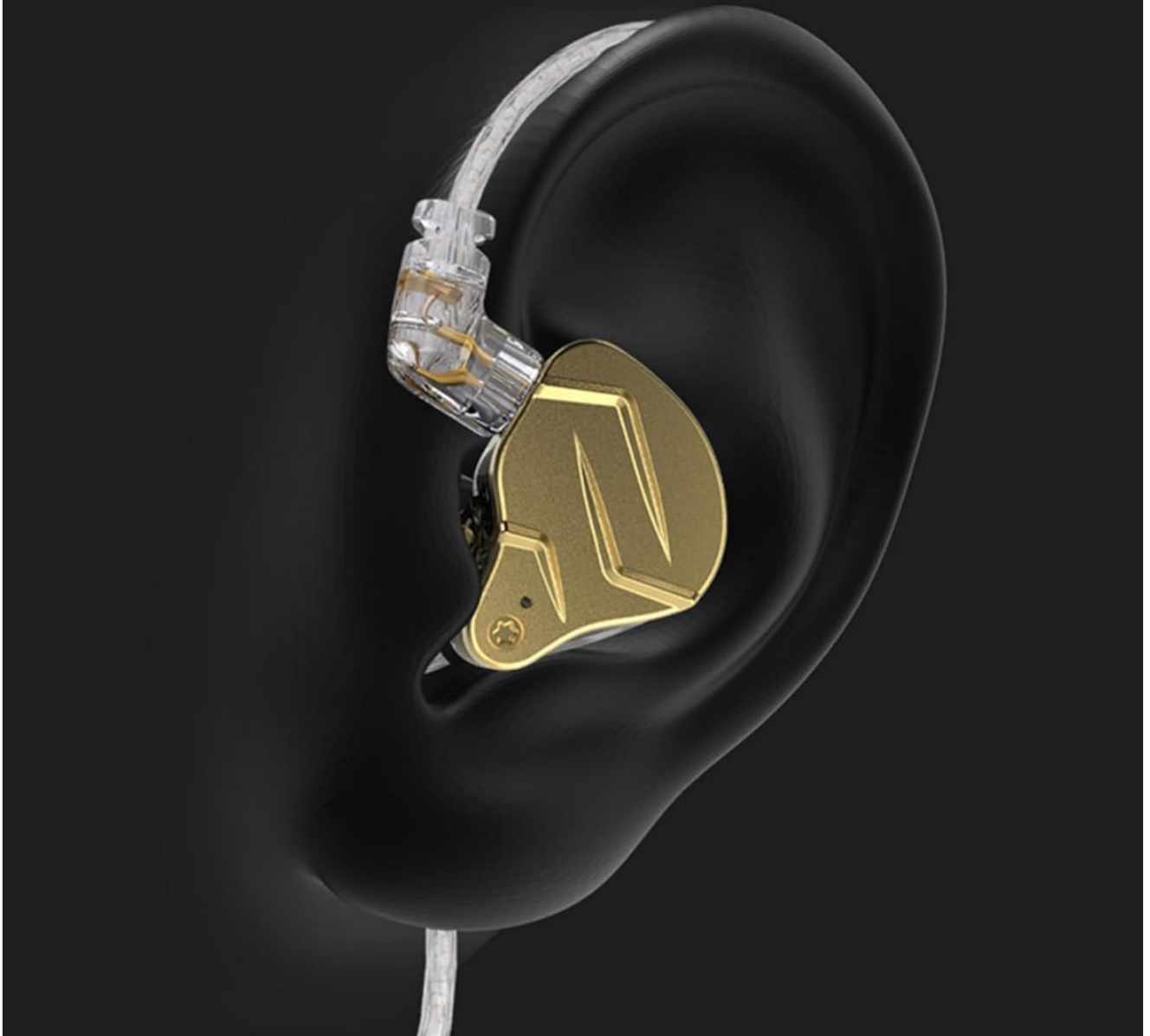
Image 3.4: Visual representation of the ergonomic design and comfortable wearing experience, showing how the curved cavity fits the auricle.

The curved cavity follows the ergonomic design concept and fits the auricle tightly and comfortably. With the elastic memory Pu tube around the ear, it can be worn firmly and freely.