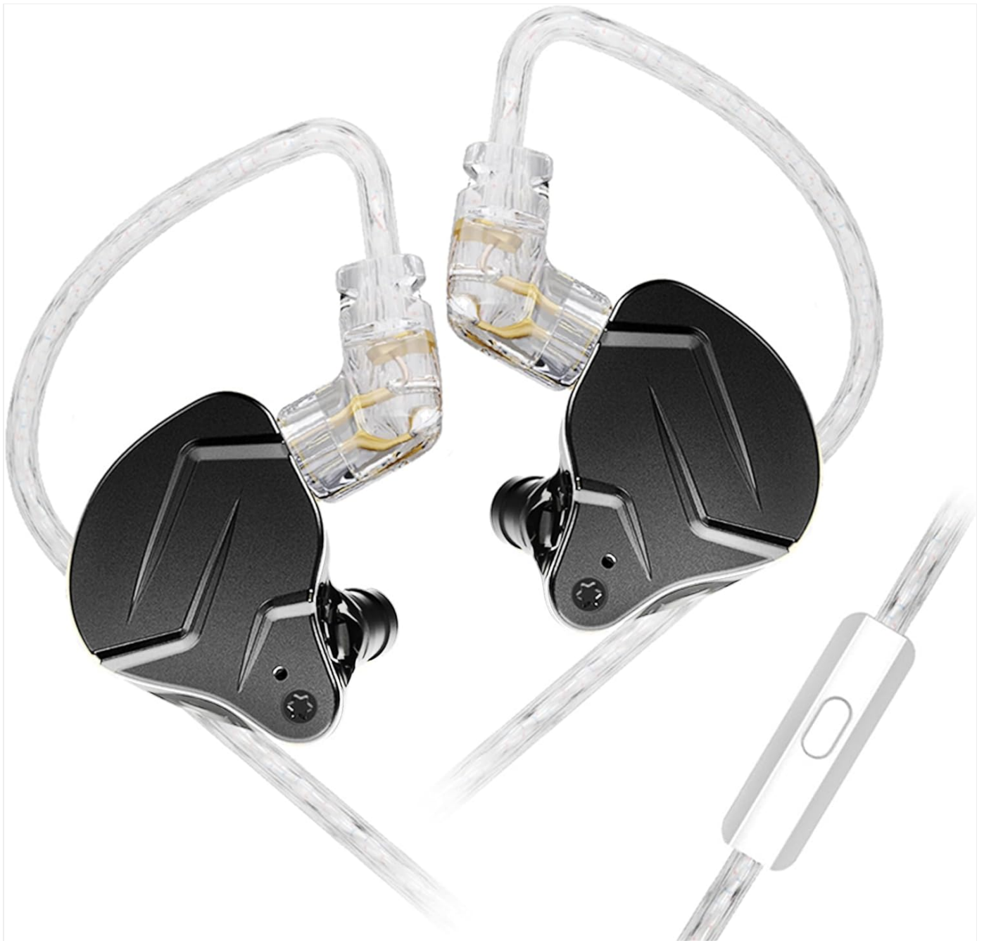
Image 1.1: Front view of the KZ ZSN PRO X Gaming Earbuds with their clear, detachable cable.