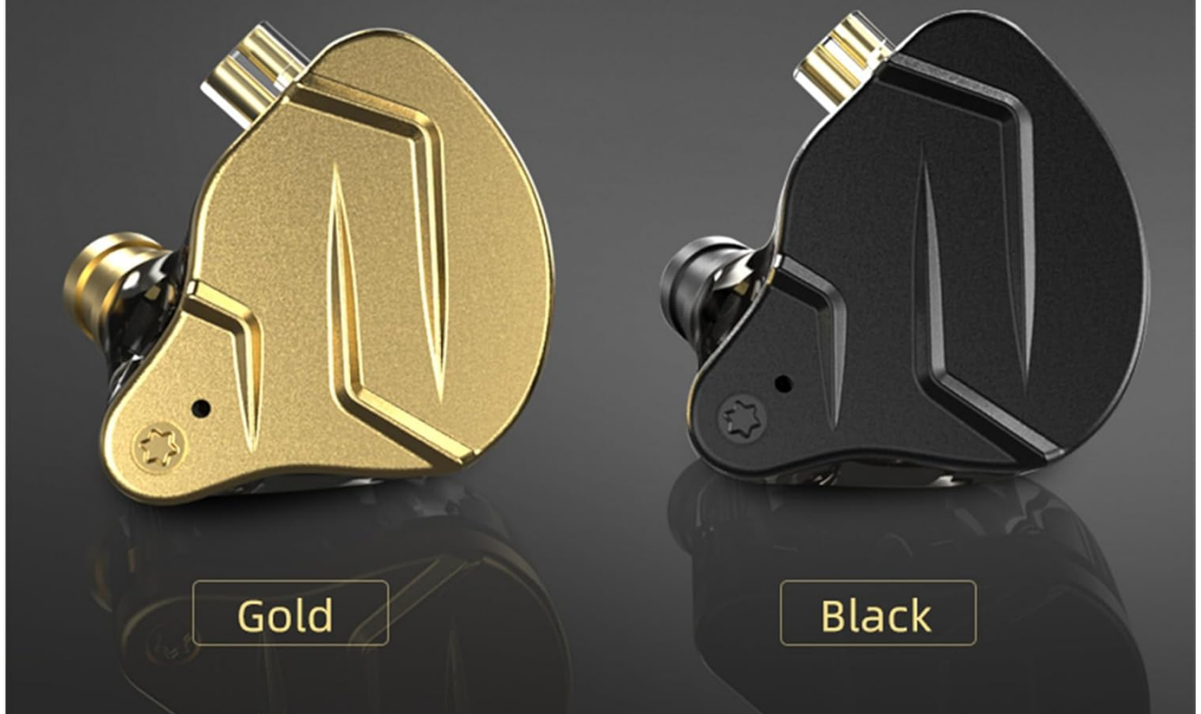
Image 3.1: Close-up of the earbuds showcasing the zinc alloy and resin housing in gold and black finishes.

Brand new bright color, shining zinc alloy, The texture is much better than headphones of the same price