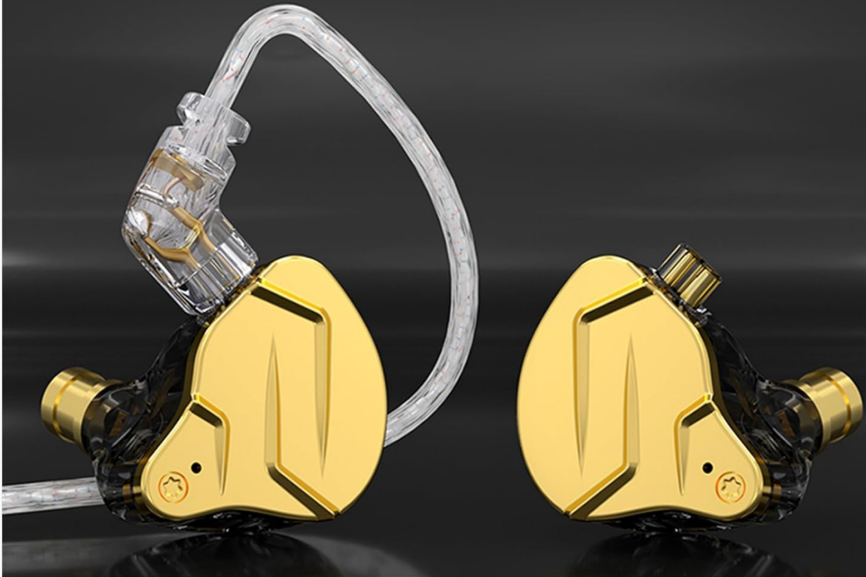
Image 3.2: Illustration highlighting the improved sound field and sense of hearing with the KZ ZSN PRO X.

Classic hybrid technology drive metal earphones Revolutionize again