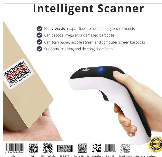
Image: A hand demonstrates scanning a barcode on a package, illustrating the scanner's capability to read various 1D and 2D barcode formats.