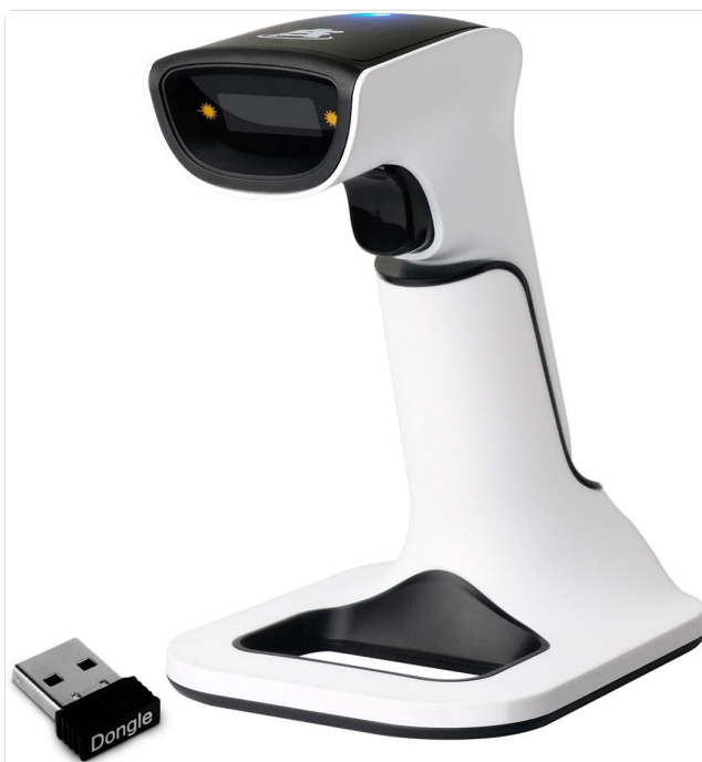
Image: The ScanAvenger barcode scanner resting on its charging stand, with the USB dongle visible. This setup highlights its wireless capabilities and compact design.

Key features include a rechargeable battery, vibration capabilities for noisy environments, and a Next Gen Smart Charging Stand. This scanner is compatible with a wide range of operating systems and Point-of-Sale (POS) systems, supporting the scanning of both 1D and 2D barcodes.