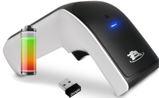
Image: A visual representation of the scanner's industrial-grade shock-resistant design, capable of withstanding drops.

For long-term use, charge your scanner with a 5V/1A charger. Avoid fast chargers (like 5V/2A or 9V) to prevent potential battery damage.