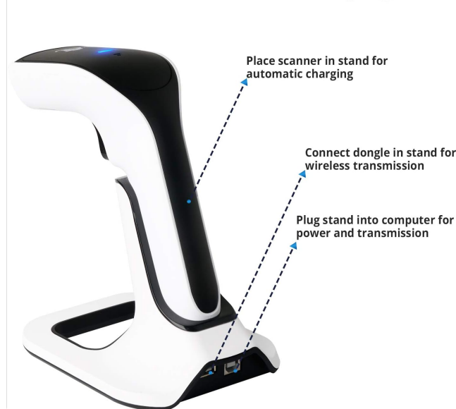
Image: A diagram illustrating how to place the scanner on the stand for charging, connect the dongle for wireless transmission, and plug the stand into a computer for power and data transfer.