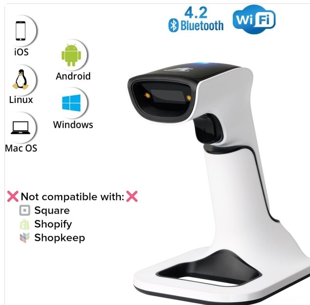
Image: The scanner and its stand, illustrating compatibility with various operating systems including iOS, Android, Linux, Windows, and Mac OS. It also explicitly states non-compatibility with Square, Shopify, and Shopkeep POS systems.