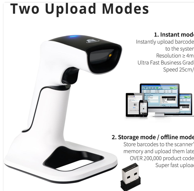
Image: The scanner on its stand, illustrating the two data upload modes: Instant mode for immediate transfer and Storage mode for offline scanning and later upload.