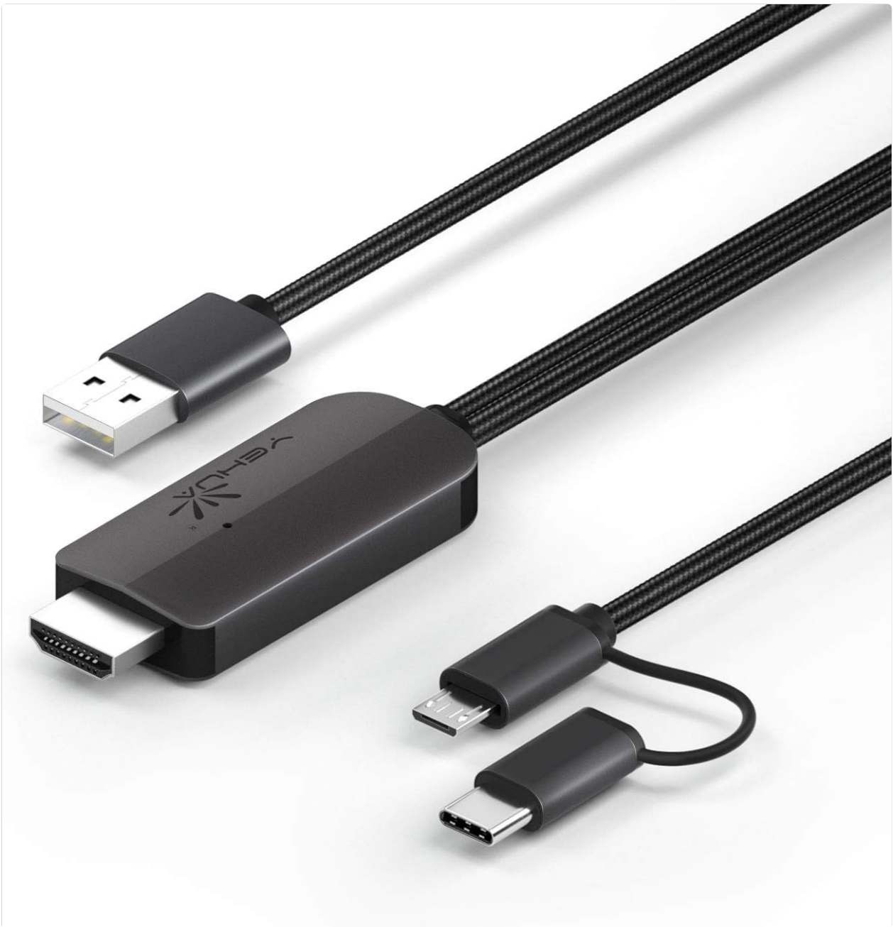
Figure 1: YEHUA HDMI Adapter Cable showing its various connectors: USB-A for power, HDMI for display output, and a combined Micro USB/USB-C for device input.