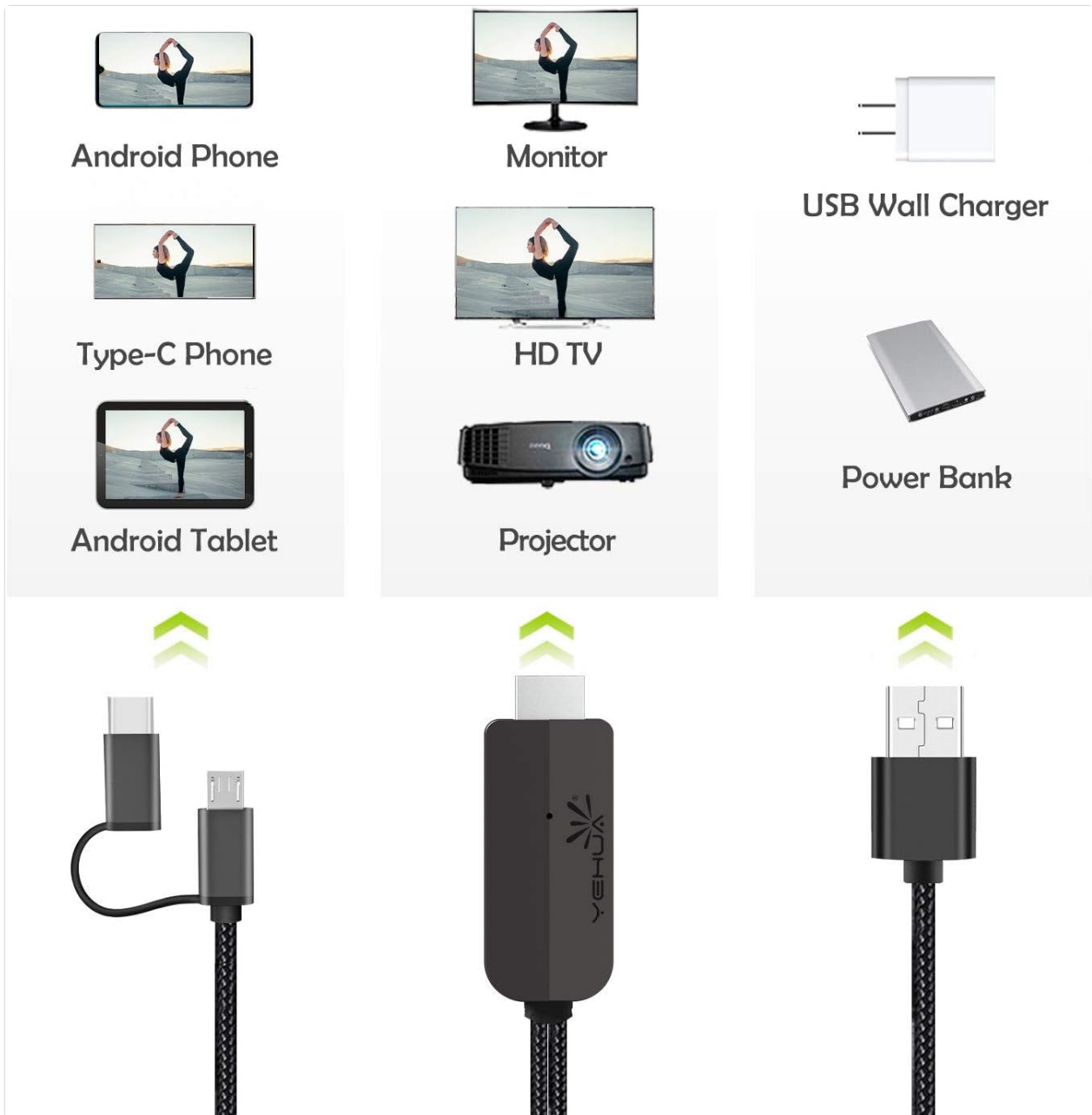
Figure 4: An overview of compatible devices and connection types for the YEHUA HDMI adapter, illustrating how phones, tablets, monitors, TVs, and projectors connect, along with power options like USB wall chargers and power banks.

TV/projector. If Bluetooth is not connected, audio may play through your phone or other paired Bluetooth devices.