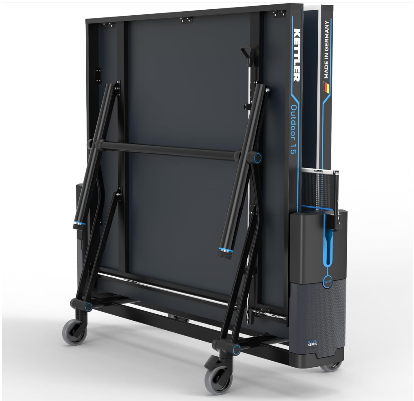
Image: The KETTLER Outdoor 15 Table Tennis Table in its compact, folded storage position.