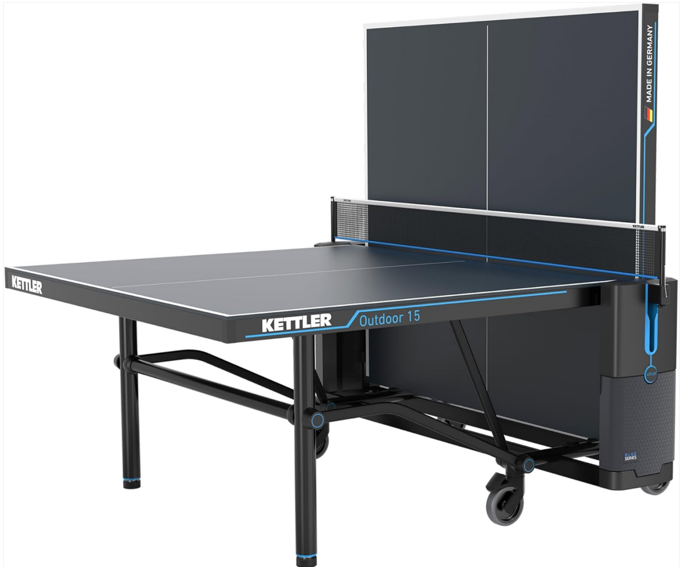
Image: The KETTLER Outdoor 15 Table Tennis Table fully unfolded and ready for play.

Carefully unfold the table halves. The CENTERFOLD safety design and SMOOTH-TRAX patented track system facilitate controlled opening and closing. Ensure the table is on a level surface before fully extending the legs.