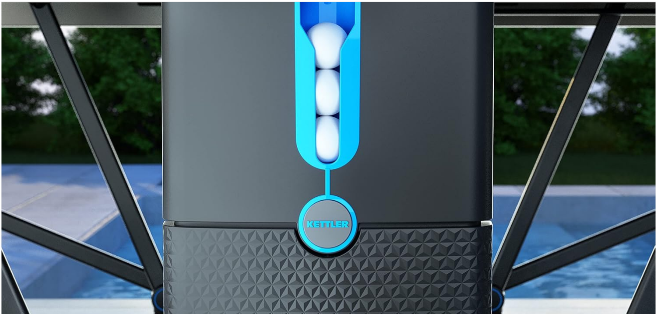
Image: Close-up view of the integrated ball storage compartment on the KETTLER Outdoor 15 table.