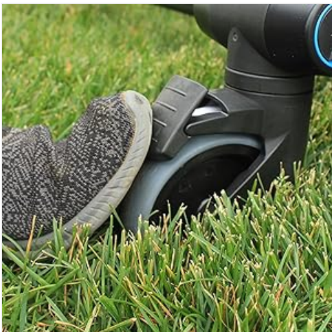
Image: A foot pressing down on the lever to engage the wheel lock, securing the table in place.

The table is equipped with 5.5-inch locking dual wheels for easy transport. Unlock the wheels before moving and lock them once the table is in its desired position to prevent accidental movement.