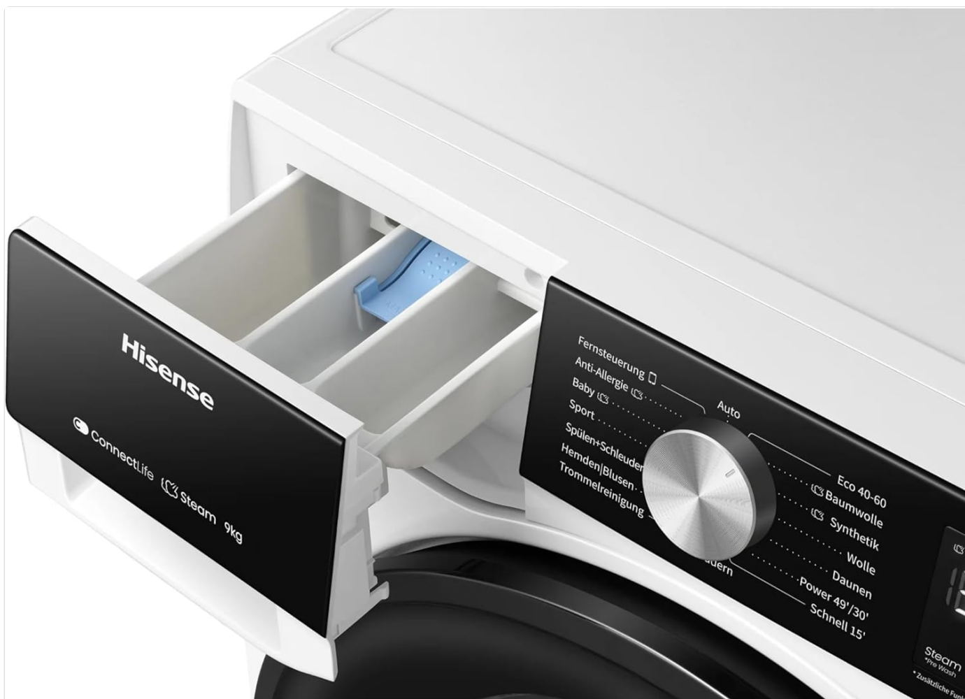
Image: The detergent dispenser drawer pulled out, showing the compartments for detergent and fabric softener.