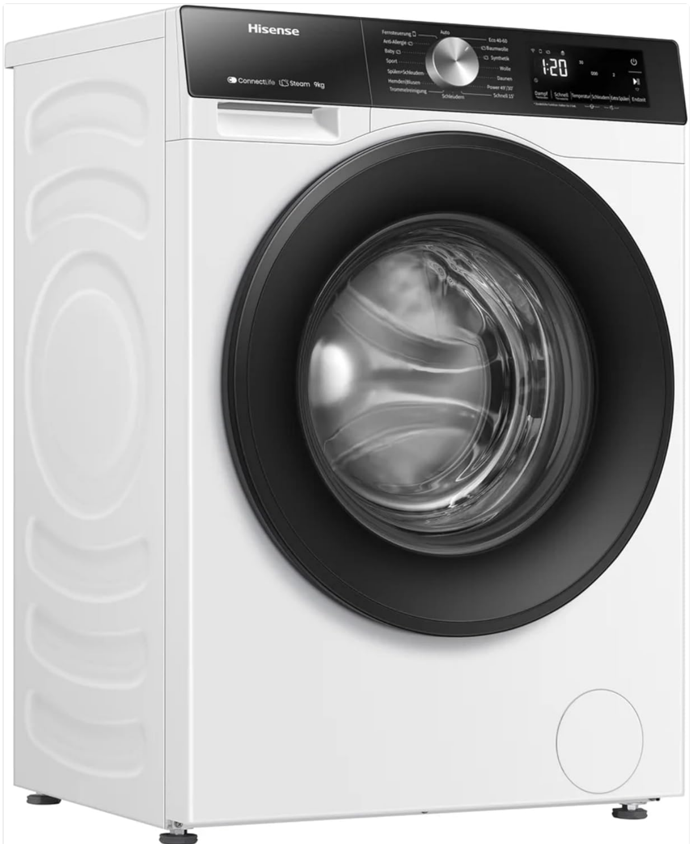
Image: Overall view of the Hisense WF3S9043BW3 washing machine, showing its design and connections.