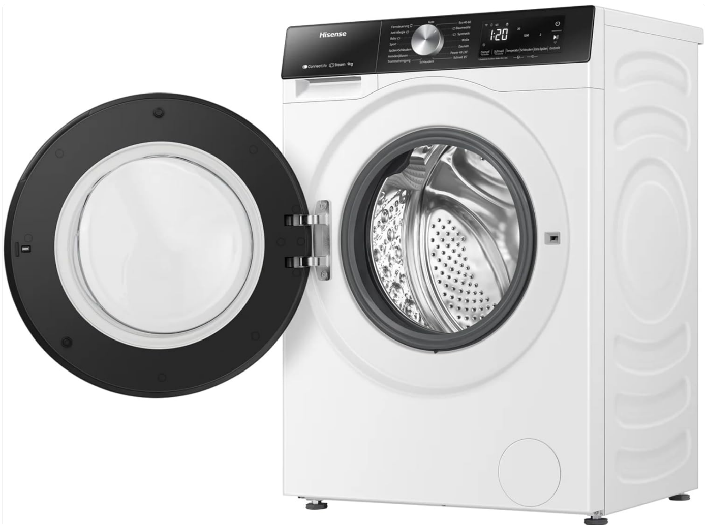
Image: The washing machine with its door open, illustrating the drum where transport bolts are typically located at the rear.