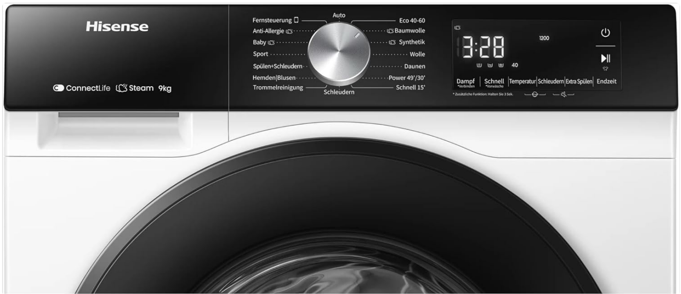
Image: Detailed view of the washing machine's control panel, highlighting the program selection dial and digital display.

The control panel features a program selector dial, function buttons, and a digital display. Use the dial to select your desired wash program, and the buttons to adjust settings such as temperature, spin speed, and delay start.