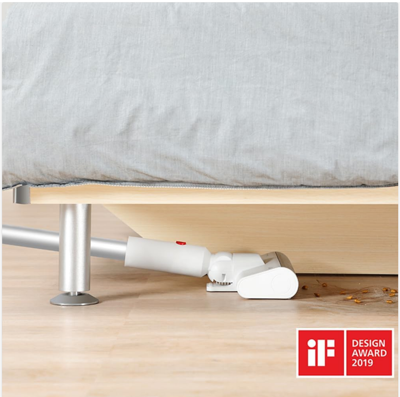
Figure 4.1: The Deerma VC20 PLUS in its full stick configuration, highlighting its sleek design and the Deerma brand logo.