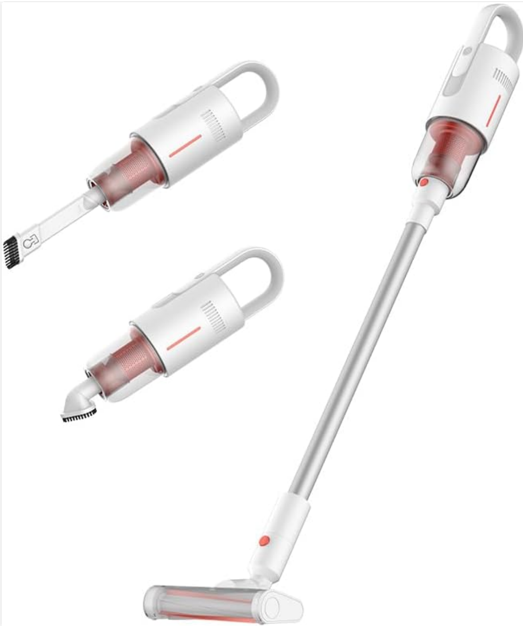
Figure 3.1: Overview of the Deerma VC20 PLUS vacuum cleaner and its included accessories, showing the main unit, extension tube, floor brush, and two smaller attachments.