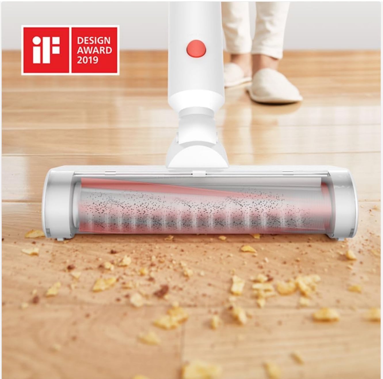
Figure 6.2: A detailed view of the floor brush in action, effectively picking up debris from a hard floor surface.