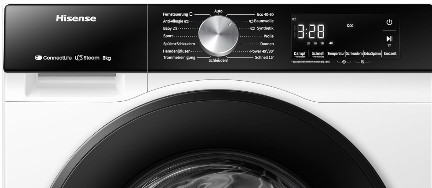
Figure 2: Close-up of the Hisense WF3S8043BW3 washing machine's control panel, showing the program dial and digital display.

The control panel features a program selector dial, a digital display, and various function buttons. Refer to the image below for a detailed view.