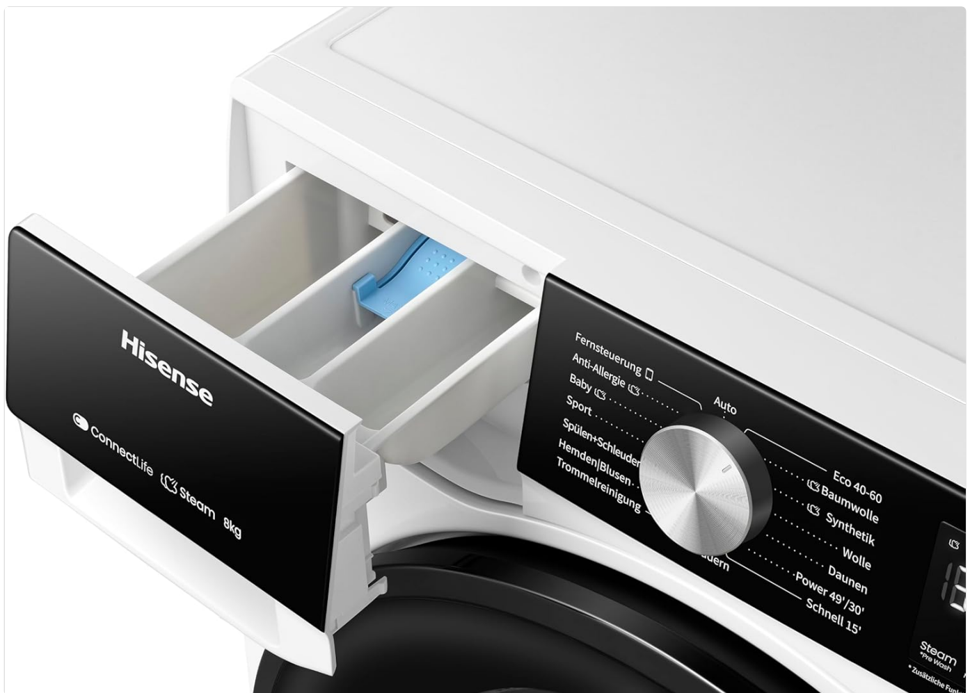
Figure 4: The detergent dispenser drawer of the Hisense WF3S8043BW3 washing machine, showing compartments for detergent and additives.