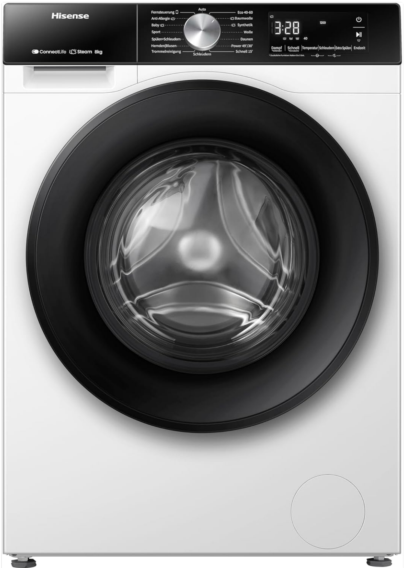
Figure 1: Front view of the Hisense WF3S8043BW3 washing machine, showing the main control panel and drum.