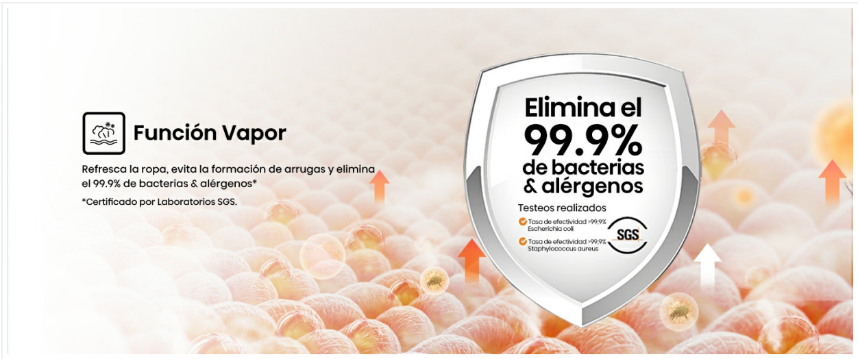
Steam Function illustration highlighting 99.9% bacteria and allergen elimination, certified by SGS.