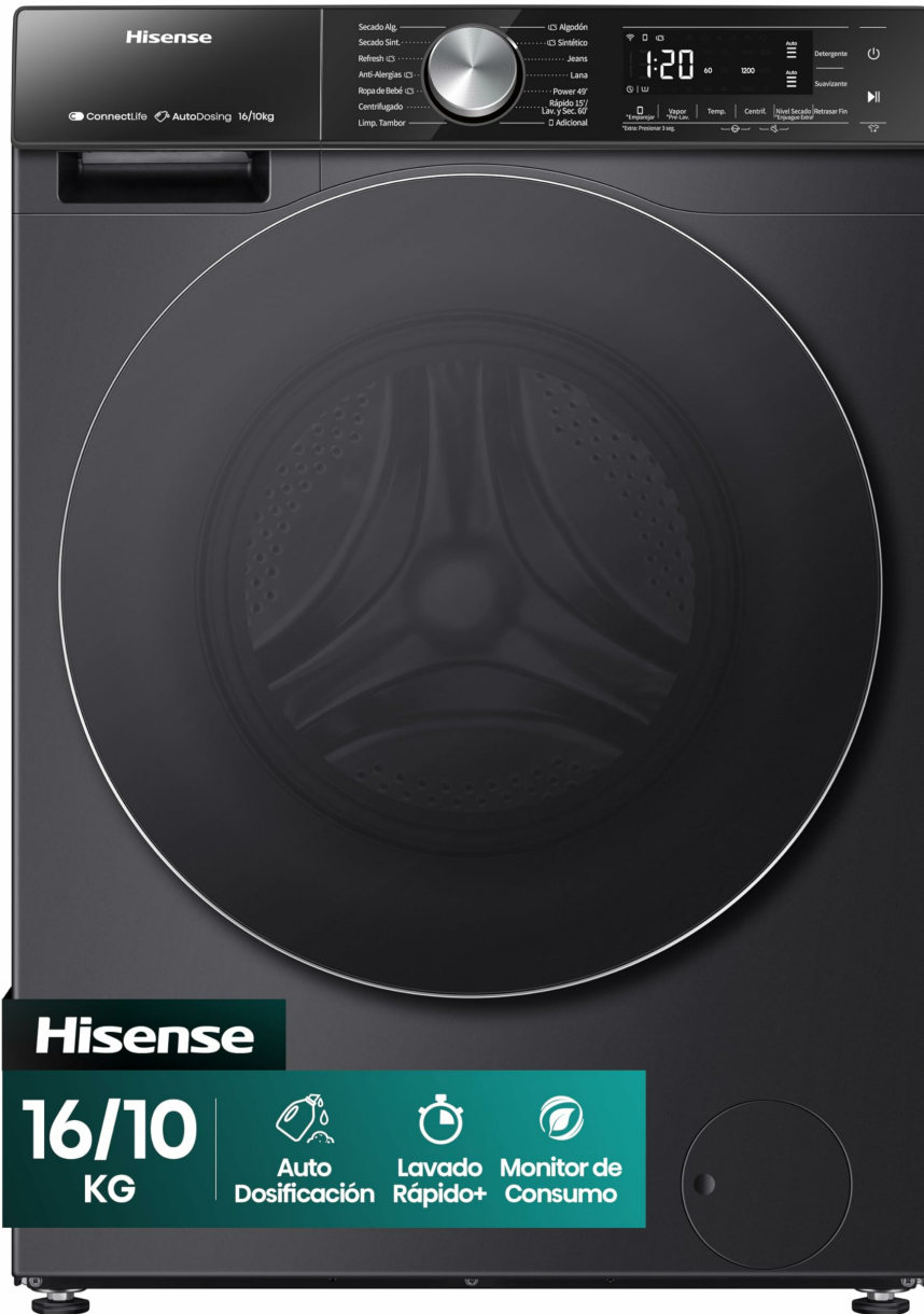
Front view of the Hisense WD5S1645BB Washer Dryer.