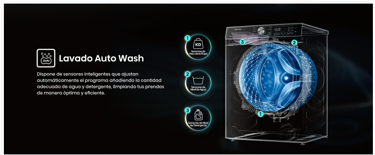
Auto Wash feature showing sensors for load weight, water level, and detergent level.