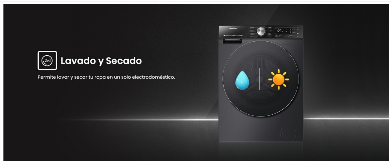
Wash and Dry feature illustration, symbolizing washing and drying in one unit.