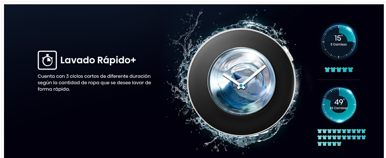
Quick Wash+ feature showing different cycle durations for varying load sizes.