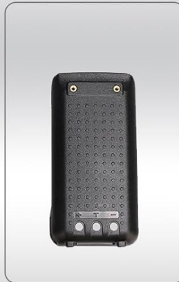
2 x Battery