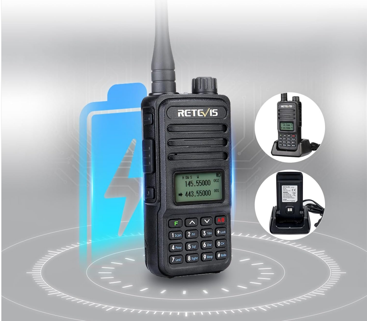
Figure 4.1: Battery and Charging Setup.