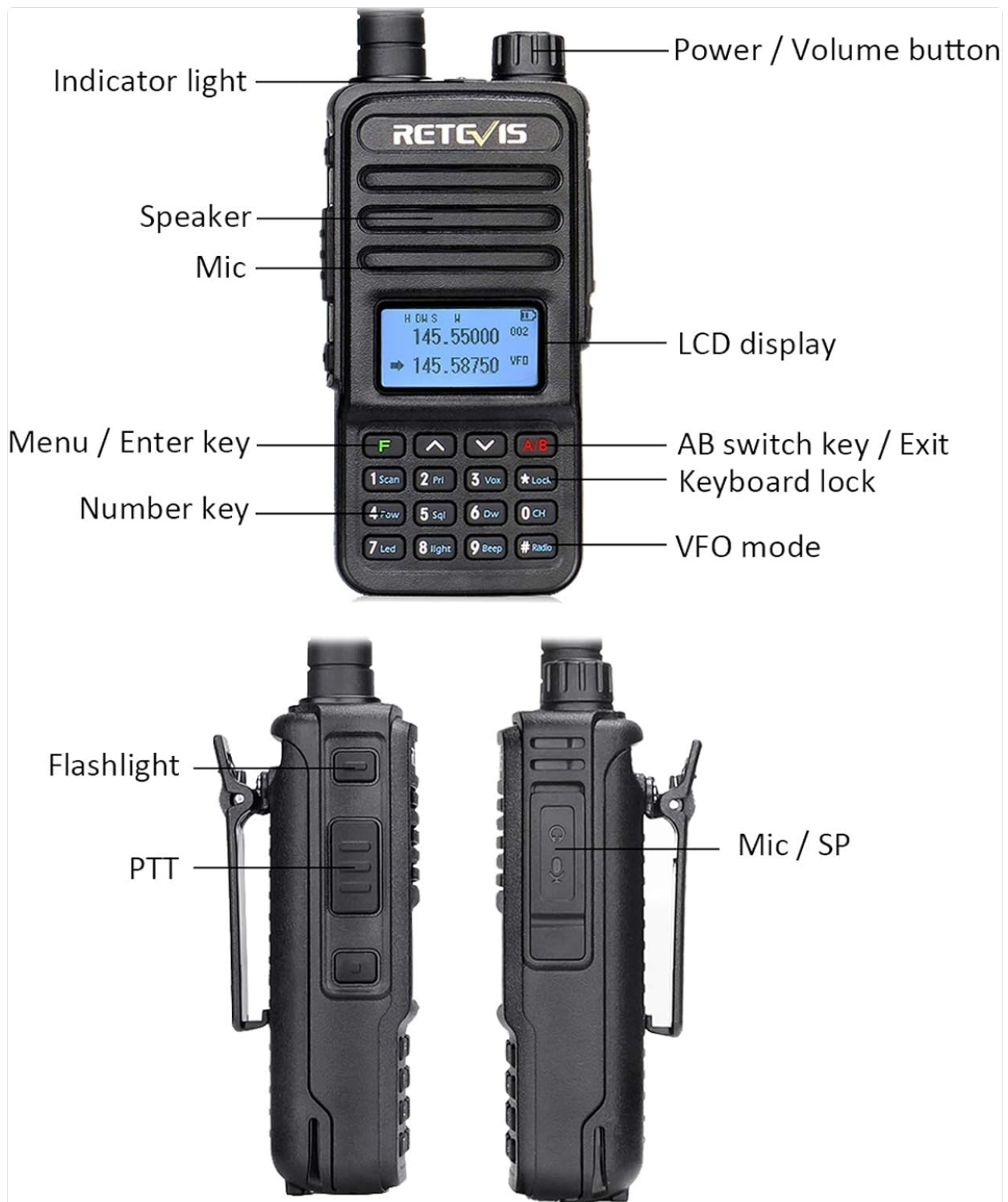
Figure 5.1: Retevis RT85 Product Parts Diagram.