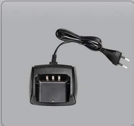
2 x charger