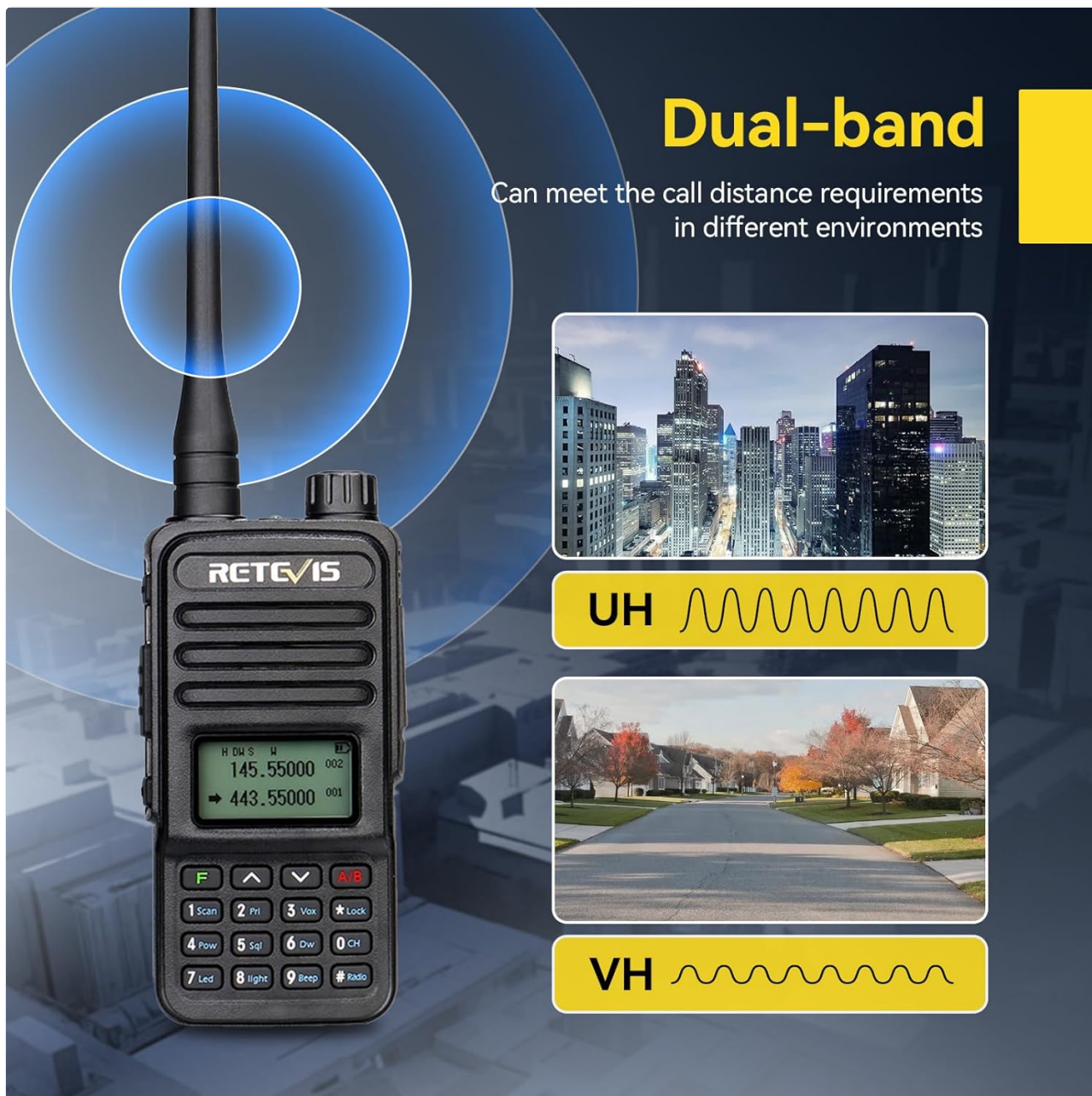
Figure 5.2: Dual-Band Display.

The RT85 features dual-band and dual-display capabilities, allowing you to monitor two frequencies simultaneously. Use the A/B button to switch between the upper and lower display frequencies.