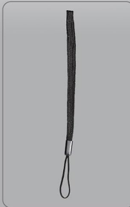
2 x sling