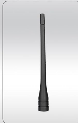
2 x Antenna