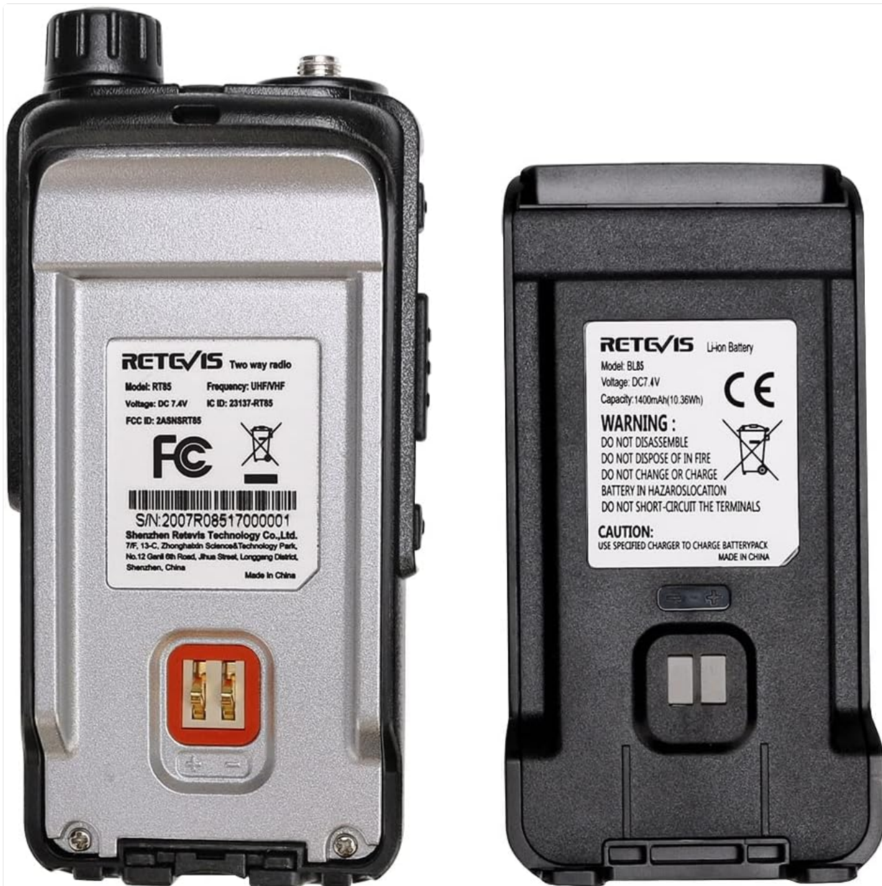
Figure 4.2: Back of the radio and battery with belt clip attachment.