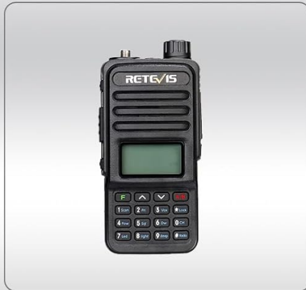
2 x RT85 two-way radio