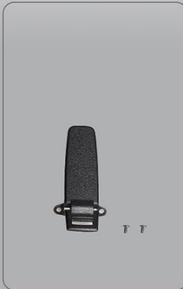
2 x belt clip