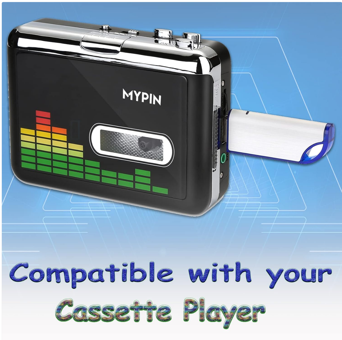
Image: The USB flash drive connected to a cassette player, demonstrating its compatibility for recording or playback with such devices.