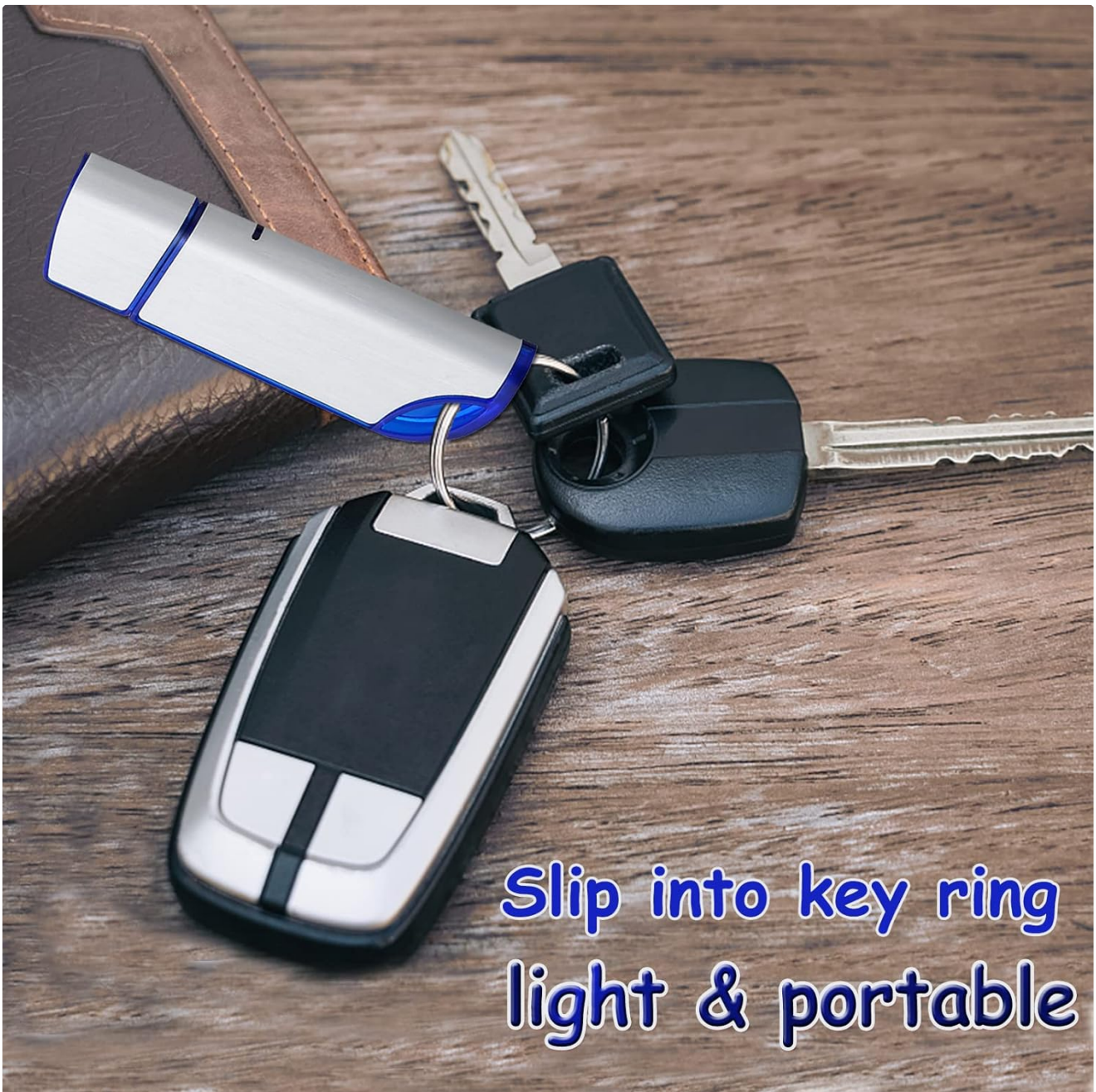
Image: The USB flash drive attached to a keyring, highlighting its portable and lightweight design for easy carrying.