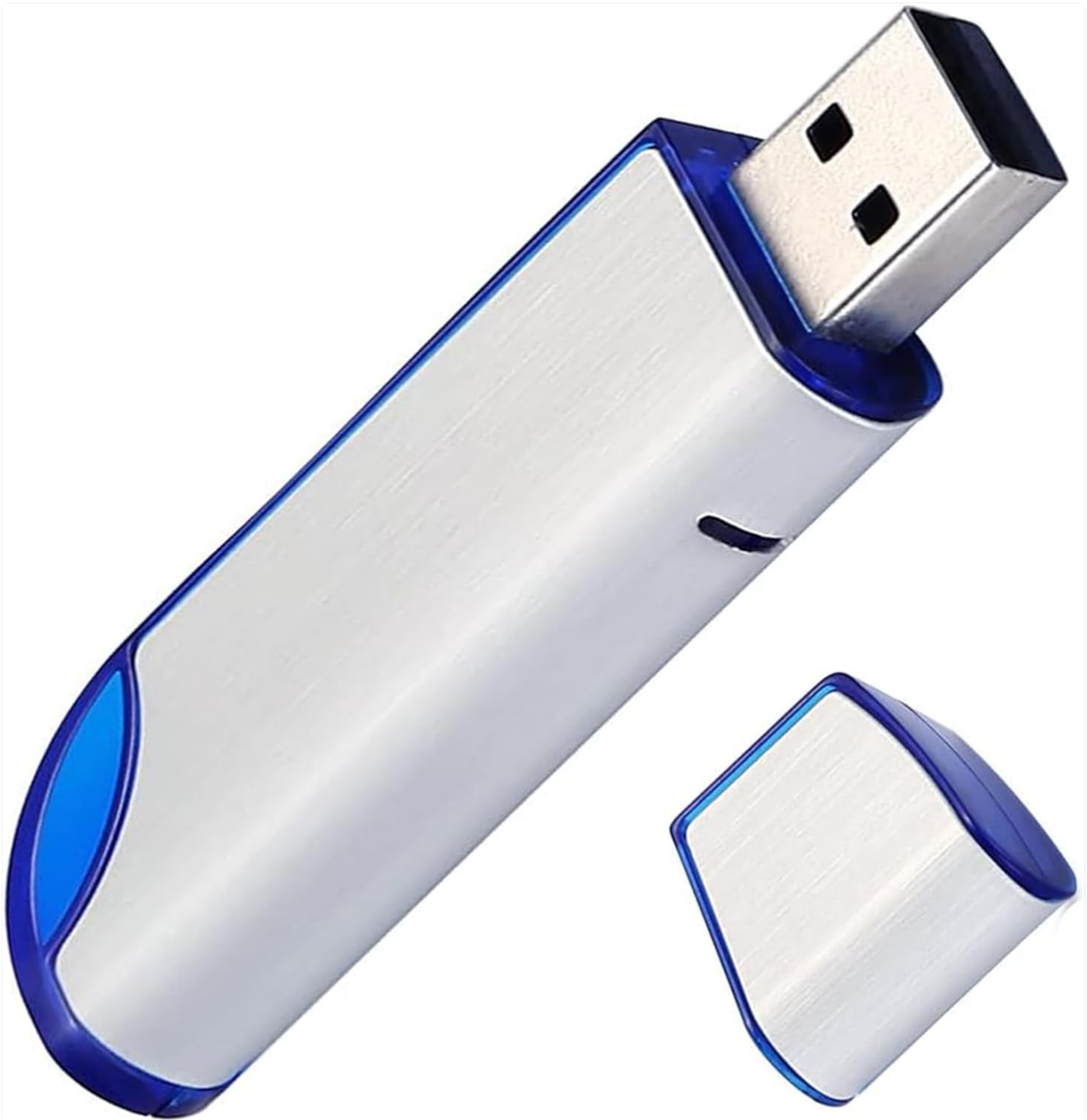
Image: The BlumWay 32GB USB 2.0 Flash Drive, showcasing its white body with blue accents and the removable protective cap.