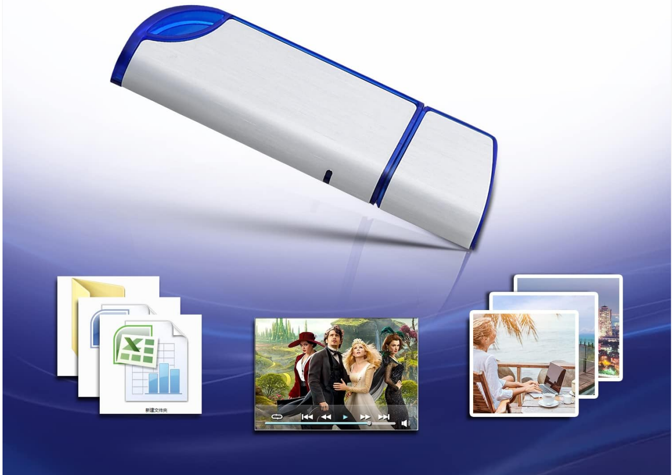
Image: The USB flash drive depicted with icons representing music, photos, videos, and documents, highlighting its versatility for storing various file types.

You can store video, photos, music, file at a quick speed.