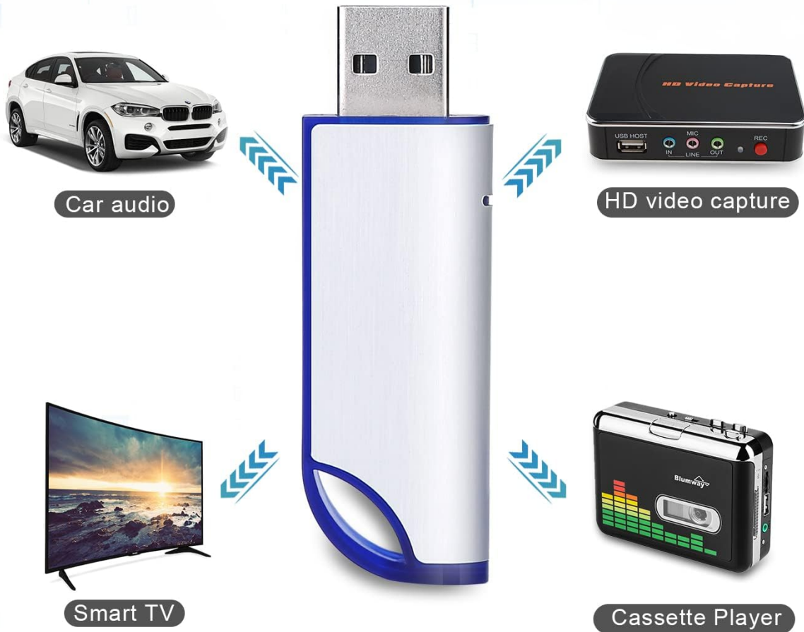
Image: A visual representation of the flash drive's wide compatibility, showing it can be used with car audio systems, HD video capture devices, smart TVs, and cassette players.