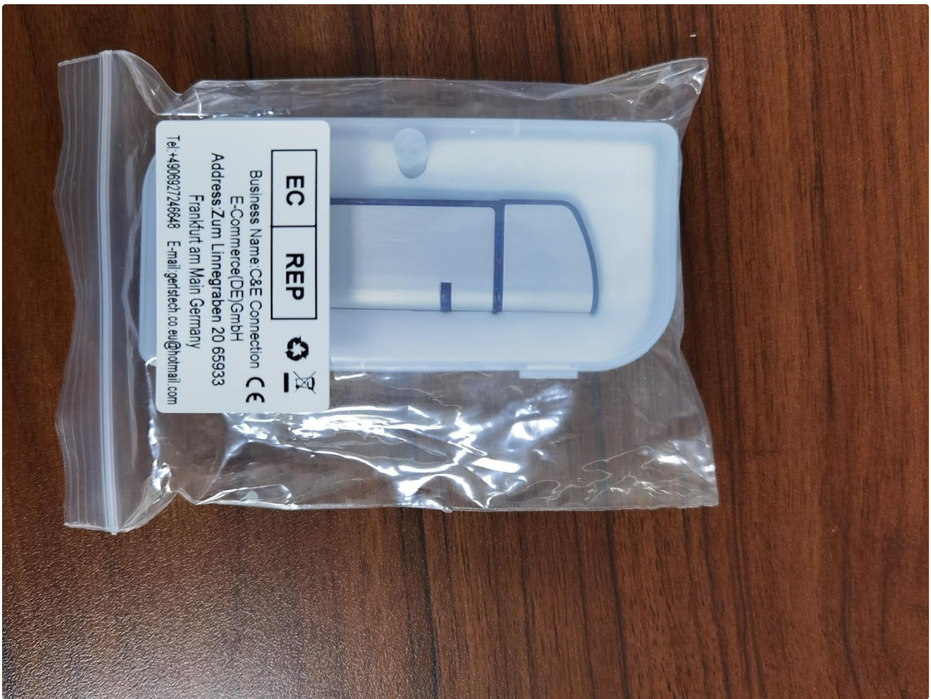
Image: The BlumWay USB flash drive shown within its clear protective case, indicating how it is stored when not in use.