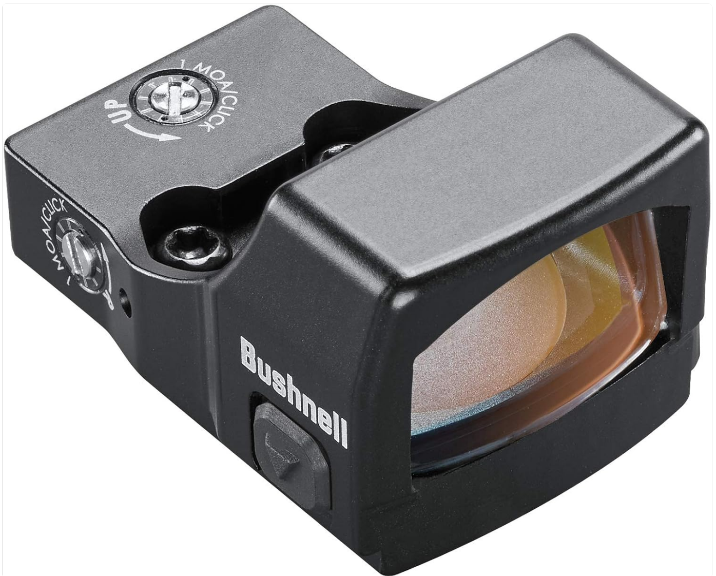
Image: The Bushnell RXS250 Reflex Sight, a compact red dot optic.