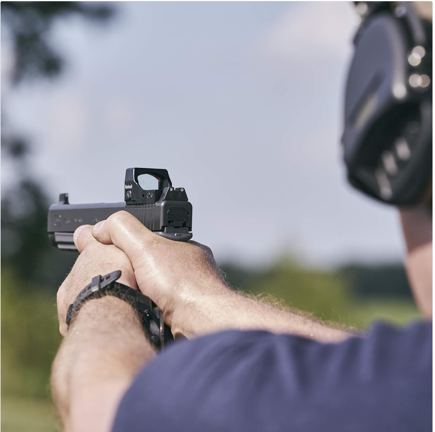
Image: A user aiming a pistol equipped with the Bushnell RXS250 Reflex Sight, demonstrating its practical application.