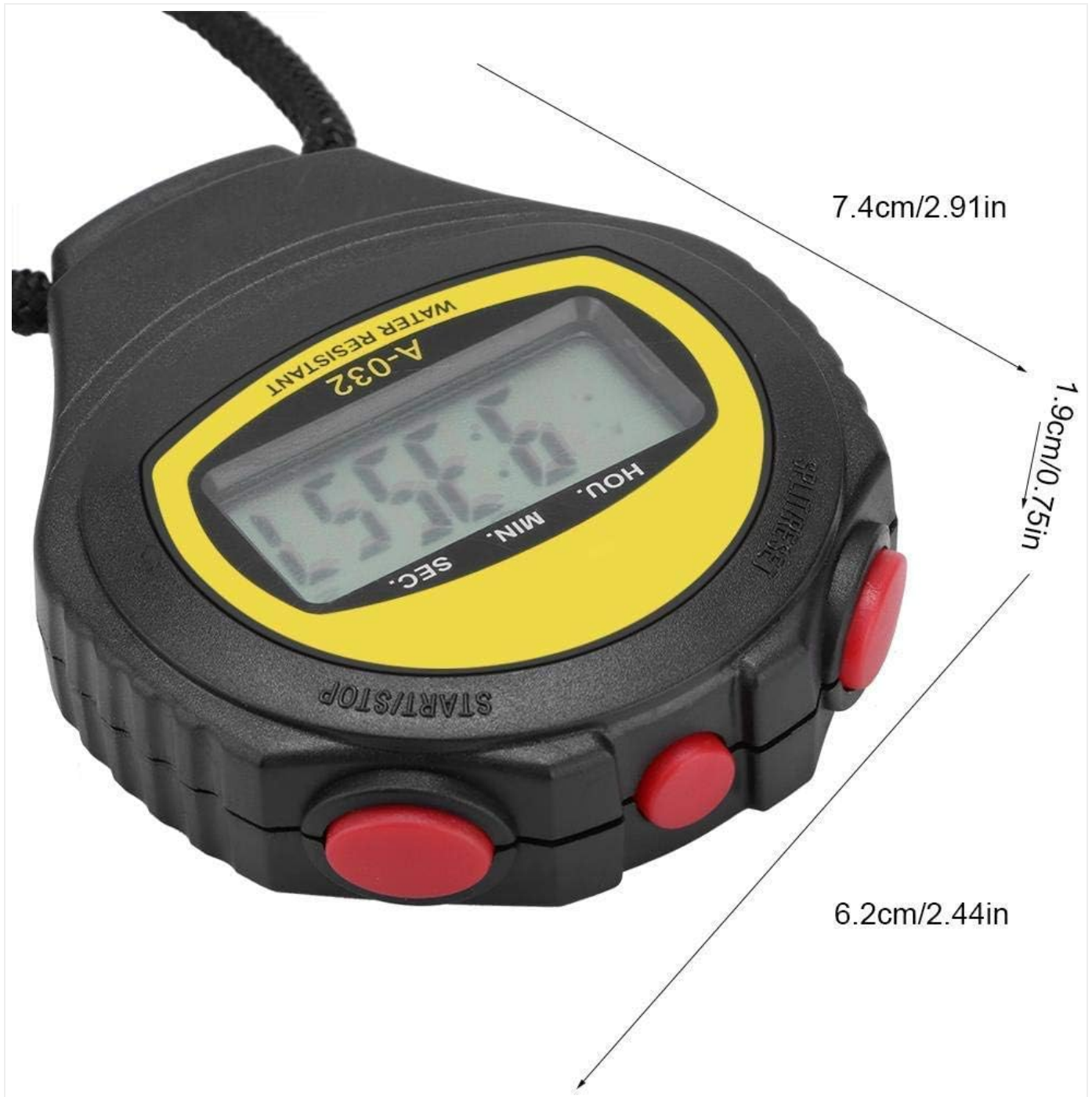
Figure 4: Product dimensions. This image provides a visual representation of the stopwatch's size with measurements.