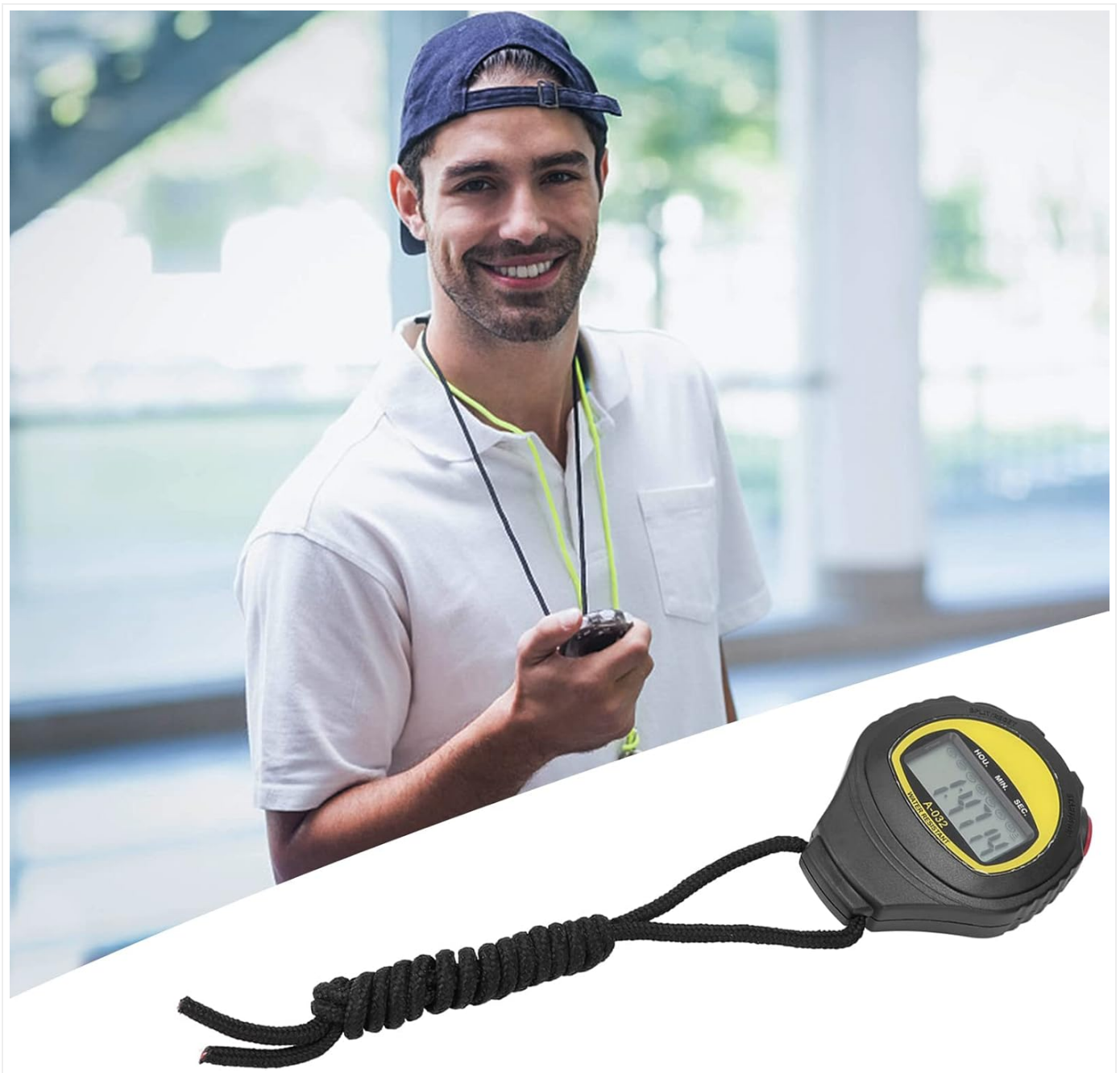
Figure 2: Stopwatch button layout. This image highlights the three main buttons: Start/Stop, Record/Reset, and Reading Timing, essential for setup and operation.