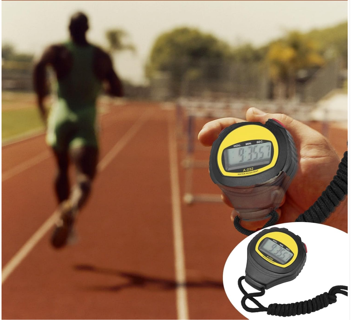
Figure 1: HERCHR Digital Sports Stopwatch. This image shows the stopwatch displaying a time of 9:35:57, held in a hand with a track runner in the background, illustrating its use in sports.