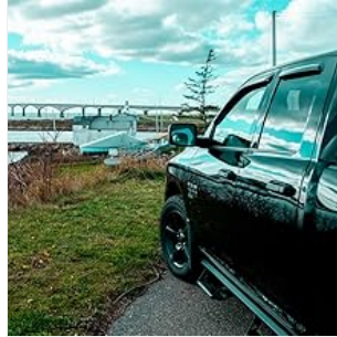
Image 4: Side profile of a truck featuring the installed window visors, demonstrating their aesthetic integration.