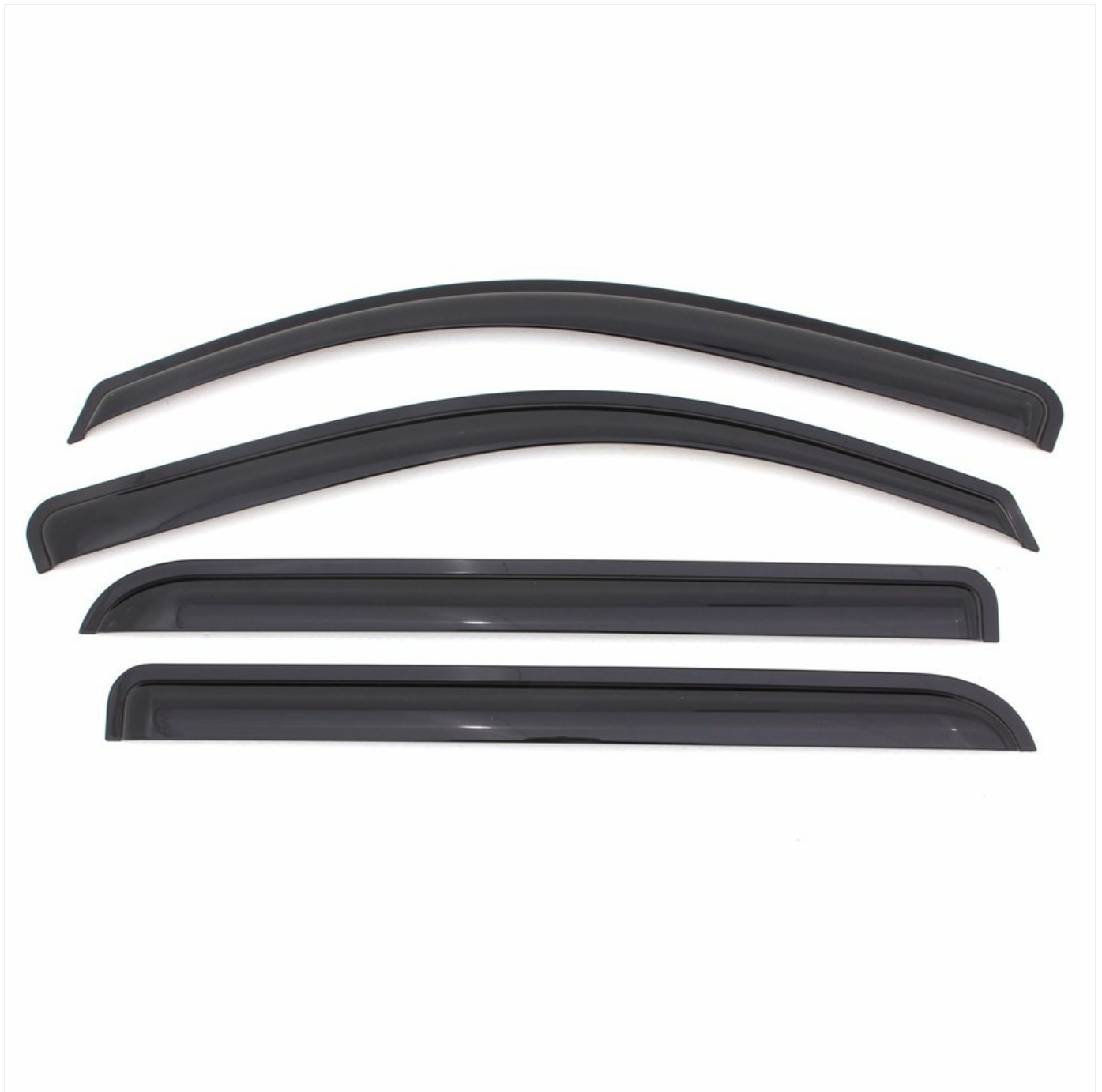
Image 1: Enthuze 4PC Smoked Window Visor installed on a truck, showcasing its sleek design and smoked finish.