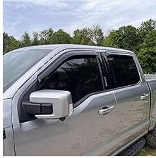
Image 2: A set of four Enthuze window visors, typically included in the package.