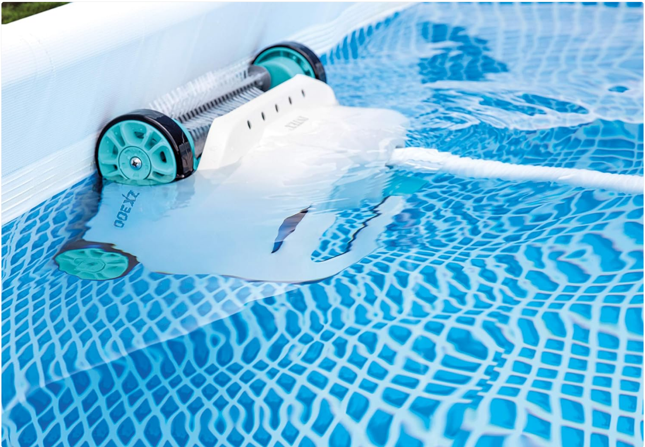
Figure 3: The Intex Zx300 cleaner submerged and operating in a pool.