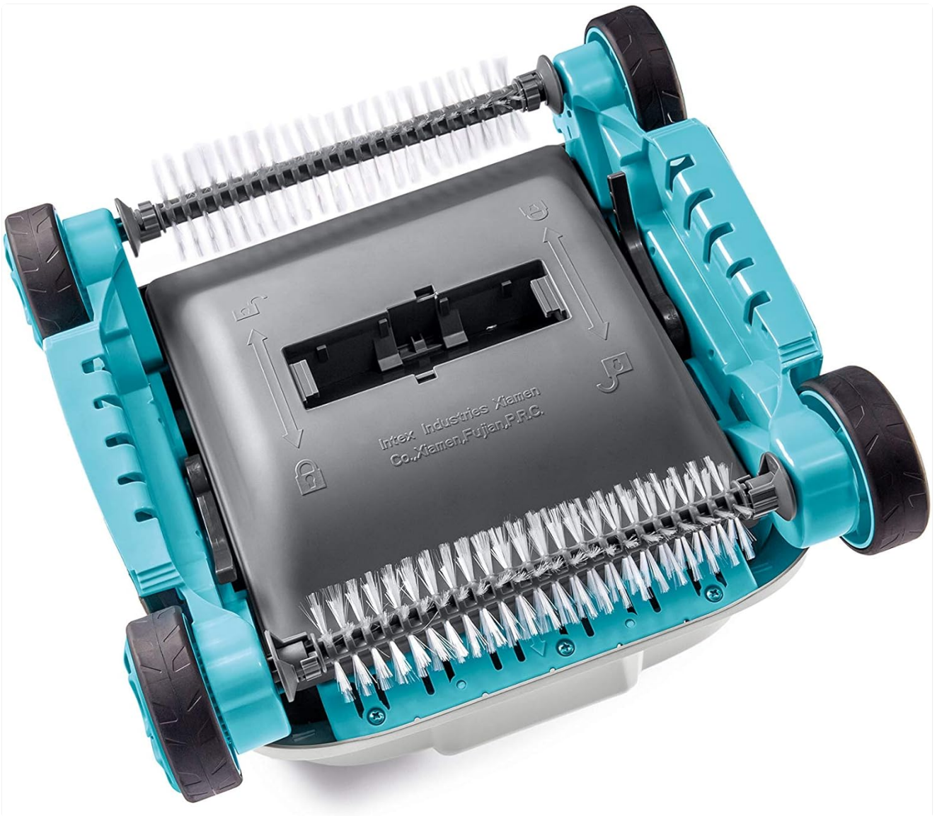
Figure 4: Underside view of the cleaner, showing the brushes and debris collection area.