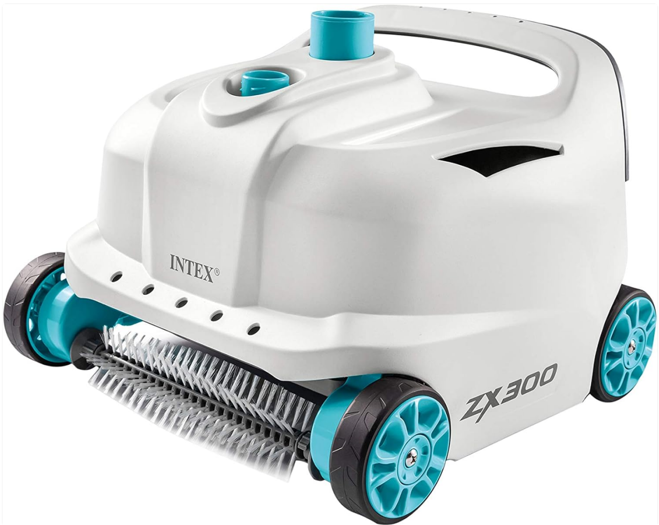
Figure 1: The Intex Zx300 Deluxe Automatic Pool Cleaner, showcasing its compact design and wheels.