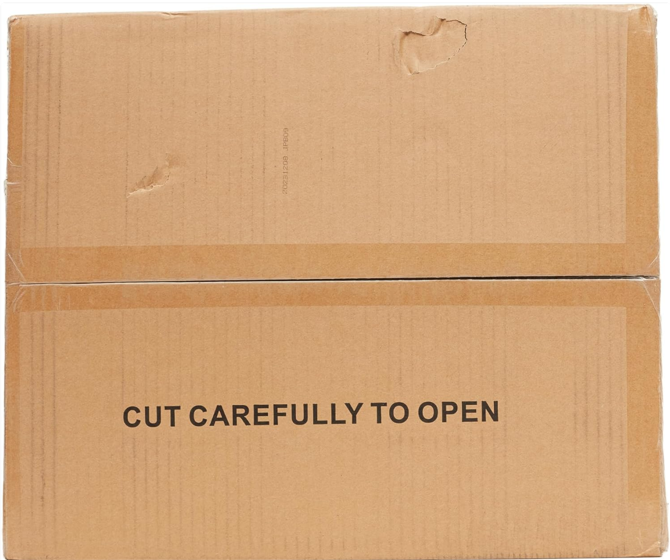
Figure 2: Product packaging indicating Item No. 28005 and product details.