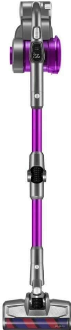
Image: The Jimmy JV85 Pro Cordless Vacuum Cleaner standing upright, showcasing its sleek design and purple accents.