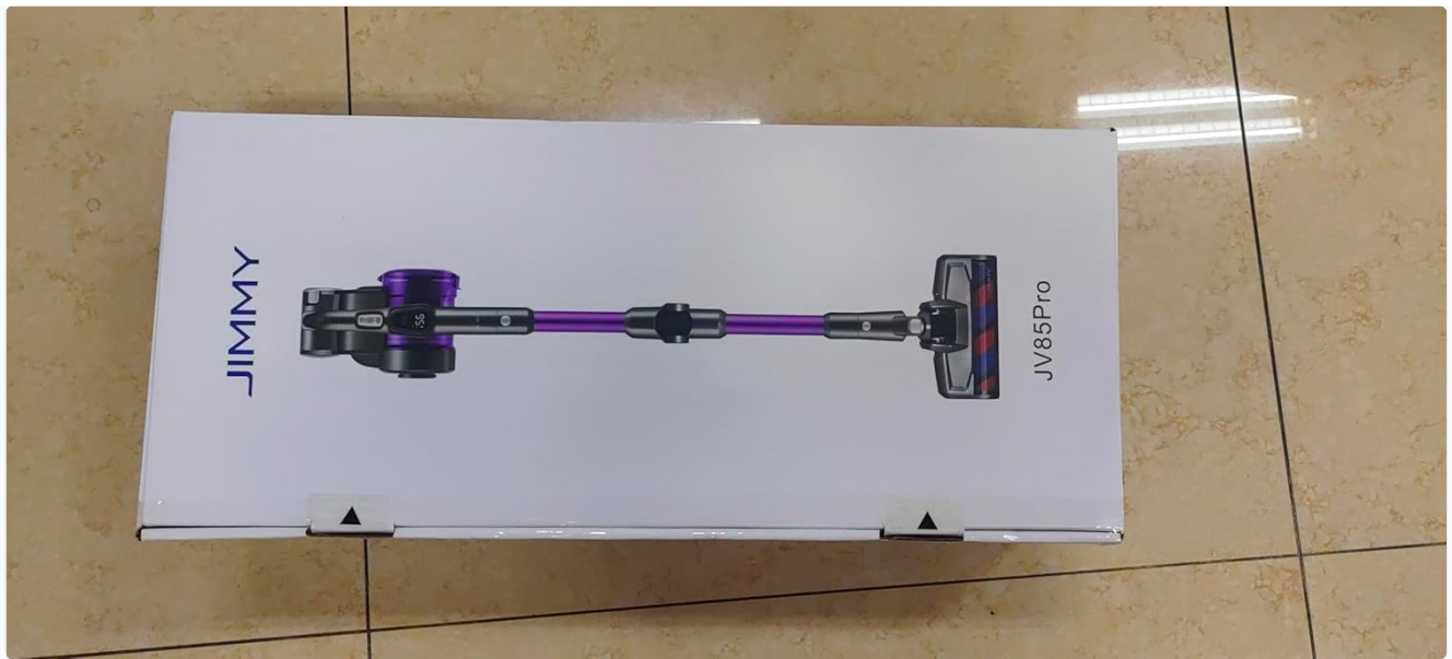
Image: The top view of the Jimmy JV85 Pro Cordless Vacuum Cleaner's retail packaging, displaying the product name and an illustration of the vacuum.