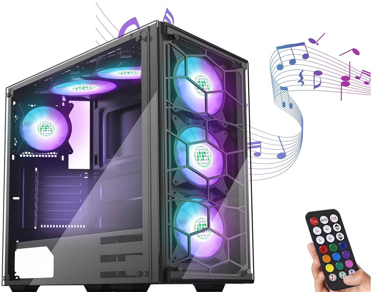
Figure 1: Front and side view of the MUSETEX ATX Mid-Tower Case 907 showcasing its ARGB fans.