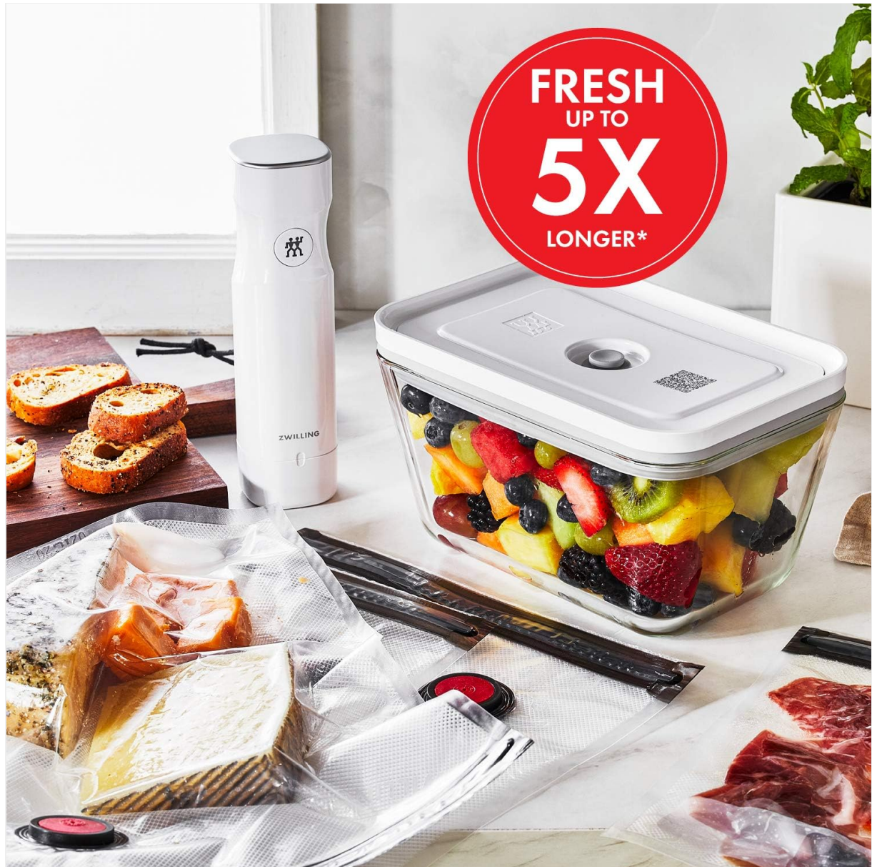
Image 7: Visual representation of food staying fresh up to 5 times longer.