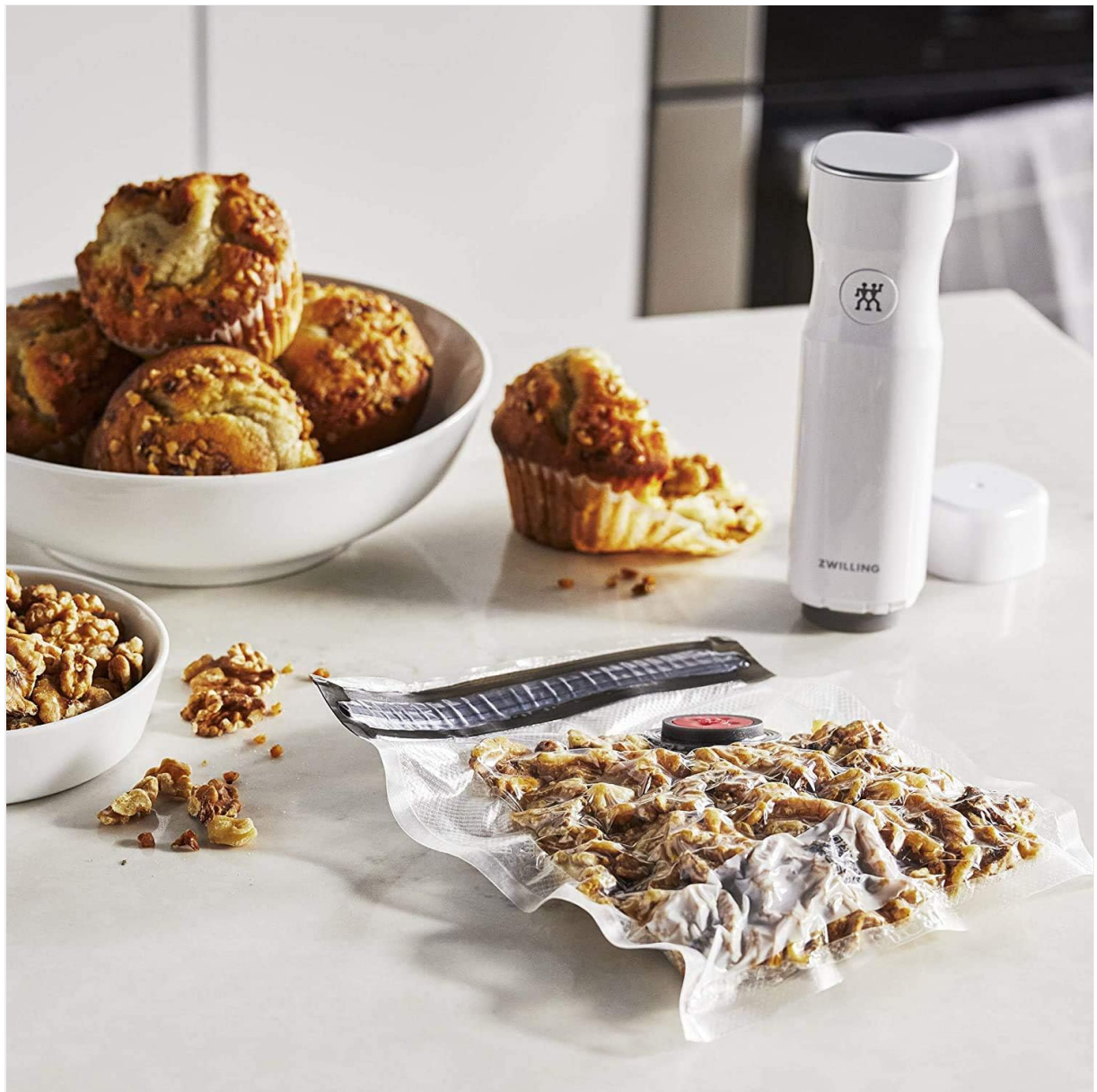
Image 9: Walnuts stored in a vacuum-sealed ZWILLING Fresh & Save bag.