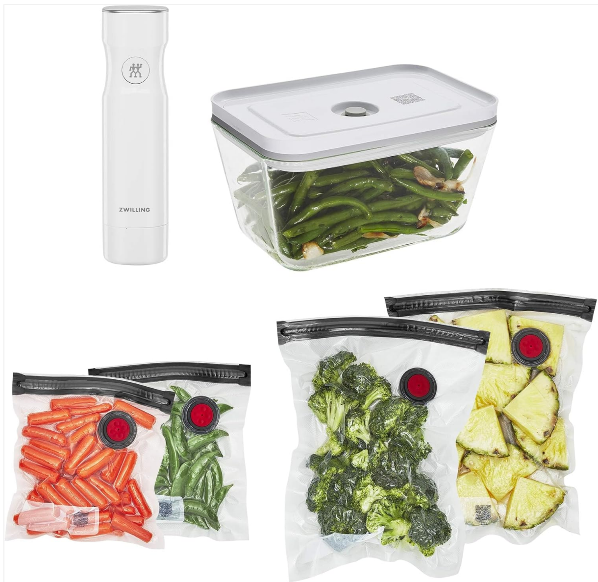
Image 1: Overview of the ZWILLING Fresh & Save Vacuum Sealer Starter Set components.