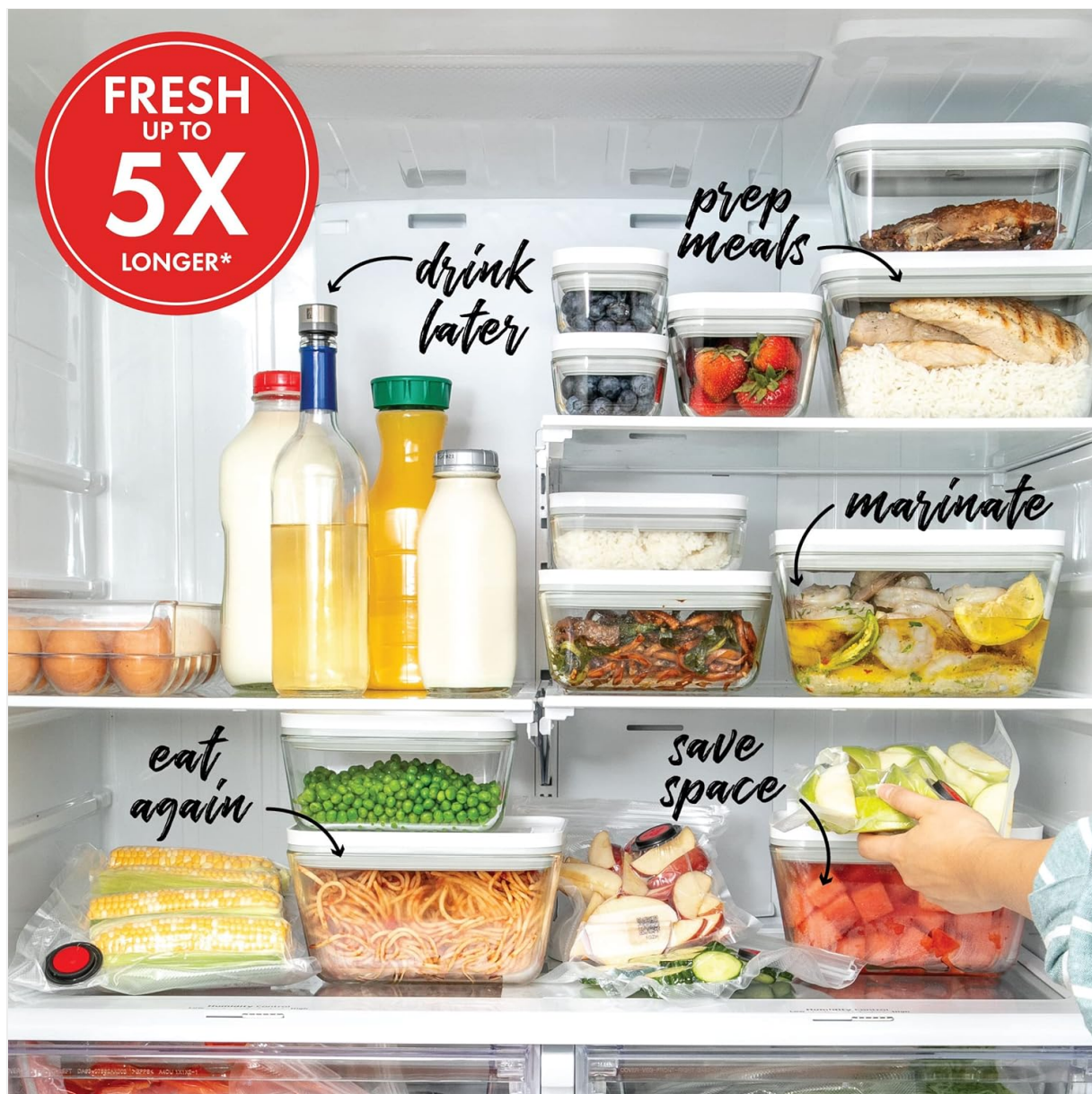
Image 10: A full refrigerator showcasing diverse foods preserved using the Fresh & Save system.