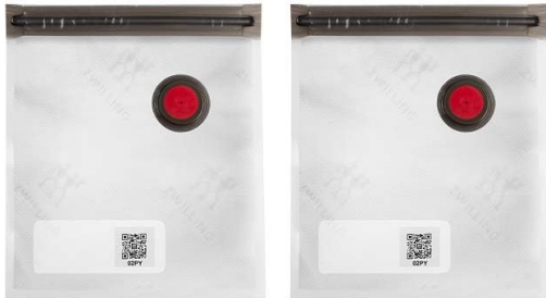
2 Small Bags