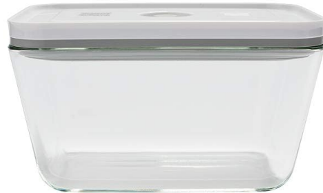
Large Glass Container