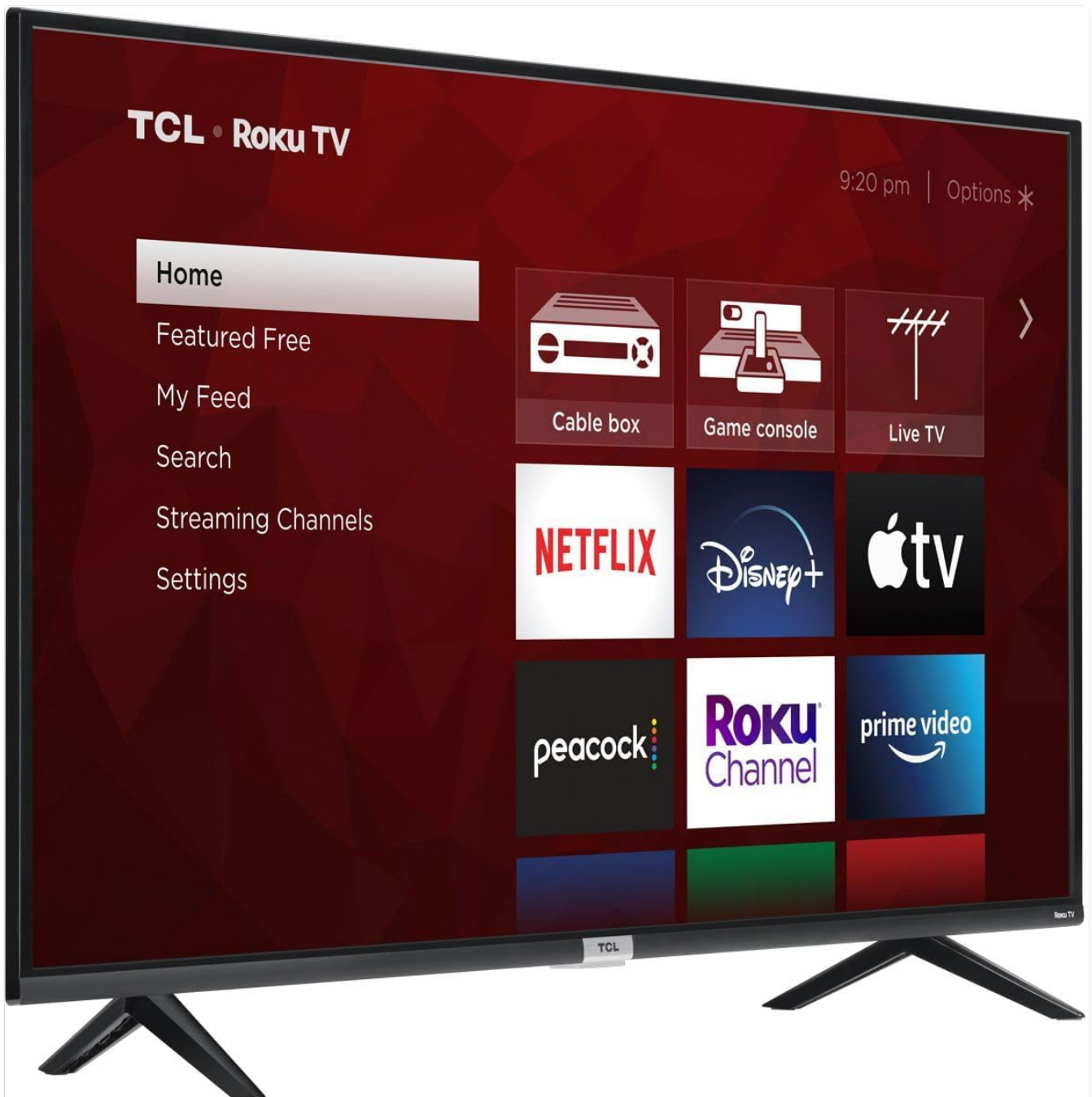
The TCL 50-inch Roku TV, showcasing its sleek design and the intuitive Roku home screen interface.

6. Connect External Devices: Connect your cable box, Blu-ray player, gaming console, or other devices to the available HDMI inputs. The TV features 3 HDMI 2.0 ports with HDCP 2.2 (one with HDMI ARC). An additional USB port is available for media playback.