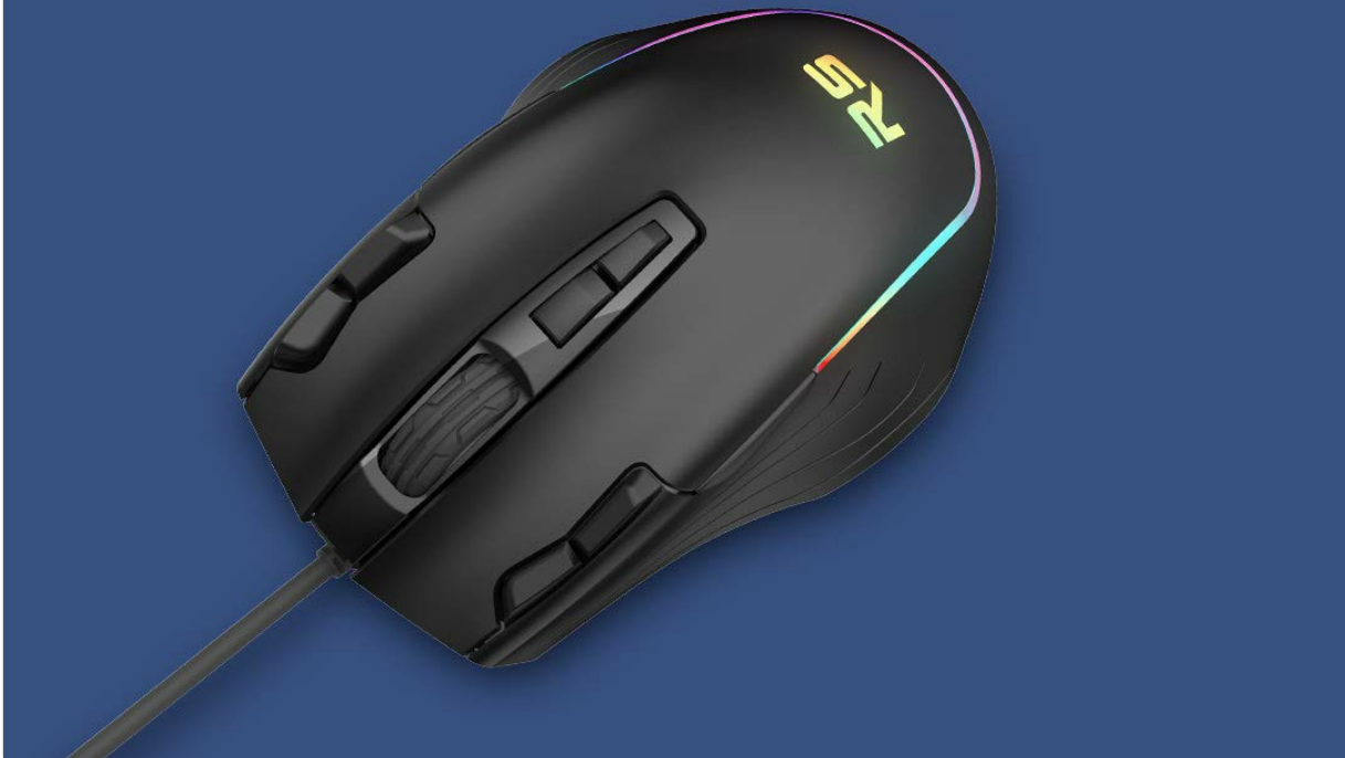
Figure 1: Riversong Click GT GM02C Wired Optical Mouse

Gaming Type | 11 Buttons Design | 1680 RGB Color