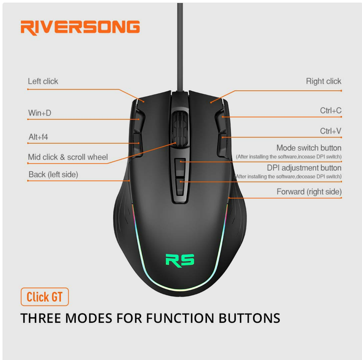
Figure 2: Riversong Click GT GM02C Wired Optical Mouse with Button Layout

The mouse includes standard left and right click buttons, a scroll wheel with middle-click functionality, two side buttons (Back and Forward), a dedicated DPI adjustment button, and a mode switch button for advanced functions.