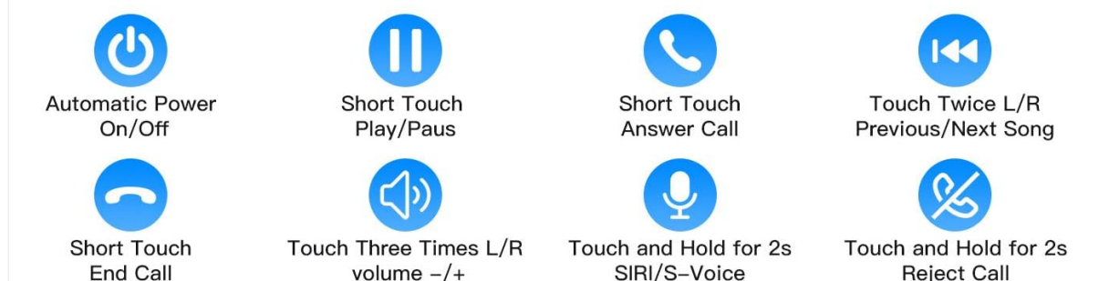
Figure 2: Multi-function Button Controls. This image details the physical features of the earbuds and charging case, including the Type-C charging port, microphone, magnetic charging points, and a comprehensive guide to touch control gestures for power, play/pause, call management, track navigation, volume, and voice assistant activation.