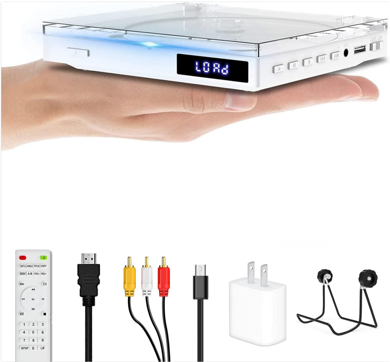
Image: The MAITE MTDVD-XTP Mini DVD Player shown with its remote control, HDMI cable, RCA cable, USB Type-C power cable, power adapter, and the included stand.