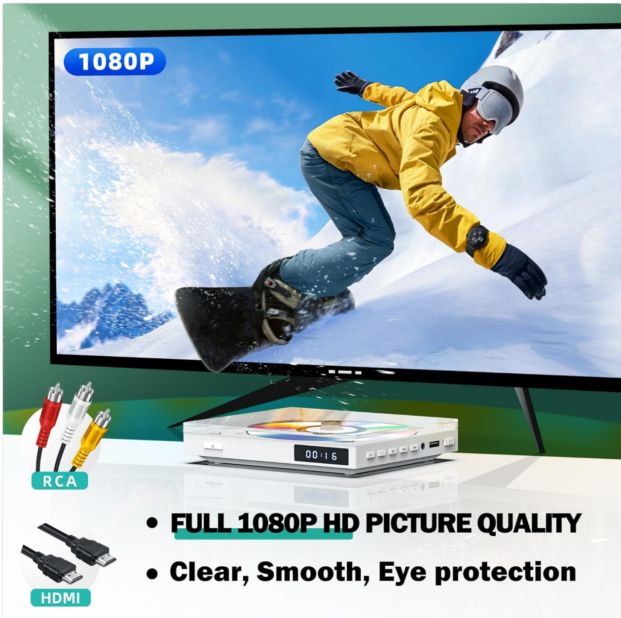
Image: The MAITE MTDVD-XTP Mini DVD Player connected to a television, demonstrating its 1080P output capability for clear and smooth picture quality.