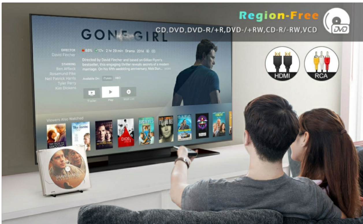
Image: The MAITE MTDVD-XTP Mini DVD Player positioned vertically in its dedicated stand, illustrating its stable design and space-saving capability.

The included stand allows for vertical placement of the DVD player, optimizing space. Insert the DVD player into the stand, ensuring it is stable. The stand is designed to hold the player securely at various angles (e.g., 30°, 45°, 90°).