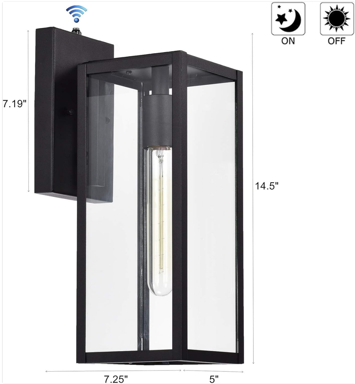
Image 4.1: Dimensions of the MICSIU Outdoor Wall Sconce, showing a height of 14.5 inches, width of 5 inches, and depth from wall of 7.25 inches.