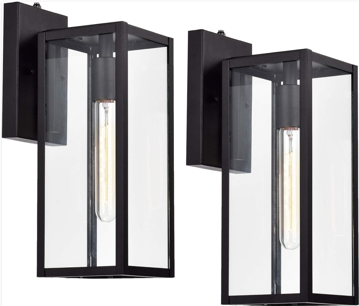
Image 1.1: Two MICSIU Dusk to Dawn Outdoor Wall Sconces, showcasing their modern black metal frame and clear glass panels.