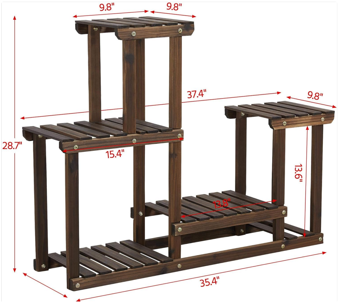
Figure 3: Dimensional overview of the plant stand, providing key measurements for planning placement.