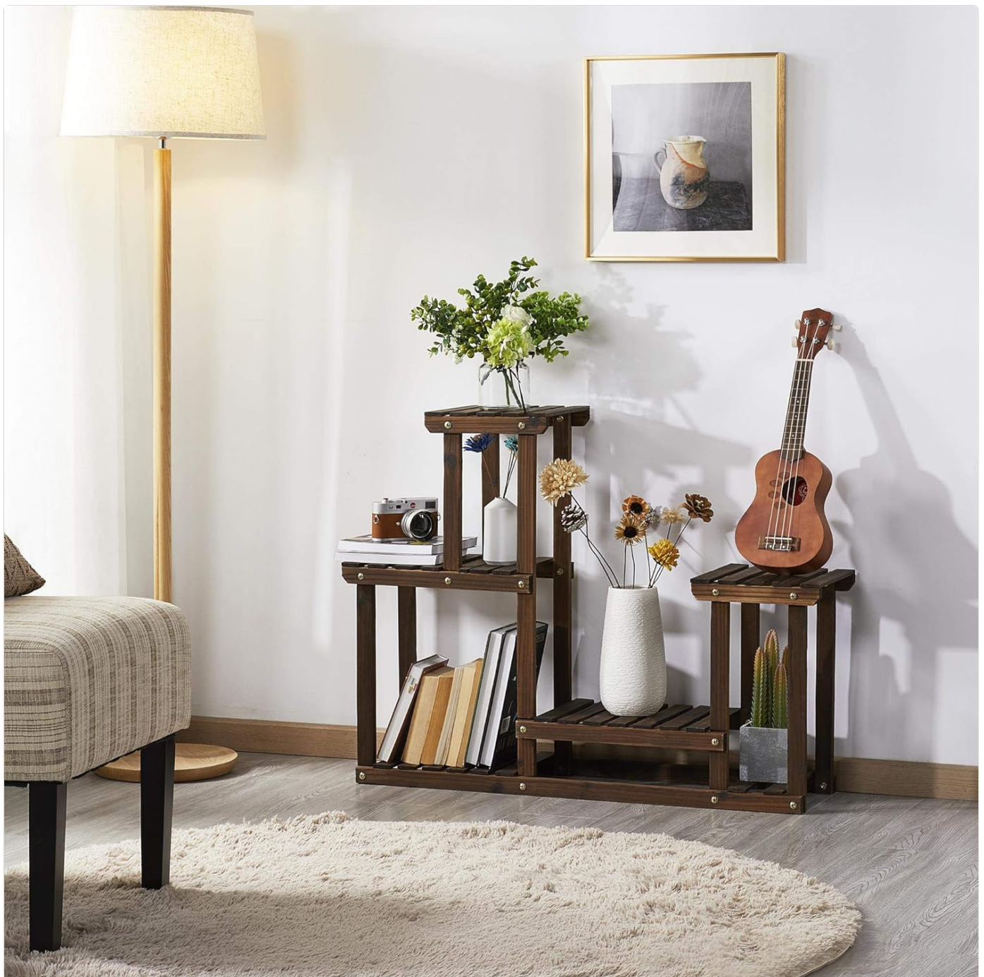
Figure 6: The plant stand utilized indoors as a versatile decorative shelf, holding books and various small items.