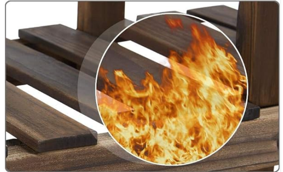
High-Temperature Carbonization Treatment