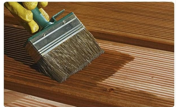
Varnished Surface Protection