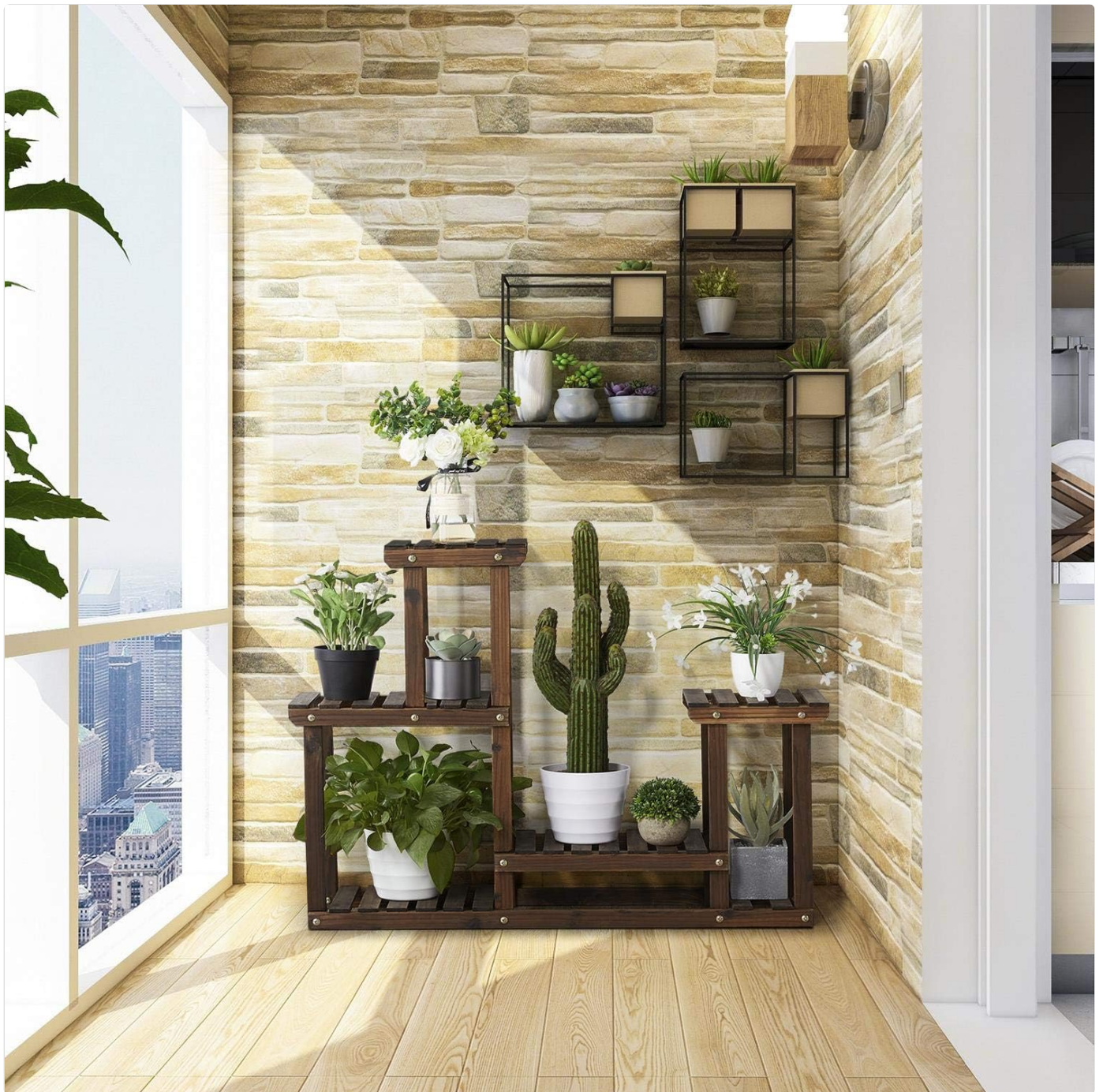
Figure 5: The plant stand positioned on a balcony, illustrating its suitability for outdoor plant display.