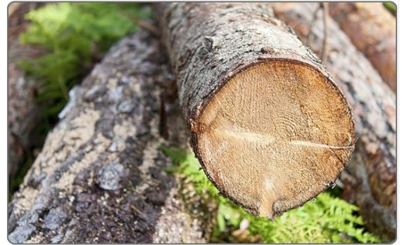
Made of Natural Fir Wood