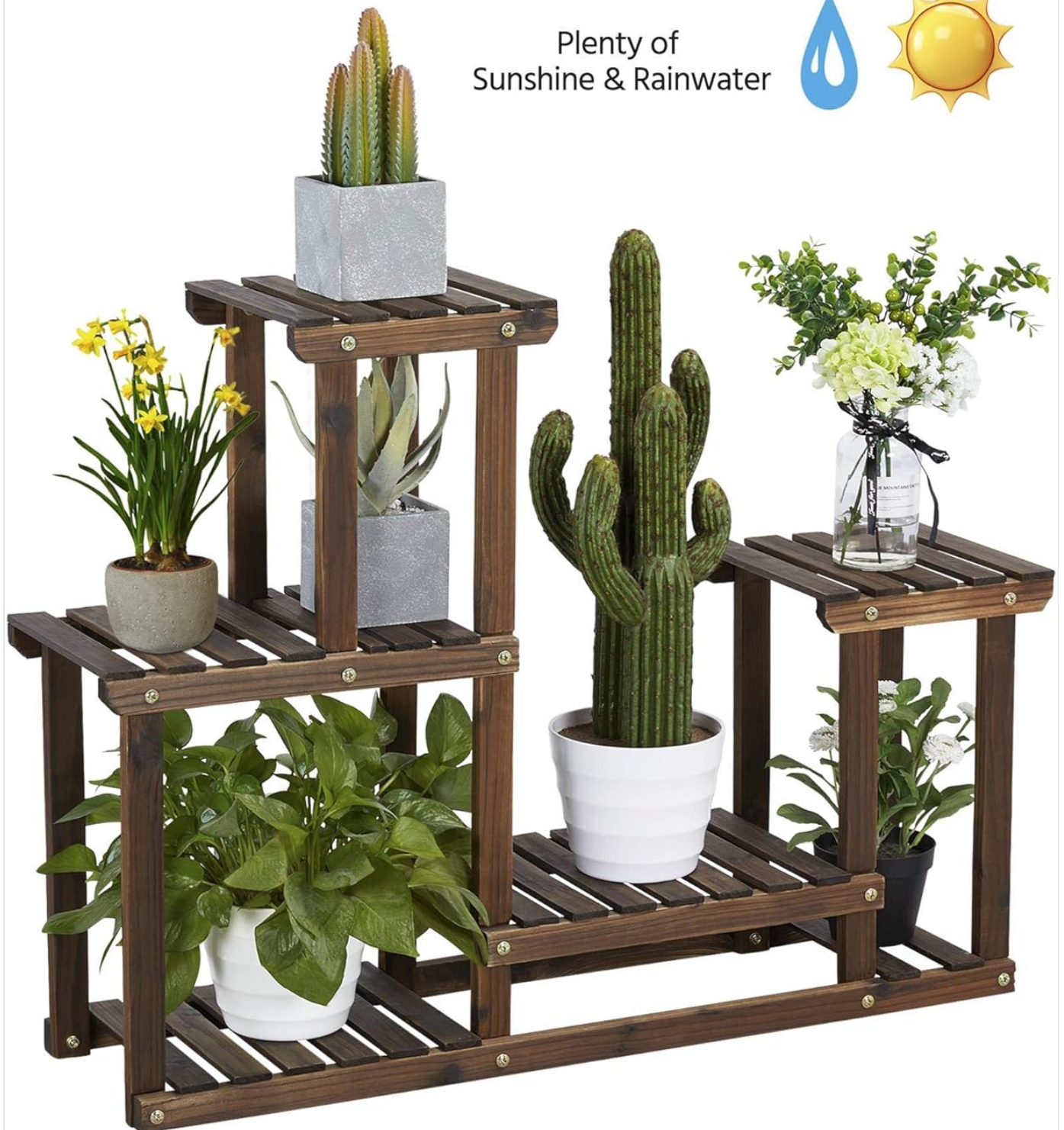
Figure 2: Illustration of the high-low structure and slatted design, which facilitates optimal light exposure and air circulation for plants.