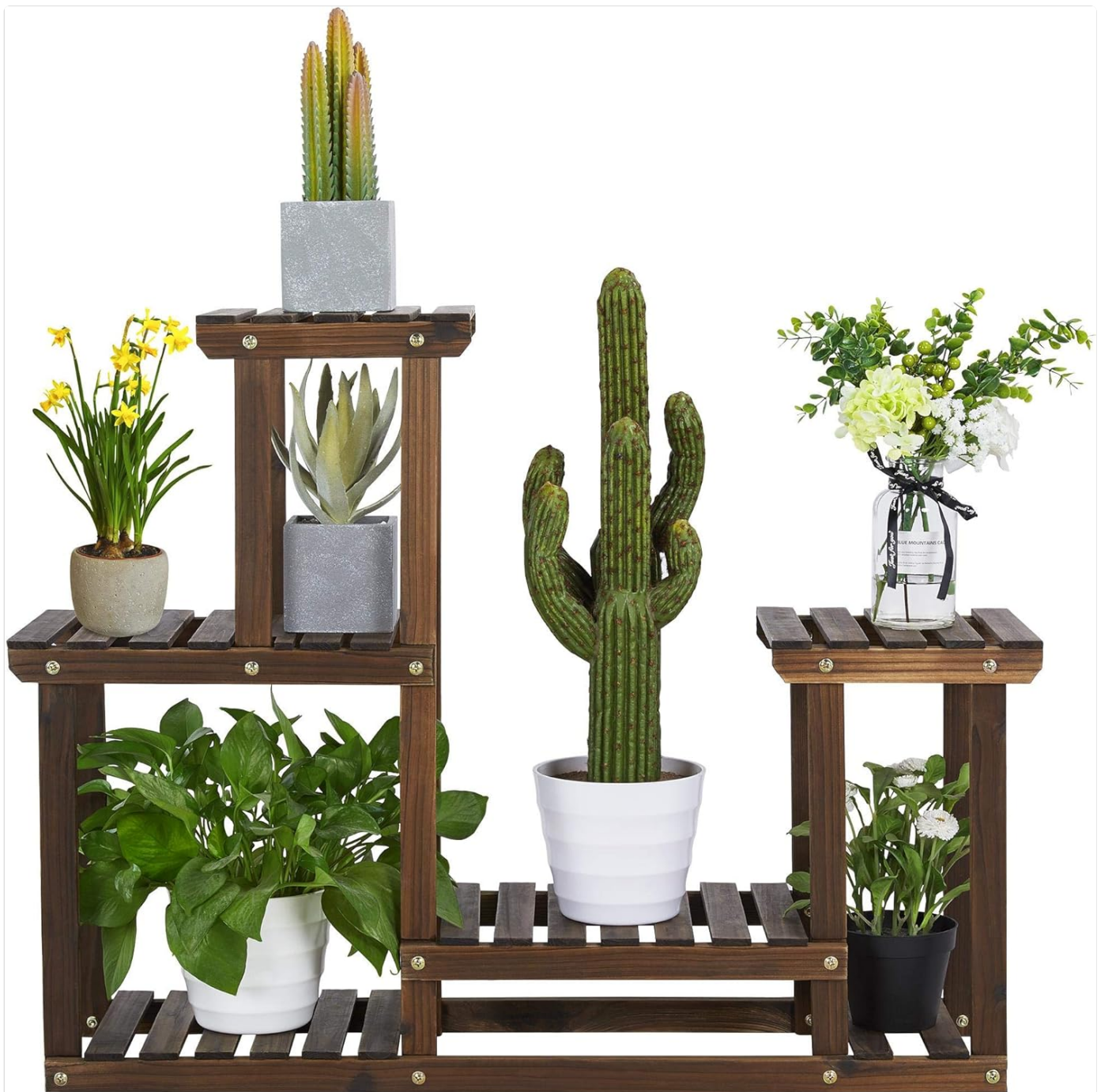
Figure 1: The Yaheetech Multi-Tiered Plant Stand showcasing a variety of potted plants, highlighting its multi-level design and dark wood finish.