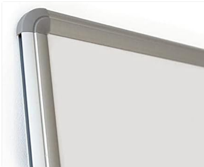
Image: Close-up of the whiteboard's corner, illustrating the robust aluminum frame and grey plastic corner cap. This detail highlights the design and construction of the board, relevant for understanding mounting points.