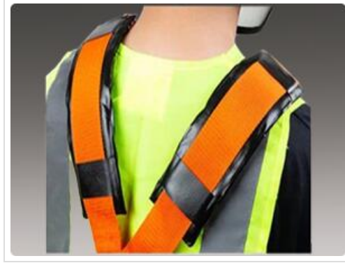
Figure 3: The ergonomic harness features broad back support, shoulder straps, and a hip belt to distribute the load evenly, enhancing user comfort and efficiency.